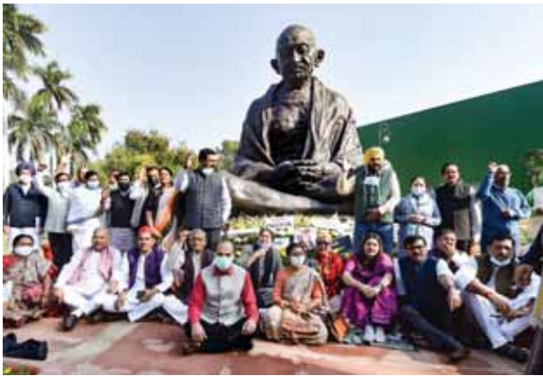
Opposition parties' MPs participate in a protest near Mahatma Gandhi's statue demanding revocation of the suspension of 12 Rajya Sabha members, during the Winter Session of Parliament, in New Delhi, on Tuesday

Besides Congress president Sonia Gandhi has convened a meeting of the Congress Parliamentary Party in