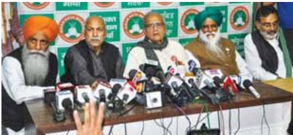
Samyukta Kisan Morcha leaders address a Press conference after their meeting to decide their future course of action in New Delhi on Tuesday

"The Government sent a proposal, it was discussed and presented before all members under the aegis of the Samyukta Kisan Morcha (SKM) and sent it to the