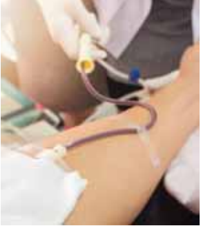
An ICMR trial of 400 patients last year, known as the PLACID trial, found no significant benefit

Earlier this year, the use of convalescent plasma was removed from the Indian Council for Medical Research's recommended guidelines for Covid-19. Despite the fact that