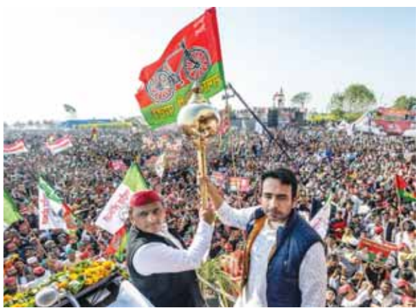
Samajwadi Party chief Akhilesh Yadav with RLD leader Jayant Chowdhary during a SP-RLD rally in Meerut on Tuesday

Addressing the gathering, Akhilesh said if the alliance comes to power after next year elections, the first work will be to build a memorial for "martyrs" of the farmers' protest. He attacked the ruling BJP saying the "2022 election will see the eclipse of the BJP from western UP, as the ruling party has practiced the politics of lying