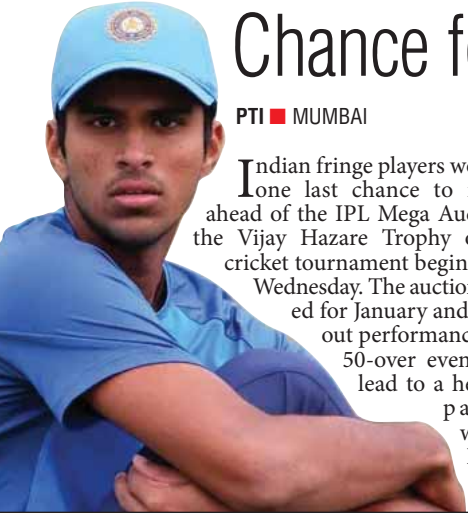
MUMBAI

If Hardik doesn't play the domestic tournaments, he will not be considered for a comeback in the Indian side for the white ball tournaments. "The current national selection committee has told all the players that all those who are not in the India squad should go back and play domestic cricket — Hazare and Ranji Trophy," the source added.