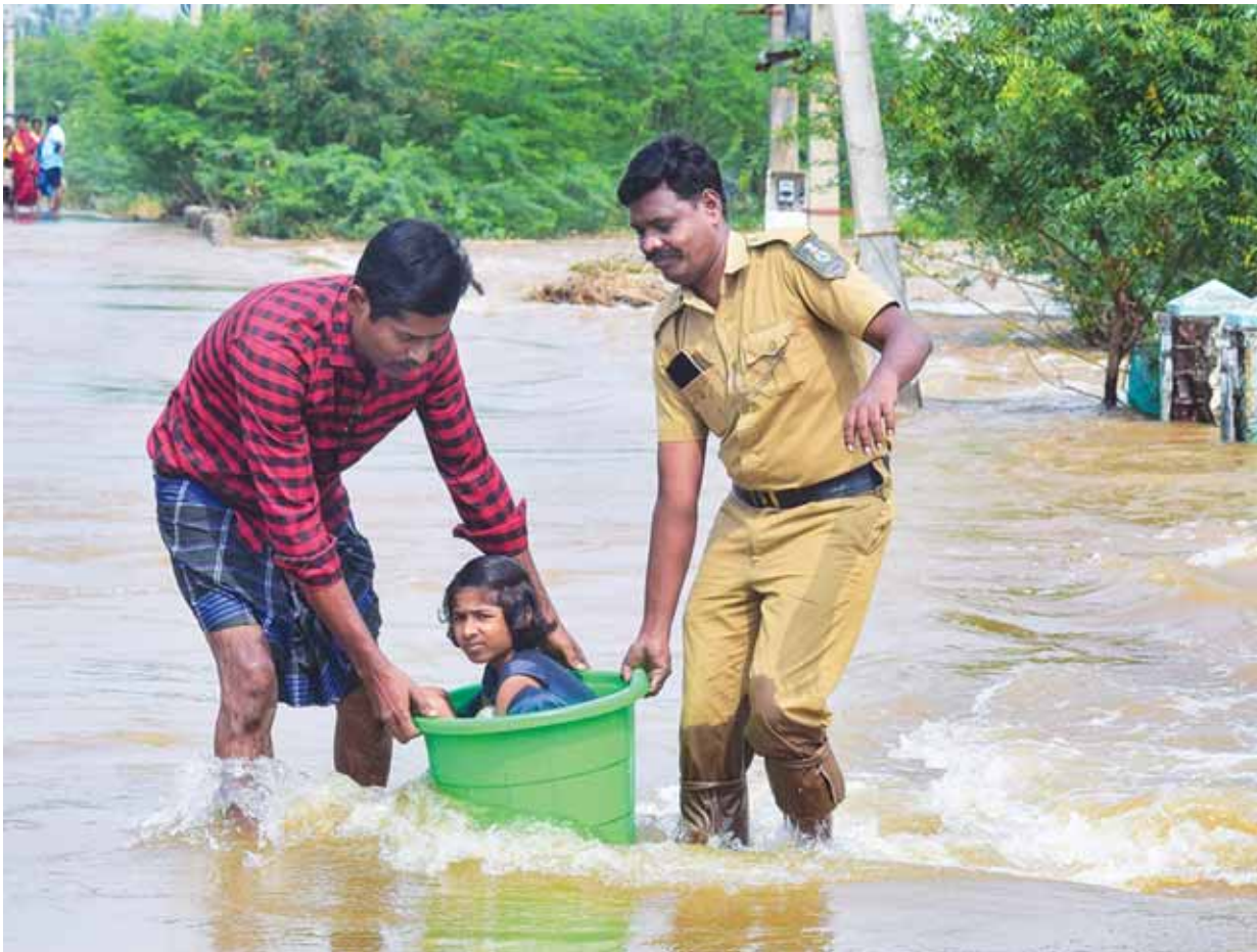
A child sitting in a bucket being evacuated by a man and a policeman from a flooded area of Verma Nagar due to the overflowing Ariyar river following heavy rain, in Trichy district on Tuesday PTI

Mirzapur: Two sisters and a brother, aged three to seven-years, were burnt to death at Pachokhara Khurd village in Madihan area of the district here, police said. The children were sleeping on a pile of straw in the barn on Monday evening when it caught fire, police said.