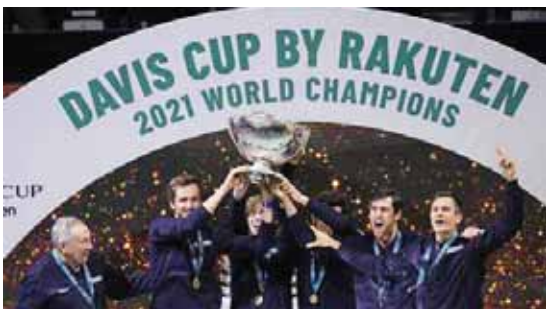
SYDNEY

Novak Djokovic has been named in the Serbian team for January's ATP Cup, an indication that Djokovic could play in the Australian Open a week later despite controversy over his vaccination status.