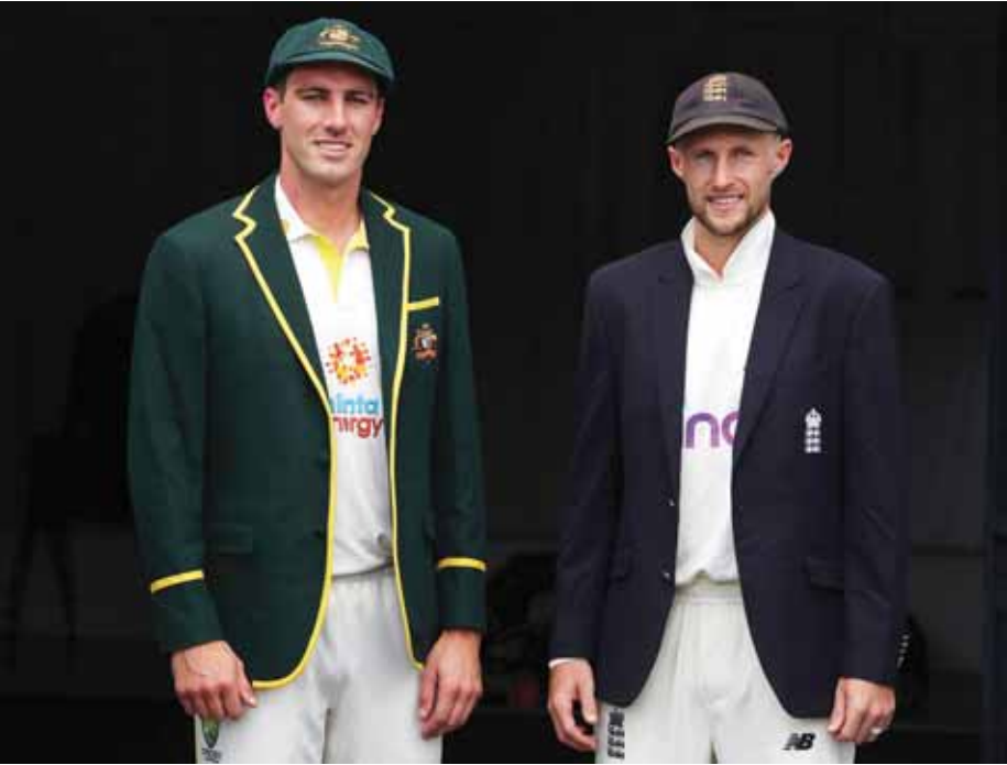
AP ■ BRISBANE

It will be 181st Test match between the two teams in Australia and 352nd overall. Australia have won 95, lost 57 and draw 28 in 180 previous Test matches played against England at home. Overall, Australia have won 146, lost 110 and draw 95 in 341 Test matches played against England Australia have won 33, England 32 in 71 Ashes series played between the two teams. The remaining six series ended in a draw. The last series played in England in 2019, were drawn, both teams have won two matches each while one match ended in a draw