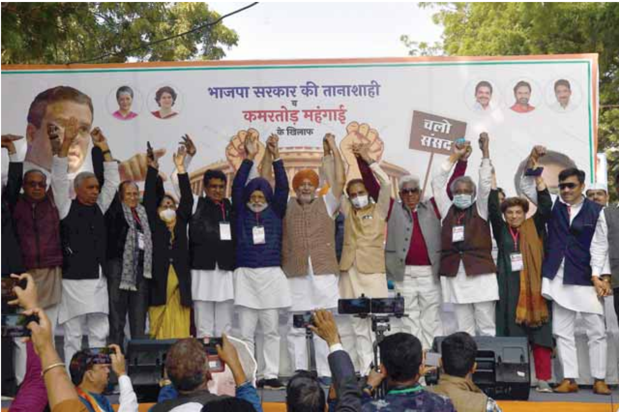
Delhi Pradesh Congress Committee members during their Sansad Gherao protest against spiralling prices, at Jantar Mantar in New Delhi on Tuesday