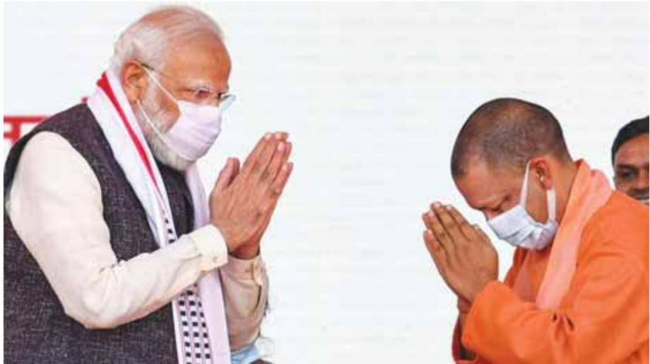
Prime Minister Narendra Modi and Uttar Pradesh CM Yogi Adityanath at the launch of various development projects, in Gorakhpur on Tuesday

Questioning the ideological commitment of BJP's political rivals, Modi said "lal topiwalas" discarded the ideologies of Ram Manohar Lohia and Jai Prakash Narayan long back.