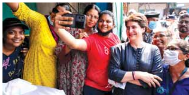
AICC general secretary Priyanka Gandhi Vadra interacts with women belonging to tribal community at Morpirla village in Goa

A group of Congress leaders from the Goa's Porvorim Assembly constituency resigned this morning. The group, supported by Independent MLA Rohan Khaunte, claimed the Congress was not serious about contest-