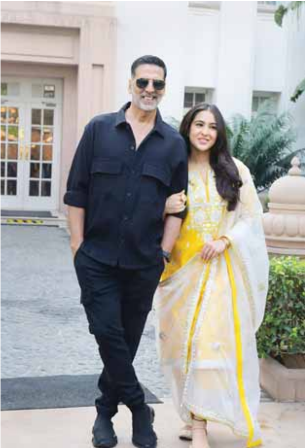
Bollywood actors Akshay Kumar and Sara Ali Khan during the promotion of their upcoming movie 'Atrangi Re' in New Delhi on Friday

"Priyanka is fighting on the roads and giving the direction. Candidates have to work hard. There are signs of change. Congress workers are fighting, even Priyanka Gandhi was sent to jail four times.