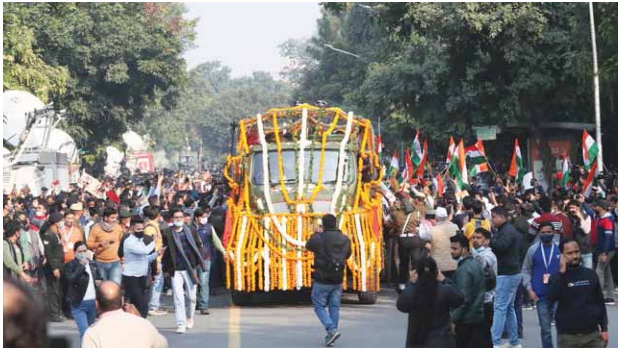
Funeral procession of late Chief of Defence Staff (CDS) Gen Bipin Rawat from his residence to Brar Square in Delhi cantonment where he was cremated with full military honours in New Delhi on Friday