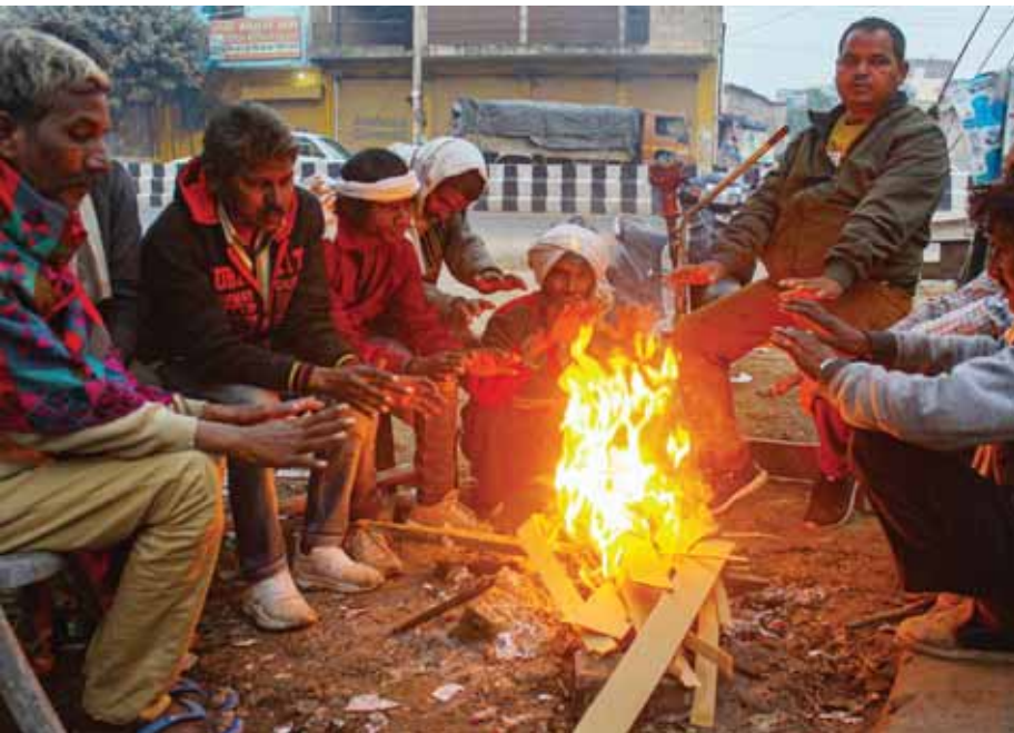
People sit around a bonfire to warm themselves on a winter morning in Gurugram on Friday

people to pray there. Meanwhile, members of the Sanyukt Hindu Sangharsh Samiti and the Muslim organisation jointly paid tributes to General Rawat in Sector-29. Namaz was also disrupted in a park located in Sector-44 by members of the Hindu Right-wing, but police presence in the area prevented any major incident. At Sector-37 Namaz location local villagers and Hindu Right-wing members said that next Friday, they will organise a family kitchen (Bhandara) at the same location.