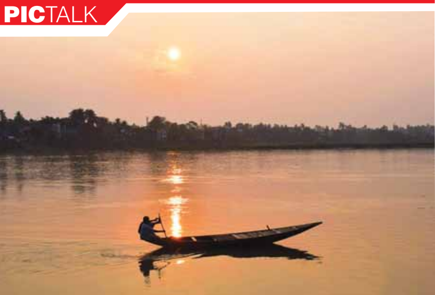
A fisherman sails his boat across the Hooghly during sunset, in Nadia

At the extreme right is the patriarchal argument that bringing more women into politics might destroy the age-old concept of the ideal family that revolves around women whose main job is to rear children and take care of the house. A patronising argument is that women entering Parliament with the help of a quota would not be perceived to be competing on merit. A third argument defending patriarchy is that the principle of seat rotation in the women's reservation Bill would not incentivise men to work for their constituencies because they may not be around for re-election the next time. On the other hand, women have not justified being satisfied with only a 33 per cent reservation when they are breaking glass ceilings even without quotas and on merit in all spheres. Why settle for a third when the constitutional amendments in 1993 to increase women's participation in decision-making at the panchayat level provided a 50 per cent reservation? Yes, the patriarchy opposed the amendments at that time, saying they would only promote proxy politics, that is elected women being rubber stamps of their husbands. True, but in all these years, we have seen women's awareness and their representation in the local bodies only grow in the rural areas. It is for women, not the will of patriarchy, to decide how they will break the country's biggest glass ceiling: Parliament.