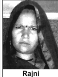
Rajni Patel Nagar, Delhi. The description of missing/kidnapped female is as under : Age : 30 years, Height : 5'1", Face : Round, Complexion : Fair, Built : Medium, Wearing : Not known

If anyone having any clue/information, about the missing/kidnapped female kindly inform the following:-