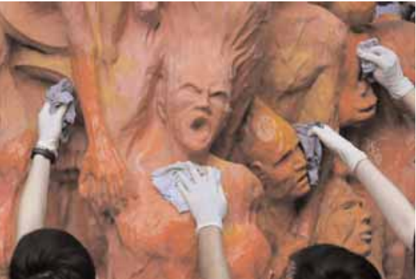
University students clean "Pillar of Shame" statue, a memorial for those killed in 1989 Tiananmen crackdown, at University of Hong Kong on June 4, 2019. A monument at a Hong Kong university that commemorated 1989 Tiananmen massacre was boarded up by workers late on Wednesday, prompting fears over the future of monument as city's authorities crackdown on dissent

AP ■ HONG KONG The best-known public remembrance of the Tiananmen Square massacre on Chinese soil was removed early