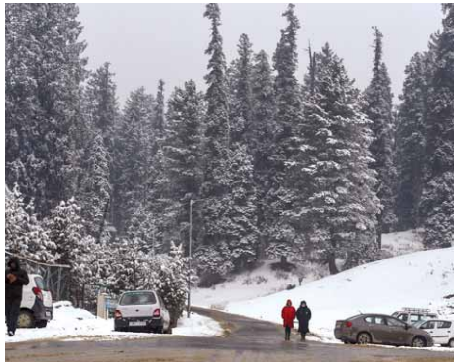
Tourists walk along a road during light snowfall at ski resort of Gulmarg in Baramulla district of north Kashmir on Thursday