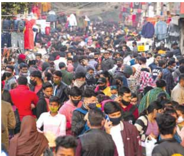
Crowded Sarojini Nagar market amid rising cases of Omicron variant of Covid-19, in New Delhi, on Thursday