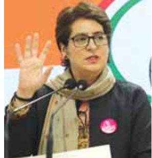
Congress general secretary Priyanka Gandhi Vadra addresses a Press conference in New Delhi on Thursday

Chief Minister Yogi Adityanath on Wednesday ordered a probe after an inves-