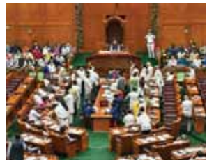
Karnataka CM Basavaraj Bommai speaks in Assembly, in Bengaluru, on Thursday

The Bill provides for protection of right to freedom of religion and prohibition of unlawful conversion from one religion to another by misrepresentation, force, undue influence, coercion, allurement or