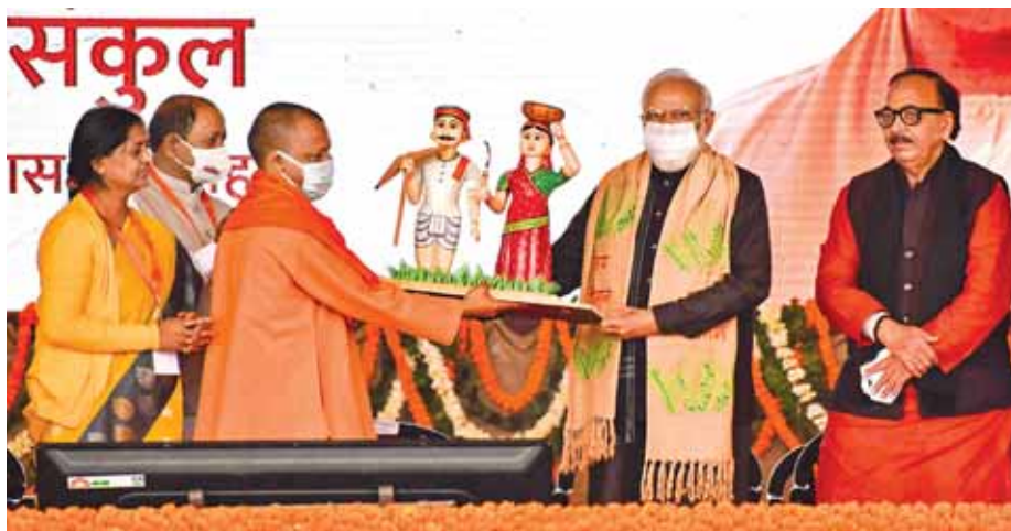
Prime Minister Narendra Modi receives a memento from UP CM Yogi Adityanath during launch of various development projects, at a public meeting at Karkhinav (Pindra), in Varanasi on Thursday

"Mafia, Parivarvad, illegal grabbing of land are some of the words found in the dictionary of the rival political parties who were responsible for all the backwardness of this region of Purvanchal," he said, adding the Government work on the