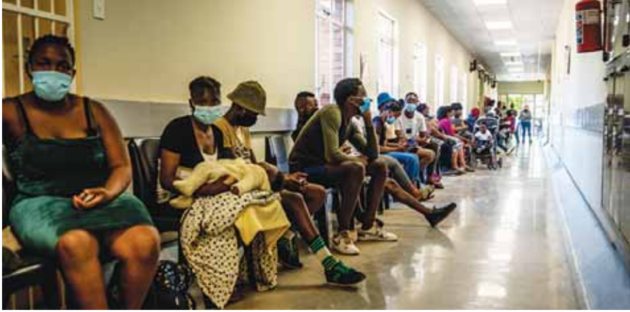
People queue to be vaccinated against Covid-19 at the Lenasia South Hospital, near Johannesburg on Wednesday. South African doctors say the rapid increase in cases attributed to the new Omicron variant is resulting in mostly mild symptoms

The report, for the first time, referred to the new omicron variant that was christened on Friday after being