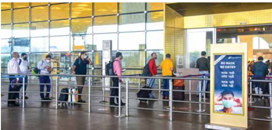
Air passengers lined up at a terminal at the Chhatrapati Shivaji Maharaj International Airport in Mumbai on Wednesday.

"In view of the evolving global scenario with the emergence of new variants of concern, the situation is being