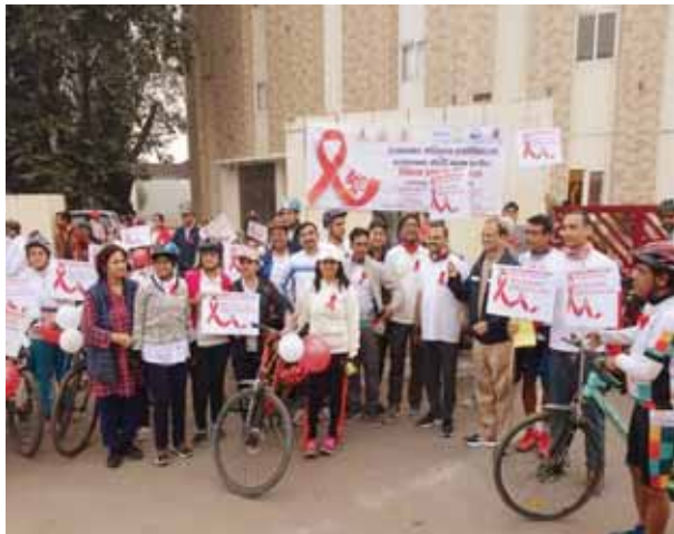
Doctors fraternity taking out cycle rally to mark World AIDS Day in Prayagraj.

In order to spread the important information about AIDS to the people, the eminent doctors of the city toured the city by bicycle and gave a message to the people that AIDS is a dangerous disease. They stopped from place to place, told people about AIDS and advised everyone to be healthy and safe. The cycle rally continued to tour on various routes of the city for about one and a half