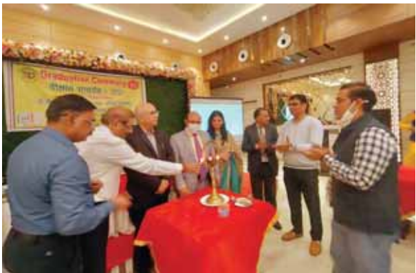
A workshop on family planning being held in Varanasi on Tuesday night.

In connection with this improvement a workshop was held here on Tuesday in association with 'The Challenge Initiative Health Cities India (TCICH) - Population Service India (PSI)' under the aegis of the Health department. The workshop focused on the achievement of the family planning programme for five years