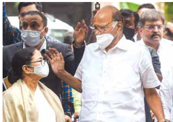
NCP president Sharad Pawar with West Bengal Chief Minister Mamata Banerjee after a meeting at his residence in Mumbai on Wednesday.

Mamata, who has of late been desperately trying to occupy the Congress' space by way of aggressive posturing like