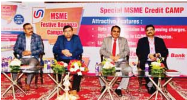
UBI holding a MSME Credit Camp in Varanasi on Wednesday.

During the lockdown because of the COVID-19 pandemic, the MSME sector suffered a lot and hence, to facilitate the entrepreneurs of this sector, the bank has launched MSME Festive Bonanza and to