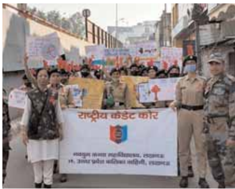
NCC wing of Navyug Girls' College organised an awareness rally on the occasion of World AIDS Day