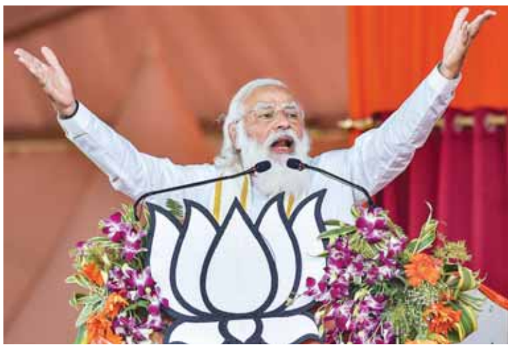
Prime Minister Narendra Modi addresses a public meeting in Hooghly district on Monday

BJP will bring real 'poriborton' by ending extortion, cut-money raj, pledges PM