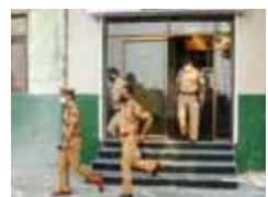
Police officials leave the hotel where P Mohanbhai Delkar was found dead in Mumbai on Monday

The body has been sent for post-mortem," Deputy Commissioner of Police and