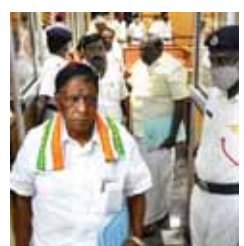
Puducherry Chief Minister V Narayanasamy leaves after attending the Special Assembly Session to give his resignation letter to Lt Governor Dr Tamilisai Soundararajan on Monday