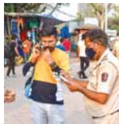
A policeman penalises a commuter for not wearing a mask amid rise in coronavirus cases across Maharashtra, in Mumbai on Monday

"Over 74 per cent of active cases are in Kerala and Maharashtra... there has also