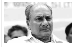
PNS ■ NEW DELHI