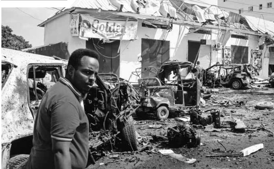
Wreckage at the scene of a bombing in Mogadishu, Somalia