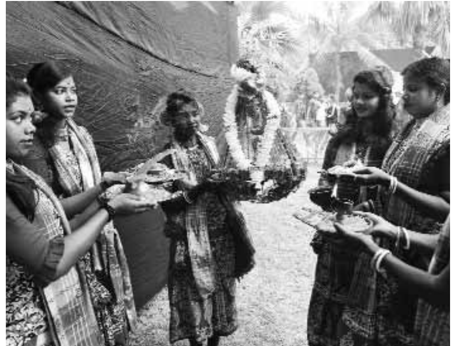
Artists perform Jhumur dance during a workshop of Folk Safar festival at Mohor Kun in Kolkata on Sunday. PTL

In a peculiar development, a panchayat election contestant at Gummalaxmipuram in Vizianagaram district literally wore his election symbol -- a gown -- to impress upon the voters to cast their vote in his favour. IANS