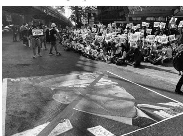
A large image that has an X mark on the face of Commander in chief Senior Gen Min Aung Hlaing, also chairman of the State Administrative Council, lies on a road as anti-coup protesters gather outside the Hledan Centre in Yangon, Myanmar on Sunday.

Vast numbers of people all over Myanmar flouted orders against demonstrations and marched again on Sunday to protest the military takeover that ousted the elected government of Aung San Suu Kyi. Large demonstrations were held in the major cities of Yangon, Mandalay and the capital, Naypyitaw, as well as in far-flung areas dominated by ethnic minorities. Resistance also took place in cyberspace, as a group calling itself BrotherHood of Myanmar Hackers defaced the government's Myanmar Digital News website, replacing content on its home page with words and pictures against the military takeover.