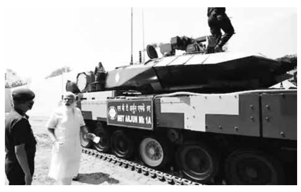
PNS ■ NEW DELHI

The Army on Sunday added muscle to its firepower capabilities when Prime Minister Narendra Modi handed over to the force the indigenously designed and manufactured Arjun Main Battle Tank (MBT) MK-1A in Chennai. Presiding over the ceremony, Modi said the tank represented the united Indian spirit as the weapon system manufactured in the south will guard the frontiers in the north. The Arjun tank manufacturing factory at Avadi in Chennai will shortly get an order for 118 such front-line fighting machines and the total contract is worth over ₹9,000 crores. It is an improved and upgraded version of the original Arjun-MK 1 MBT which was also indigenously designed and manufactured within the country. The new tanks has incorporated more than 50 upgrades and 71 new features. The Army will get an edge over its enemies as the new tank has accurate firing capabilities during day and night thereby providing the army to launch counter-offensive with lethal effect, officials said here. At the handing over function, the Prime Minister also accepted a salute by the state-of-the-art tank, indigenously designed, developed, and manufactured by the Defence Research and Development Organisation (DRDO)'s Combat Vehicles Research and Development Establishment (CVRDE) in Chennai. Modi later handed over a replica model of the tank to Army Chief General M M Naravane. "Today I am proud to dedicate to the country one more warrior to protect our frontiers. I am proud to hand over the