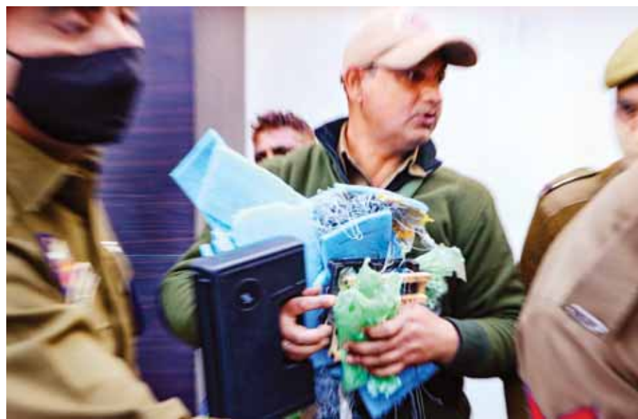
Jammu & Kashmir Police personnel display arms and ammunition recovered from a bus stand in Jammu on Sunday

He confirmed that chief commander of Lashkar-e-