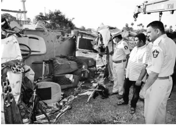
Police inspect the mangled remains of a traveller van after it collided with a truck on the Hyderabad-Bengaluru National Highway, near Veldurthi in Kurnool district of Andhra Pradesh, Sunday early morning. PTL

Preliminary investigation suggests that the driver of the bus apparently lost control and the vehicle first crashed against the road median and then rolled to the other side of the