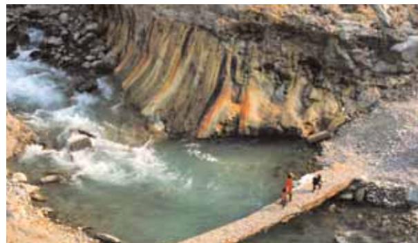
Children crossing a mountain rivulet