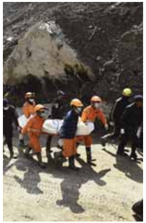
NDRF personnel carry the mortal remains of a flash flood victim near Raini village on Sunday

A surge of water in Dhauliganga and Rishiganga rivers had ripped through two hydel projects. Bodies of victims were being found at dif-