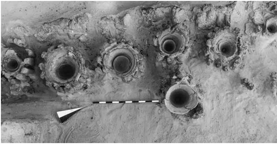
This photo provided by the Egyptian Antiquities Ministry shows pottery basins, which archaeologists say had been used to heat up a mixture of grains and water to produce beer, in Abydos, some 450 km (280 miles) south of Cairo, Egypt.

American and Egyptian Archaeologists have unearthed what could be the oldest known beer factory at one of the most prominent archaeological sites of ancient Egypt, a top antiquities official said Saturday. Mostafa Waziri, secretary general of the Supreme Council of Antiquities, said the factory was found in Abydos, an ancient burial ground located in the desert west of the Nile River, over 450 kilometres (280 miles) south of Cairo. He said the factory apparently dates back to the region of King Narmer, who is widely known for his unification of ancient Egypt at the beginning of the First Dynastic Period (3150 BC-2613 BC). Archaeologists found eight huge units — each is 20 meters (about 65 feet) long and 2.5 metres (about 8 feet) wide. Each unit includes some 40 pottery basins in two rows, which had been used to heat up a mixture of grains and water