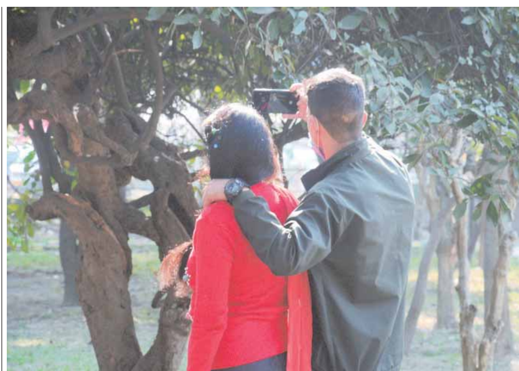
A couple takes a selfie at a park in Dehradun on Valentine's Day on Sunday