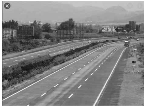
PNS ■ NEW DELHI

Of the total 29,337 km length of projects, only 8,632 kms length of projects has been awarded and 1,040 kms length of projects have been appraised so far under the Bharatmala Project phase-1 which is targeted to be completed by 2021-22. The Detailed Project Report for a length of 19,665 kms is still under preparation stage when only two years are left as per the schedule fixed for completion of Phase-I. Taking note of slow pace of work, a parliamentary committee on transport, tourism and culture asked the Government to examine the causes for delay in construction of Roads under Phase-I and take requisite remedial measures expeditiously so as to remove the stumbling blocks in order to achieve the targets fixed. "In the course of examination, it was seen that there were about 375 projects of National Highways including Bharatmala, pending due to reasons like Land Acquisition, forest clearance, utility shifting, and contractor issue and so on in various States. These included projects across the country namely in Andhra Pradesh, Assam, Bihar, Chhattisgarh, Goa, Gujarat, Haryana, Himachal Pradesh, Jammu & Kashmir, Jharkhand, Karnataka, Madhya Pradesh, Maharashtra, Meghalaya, Odisha, Punjab, Rajasthan, Tamil Nadu, Telangana, Uttar Pradesh, Uttarakhand and West Bengal. These projects have surpassed their date of completion and the