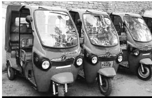
autos in Delhi," said Gahlot.

"E-autos can complement e-rickshaws in providing zero pollution last mile connectivity in Delhi. Delhi government will soon bring out a scheme to facilitate easy registration of e-