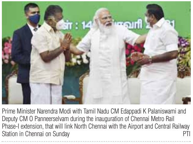
Prime Minister Narendra Modi with Tamil Nadu CM Edappadi K Palaniswami and Deputy CM O Panneerselvam during the inauguration of Chennai Metro Rail Phase-I extension, that will link North Chennai with the Airport and Central Railway Station in Chennai on Sunday

One of the important functions presided over by the Prime Minister was the handing over of Arjun Mk-1A the state-of-the-art main battle tank to Indian Army. The high performance tank was developed by the scientists of Chennai-based Combat Vehicles Research and