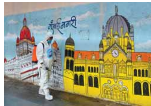
Municipal workers sanitise a platform at Chhatrapati Shivaji Maharaj Terminus in the view of the rising number of Covid-19 cases in Mumbai on Wednesday