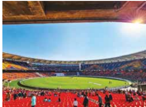
View of the world's largest cricket stadium, the Motera stadium, ahead of its inauguration on Wednesday in Ahmedabad

Union Ministers Prakash Javadekar and Ravi Shankar Prasad hit out at the Congress leaders, saying those who never respected Sardar Patel were objecting to the stadium being