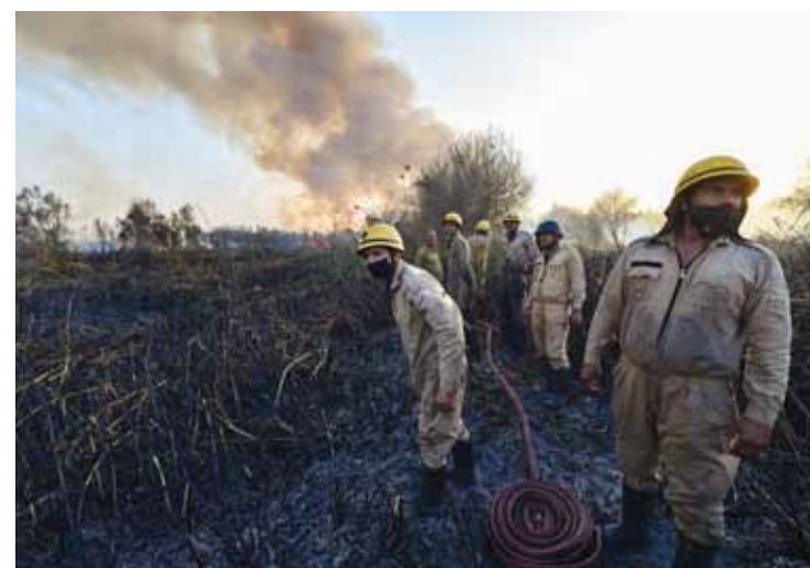
Firefighters try to douse a fire in the forest area on the Yamuna bank near Rajghat in New Delhi on Wednesday

Kanpur was at sixth and Lucknow at ninth spot, while Bhiwani and Palwal in Haryana and Alwar in Rajasthan were the least polluted cities.