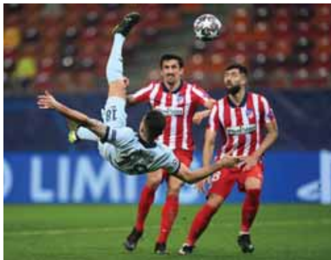
Olivier Giroud scores for Chelsea against Atletico Madrid in CL game

"I didn't know what to think about the goal, I just focused on hitting the ball," said Giroud. "I love an overhead kick and I was just pleased to see the ball hit the back of the net. I had no clue about being