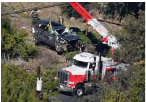
Workers move a vehicle after a rollover accident involving golfer Tiger Woods on Tuesday in Rancho Palos Verdes, a suburb of Los Angeles