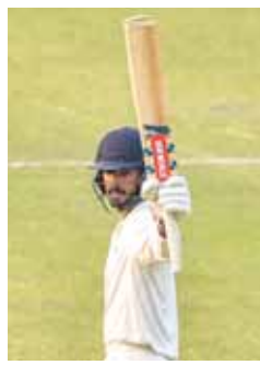
5x4s, 4x6s) before Sanju Samson took charge with an explosive 61 to power Kerala to a massive 351

Veteran opener Robin Uthappa (100 from 104 balls; 8x4s, 5x6s) cracked his second century from three matches in company of fellow opener Vishnu Vinod (107 from 107b;