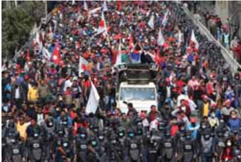
Nepalese supporters of a splinter group in the governing Nepal Communist Party participate in a rally to celebrate the Supreme Court order in Kathmandu on Wednesday