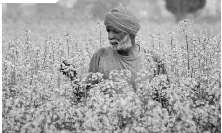
A farmer checks mustard flowers at a farm on the outskirts of Amritsar