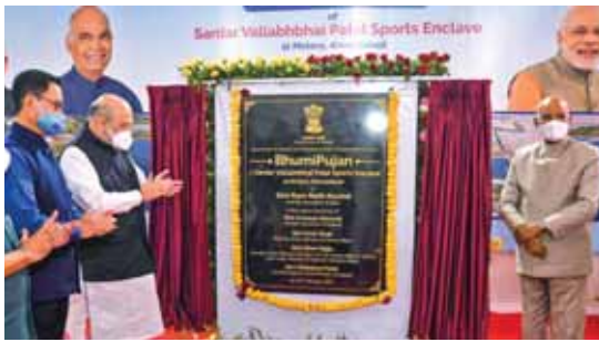
President Ram Nath Kovind and Union Home Minister Amit Shah during the Bhumi Pujan of Sardar Vallabhbhai Patel Sports Enclave at Motera Stadium in Ahmedabad

The President also performed the ground-breaking ceremony for a sports complex in the stadium, to be named Sardar Vallabhbhai Patel sports enclave, for disciplines like football, hockey,