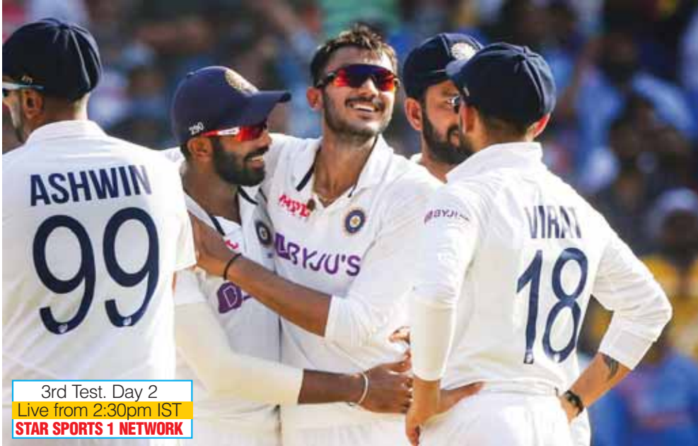
3rd Test, Day 2 Live from 2:30pm IST STAR SPORTS 1 NETWORK

This was after Ishant Sharma, only the second Indian fast bowler after Kapil Dev to play in 100 Tests, fittingly took India's first wicket in the third over to open the floodgates for