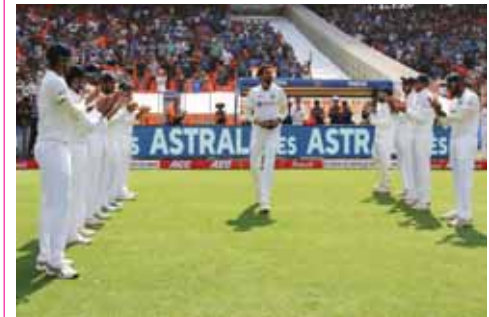
India's veteran fast bowler Ishant Sharma on Wednesday was accorded a guard of honour by his teammates ahead of his landmark 100th Test match before the start of 1st day play of 3rd Test between India and England at Narendra Modi Cricket stadium in Ahmedabad on Wednesday