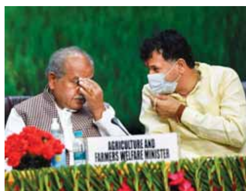
Union Minister of Agriculture and Farmers Welfare Narendra Singh Tomar and MoS Agriculture Kailash Choudhary during a function of the 2nd anniversary of Pradhan Mantri Kisan Samman Nidhi Scheme in New Delhi on Wednesday

Farmer groups have alleged that these agriculture laws will end the mandi (APMC) and MSP procurement systems and leave the farmers at the mercy of big corporates, even as the Government has rejected these apprehensions as misplaced.