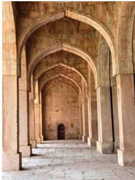
The canopy facing the Narmada from where Roopmati looked at the river; Hoshang Shah's tomb; Jami Masjid