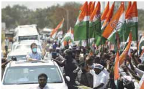
Congress leader Rahul Gandhi during his election campaign for upcoming Tamil Nadu Assembly polls in Tuticorin on Saturday

The leader said the grand old party of India would not be happy with anything less than