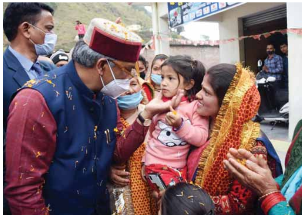
Chief Minister Trivendra Singh Rawat greets a child affectionately after reaching the Ranikhet area on Saturday

Meanwhile, the ongoing vaccination drive against Covid-19 remained suspended on the day for updating the CoWin portal. A total of 20,319 beneficiaries have so far been fully vaccinated in the State.