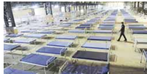
Beds lined up at Nesco Covid care centre, amid concerns over surge in Covid-19 cases, at Goregaon in Mumbai on Saturday

"They were advised not to lower their guard, enforce Covid appropriate behaviour and deal firmly with violations. It was strongly underlined that they need to follow effective