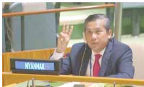
In this image taken from video by UNTV, Myanmar Ambassador to the United Nations Kyaw Moe Tun flashes the three-fingered salute, a gesture of defiance done by anti-coup protesters in Myanmar, at the end of his speech before the UN General Assembly at the United Nations on Friday

He urged all countries to issue public statements strongly condemning the military coup, and to refuse to recognize the military regime and ask its leaders to respect the free and fair elections in November