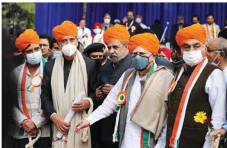
Congress leaders Ghulam Nabi Azad, Anand Sharma, Kapil Sibal, Bhupinder Singh Hooda and Raj Babbar during a Shanti Sammelan event in Jammu on Saturday

In one voice all these leaders sent out a clear message to the Congress leadership to start working towards strengthening the party before it's too late. The tone and tenor of the speeches made by these leaders clearly indicated the Congress party is headed for a major "shakeup" in the days to come. These leaders also made it clear they will not sit idle as the country was facing numerous challenges.