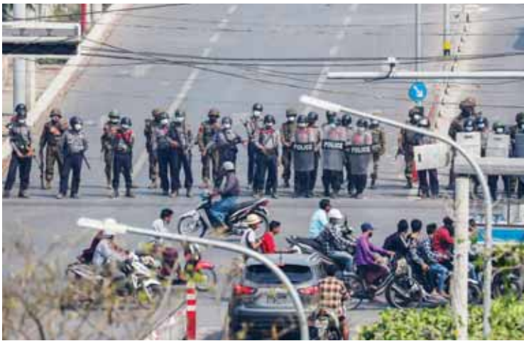
Police stand in formation blocking a main road in Mandalay, Myanmar on Saturday

There were arrests Saturday in Myanmar's two