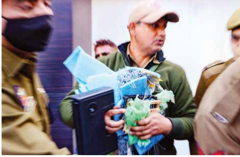
Jammu & Kashmir Police personnel display arms and ammunition recovered from a bus stand in Jammu on Sunday