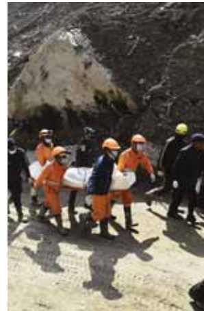
NDRF personnel carry the mortal remains of a flash flood victim near Raini village on Sunday

PNS ■ TAPOVAN/DEHRADUN A massive operation intensified to reach about 30 people trapped inside tunnel began after a flash flood in Chamoli district a week ago, rescue teams on Sunday recovered 12 more bodies, including the first ones to be pulled out from the sludge-choked Tapovan tunnel. Five bodies were recovered from the Tapovan power project tunnel, six from Raini upstream and one from the riverbank in Rudraprayag, taking the confirmed death toll in the Uttarakhand disaster to 50. Officials said 154 people still remain missing after the February 7 devastation, possibly triggered by an avalanche in the upper reaches of the Alaknanda river system. A surge of water in Dhauliganga and Rishiganga rivers had ripped through two hydro projects. Bodies of victims were being found at different locations by the river