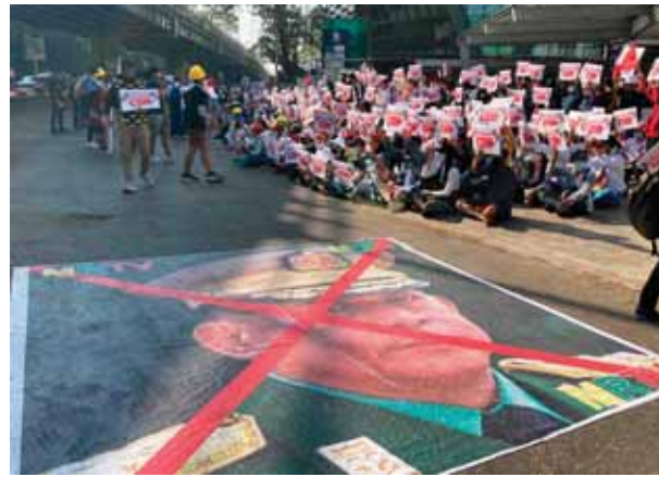
A large image that has an X mark on the face of Commander in chief Senior Gen Min Aung Hlaing, also chairman of the State Administrative Council, lies on a road as anti-coup protesters gather outside the Hledan Centre in Yangon, Myanmar on Sunday

Protesters in Yangon again rallied outside the Chinese and U.S. Embassies. They accuse