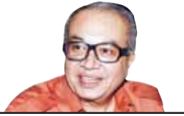
PROF. PRAFULL GORADIA

Political parties need to realise and decide whether they wish to make serious use of the Upper House or exploit it for their convenience