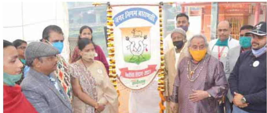
Swachhata Sangram-2021 logo being unveiled at Shastri Ghat in Varanasi on Sunday