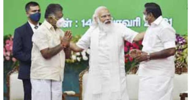
Prime Minister Narendra Modi with Tamil Nadu CM Edappadi K Palaniswami and Deputy CM O Panneerselvam during the inauguration of Chennai Metro Rail Phase-I extension, that will link North Chennai with the Airport and Central Railway Station in Chennai on Sunday

PNS ■ CHENNAI/KOCHI Prime Minister Narendra Modi's day out on Sunday to Tamil Nadu and Kerala saw the dedication and commissioning of a slew of development projects in both the poll-bound States which would result in creation of thousands of jobs and savings in foreign exchange. The Prime Minister also laid foundation stones for projects meant for farming, development of innovation for youths, strengthening of skills of technically qualified youth and development of tourism projects. One of the important functions presided over by the Prime Minister was the handing over of Arjun Mk-1A the state-of-the-art main battle tank to Indian Army. The high performance tank was developed by the scientists of Chennai-based Combat Vehicles Research and