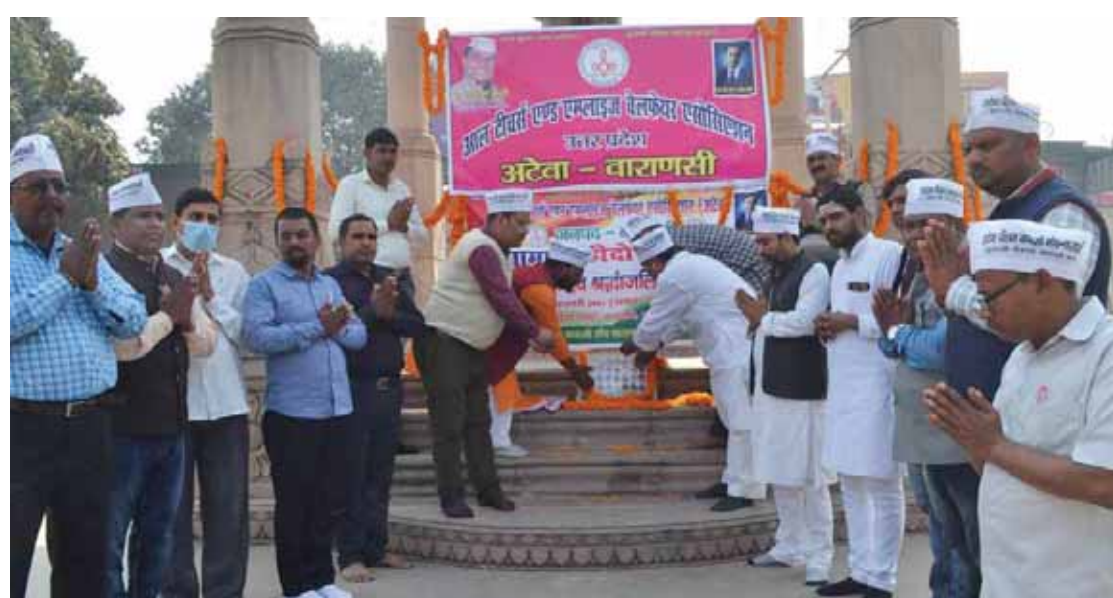
Tributes being paid to Pulwama martyrs in Varanasi on Sunday

Paying tributes, the ATEWA members recalled the martyrdom of the CRPF personnel and said that the terrorists had shown their cowardice