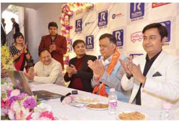
State Cabinet Minister Satish Mahana launches the Micro ATM on Sunday Pioneer

inspired by the 'Local for Vocal' call of Prime Minister Narendra Modi. Paliwal said it was the biggest B2B Fintech platform which provided employment to over 70,000 persons in 17 states of the country. "The application consists of over 35 services covering 125 plus brands of India and overseas countries. With the help of this ATM, one can get cash from his/her neighbouring shop against the