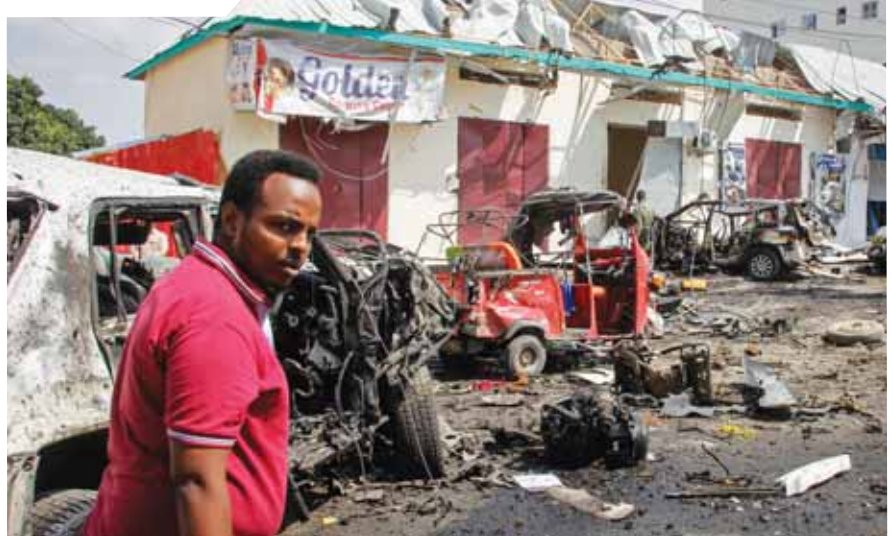
Wreckage at the scene of a bombing in Mogadishu, Somalia