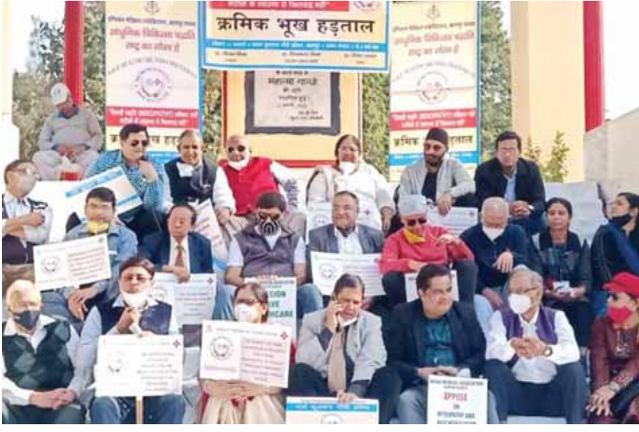
Members of Indian Medical Association-Kanpur, sitting on relay fast at Gandhi Statue, Phool Bagh on Sunday