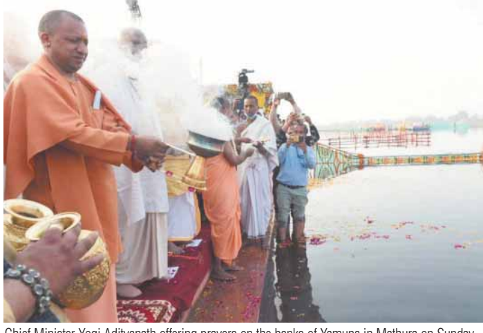
Chief Minister Yogi Adityanath offering prayers on the banks of Yamuna in Mathura on Sunday

The 'Vaishnav Baithak' is traditional meeting of saints before the Kumbh. Yogi, in a rare gesture, attended the meeting even as the Kumbh is not being organised in Uttar Pradesh. As per the old traditions, the saints and Akharas will now proceed to Haridwar Kumbh. The CM said that when the proposal for this programme had come, the entire country was faced with the Covid pandemic. "We had a chal-