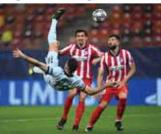
Olivier Giroud scores for Chelsea against Atletico Madrid in CL game.

"I didn't know what to think about the goal, I just focused on hitting the ball," said Giroud. "I love an overhead kick and I was just pleased to see the ball hit the back of the net. I had no clue about being