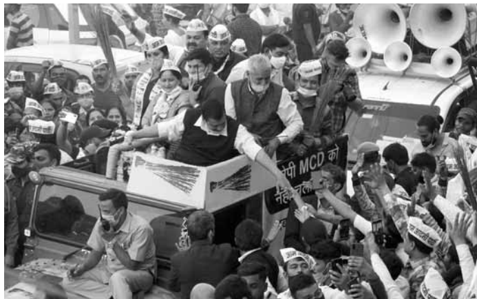
Delhi CM Arvind Kejriwal during a roadshow for MCD by-elections in Shalimar Bagh village, New Delhi, on Wednesday

"I promise that I will sanction ₹100 crores for the sewer project in this area. If you vote for any other party, they will not lift this area and let me work. They will fight with me, as you must have seen in the case of how BJP fights with me. I have fulfilled all my promises that I made in the last elections. It is your responsibility to make AAP victorious in the opponent of your Delhi," he said.