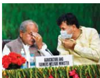
Union Minister of Agriculture and Farmers Welfare Narendra Singh Tomar and MoS Agriculture Kailash Choudhary during a function of the 2nd anniversary of Pradhan Mantri Kisan Samman Nidhi Scheme in New Delhi on Wednesday.

Farm groups have alleged that these agriculture laws will end the mandi (APMC) and MSP procurement systems and leave the farmers at the mercy of big corporates, even as the Government has rejected these apprehensions as misplaced.