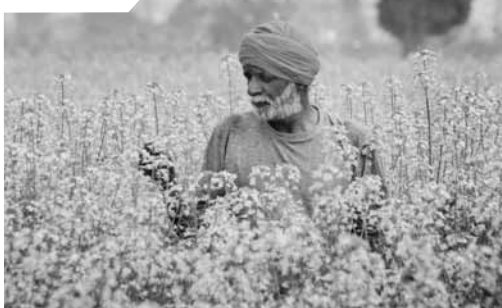
A farmer checks mustard flowers at a farm on the outskirts of Amritsar