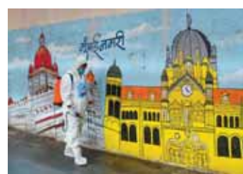
Municipal workers sanitise a platform at Chhatrapati Shivaji Maharaj Terminus in the view of the rising number of Covid-19 cases in Mumbai on Wednesday.