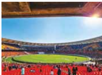
View of the world's largest cricket stadium, the Motera stadium, ahead of its inauguration on Wednesday in Ahmedabad.

Union Ministers Prakash Javadekar and Ravi Shankar Prasad hit out at the Congress leaders, saying those who never respected Sardar Patel were objecting to the stadium being