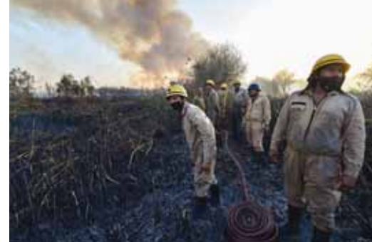
Firefighters try to douse a fire in the forest area on the Yamuna bank near Raigarh in New Delhi on Wednesday.

Kanpur was at sixth and Lucknow at ninth spot, while Bhiwani and Palwal in Haryana and Alwar in Rajasthan were the least polluted cities.