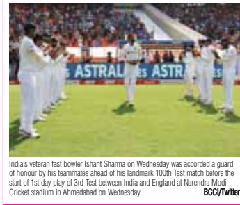
India's veteran test bowler Ishant Sharma on Wednesday was awarded a guard of honour by his teammates ahead of his landmark 100th Test match before the start of 1st day play of 3rd Test between India and England at Narendra Modi Cricket stadium in Ahmedabad on Wednesday

With such sports infrastructure, Ahmedabad will be known as India's sports city, which is the dream that Prime Minister Narendra Modi saw when he was the chief minister of Gujarat," Shah said.