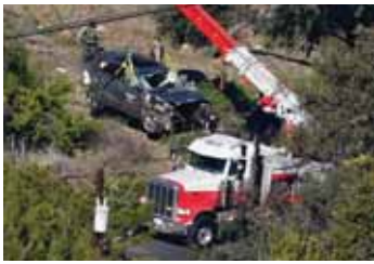
Workers move a vehicle after a rollover accident involving golfer Tiger Woods on Tuesday in Rancho Palos Verdes, a suburb of Los Angeles