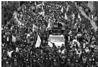
Nepalese supporters of a splinter group in the governing Nepal Communist Party participate in a rally to celebrate the Supreme Court order in Kathmandu on Wednesday.