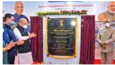
President Ram Nath Kovind and Union Home Minister Amit Shah during the Bhumi Puja of Sardar Vallabhbhai Patel Sports Enclave at Motera Stadium in Ahmedabad

Shah said that a complex spread over an area of 17 acres of area with world-class facilities