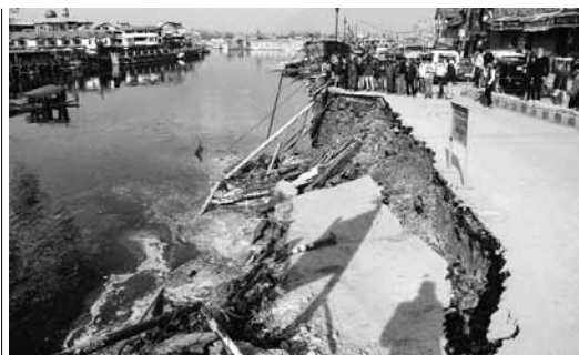
People stand near the portion of a road which caved in, at Dalgate in Srinagar on Wednesday