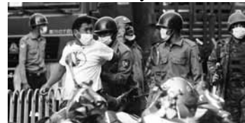
Prisoners, or AAPP, a Myanmar prisoner of political prisoners. Many of those arrested were charged using a legacy of laws — some dating back to British colonial times and others instituted under previous military regimes — that have been used against critics by every government, including the one led by Aung San Suu Kyi's National League for Democracy party, which was ousted in the Feb. 1 coup.

As of Tuesday, some 696 people — including monks, writers, activists, politicians and others — had been arrested in relation to the coup, according to the Assistance Association for Political Prisoners.