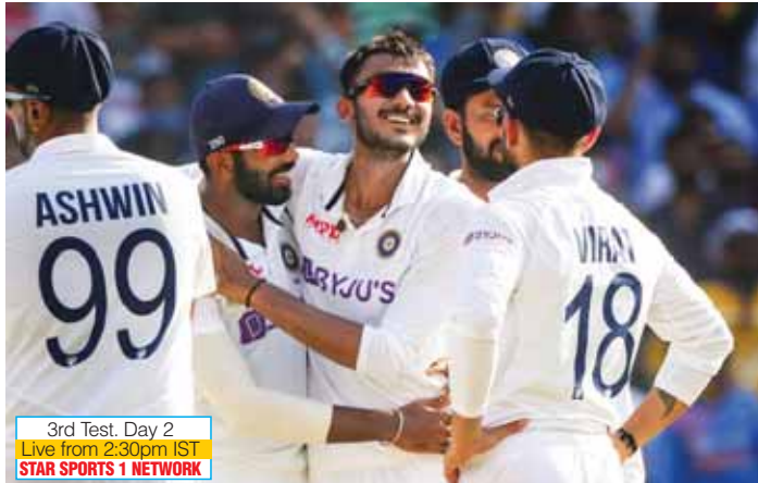
3rd Test, Day 2 Live from 2:30pm IST STAR SPORTS 1 NETWORK

This was after Ishant Sharma, only the second Indian fast bowler after Kapil Dev to play in 100 Tests, fittingly took India's first wicket in the third over to open the floodgates for the hosts.