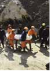
NDRF personnel carry the mortal remains of a flash flood victim near Raini village on Sunday.

A surge of water in Dhaultiganga and Rishiganga rivers had ripped through two hydel projects. Bodies of victims were being found at dif-