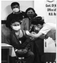
Govt. Of India Office of M.S. No.

India has begun the second round of its phase one COVID-19 vaccination drive. The first round that began on January 16 saw 58,65,813 healthcare workers and 19,00,506 front-line workers being inoculated till February 12. Once India administers both the shots, the vaccination process for the first lot of chosen people will be complete. Thankfully, from the time the venture got underway, the number of infections and casualties has seen a downward spiral. According to the Union Health Ministry, on February 11 the country reported 12,923 new infections in 24 hours, taking the number of those infected to 10,871,294. There are 142,562 active cases and 10,573,372 recoveries as India's death toll stood at 155,360 with 108 deaths during the same period. India is witnessing a consistent decline in the number of infections reported daily since the peak in mid-September 2020. This has earned the Government a pat on the back from the World Health Organisation (WHO), as has the fact that over seven million people have been inoculated since the world's largest vaccination drive began in January. "It's the fastest rate of vaccination happening," Roderico Ofrin, the WHO's India representative, has said. However, despite its relative success, the first round was not without challenges. For instance, there was the issue of procuring enough vaccines, which still remains. AstraZeneca's Covishield, which is the main vaccine being administered, is given in two doses, four weeks