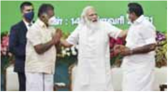
Prime Minister Narendra Modi with Tamil Nadu CM Edappadi K Palaniswami and Deputy CM O Panneerselvam during the inauguration of Chennai Metro Rail Phase-I extension, that will link North Chennai with the Airport and Central Railway Station in Chennai on Sunday.

One of the important functions presided over by the Prime Minister was the handing over of Arjun Mk-1A the state-of-the-art main battle tank to the Indian Army. The high performance tank was developed by the scientists of Chennai-based Combat Vehicles Research and