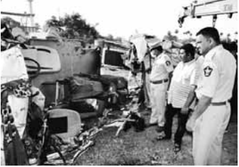
Police inspect the mangled remains of a traveller van after it collided with a truck on the Hyderabad-Chittoor highway, near Velduthi in Kurnool district of Andhra Pradesh, Sunday early morning

Kurnool (AP): Fourteen people, including eight women and a child, were killed and four others injured when a mini bus collided with a lorry in Kurnool district of Andhra Pradesh early on Sunday, police said. The incident took place at around 4 am when a group of people hailing from Chittoor district of the state were travelling in the mini bus towards Hyderabad. A senior police official told. They were all on their way to Ajmer in Rajasthan, he added. Preliminary investigation suggests that the driver of the bus apparently lost control and the vehicle first crashed against the road median and then rolled to the other side of the