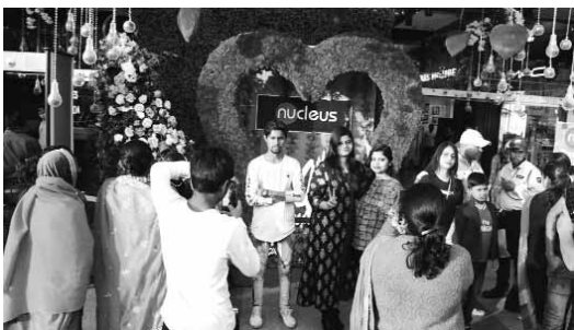
Couples celebrate Valentine's Day at a mall in Ranchi

Studies estimate that almost sixty-two crore which is forty-seven percent of the population is pushed to extreme poverty and distress. It's even scarier because of one sole reason - who is going to take responsibility of holding a hand for this unerasable number and reminding that it isn't just a number but actual oxygen-breathing human beings.