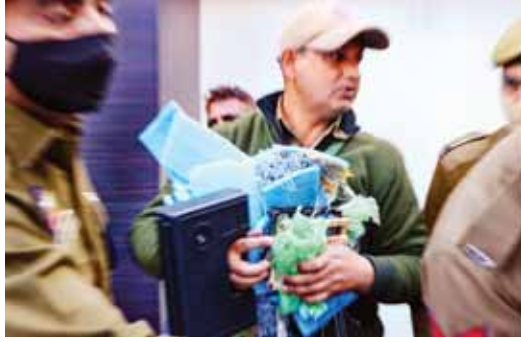
Jammu & Kashmir Police personnel display arms and ammunition recovered from a bus stand in Jammu on Sunday.

He confirmed that chief commander of Lashkar-e-