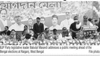
BJP Party legislative leader Babul Marandi addresses a public meeting ahead of the Bengal elections at Raiganj, West Bengal

Senior BJP leaders from the State including union tribal affairs minister Arjun Monda, former Chief Minister Babul Marandi and others have addressed election rallies in bordering districts of Bengal. As many bordering districts of Bengal including Purulia, West Midnapore, Bankura have sizeable tribal population. The BJP central committee has roped in these tribal leaders to reach out