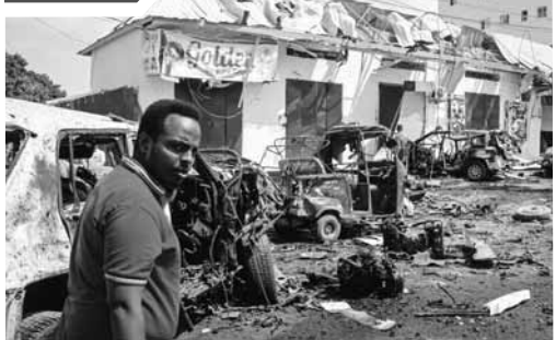
Wreckage at the scene of a bombing in Mogadishu, Somalia