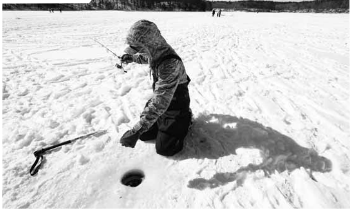
A fisherman fishes through a hole in frozen Walden Pond in Massachusetts