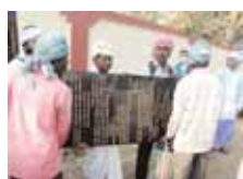
Activists carrying Pathalgadi stone slab near Jharkhand High Court in Ranchi on Monday

"The Pathalgadi supporters were stopped half way through.