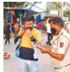
A policeman penalises a commuter for not wearing a mask amid rise in coronavirus cases across Maharashtra, in Mumbai on Monday

"Over 74 per cent of active cases are in Kerala and Maharashtra... there has also