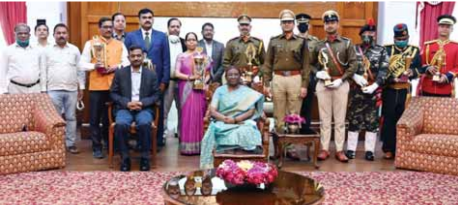
Governor Droupadi Murmu alongwith winners of the tableau competition during Republic Day celebrations at Raj Bhawan in Ranchi on Saturday

The State Finance Minister also said that an increase in the price of fuels also increases the price of other essential commodities. “In the Congress regime, arrangements were made to control inflation while increasing the income of the people but Narendra Modi’s led Central Government is constantly taking decisions against farmers, labourers and the poor public. Against this, a movement is being run by the party in the entire State,” he added.