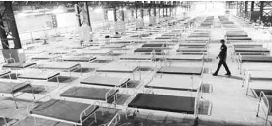
Beds lined up at Nesco Covid care centre, amid concerns over surge in Covid-19 cases, at Goregaon in Mumbai on Saturday