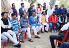
BJP State president-cum-MP Deepak Prakash, BJP Legislative Party Leader Babulal Marandi and others interact with victim family member of the murder case of wife and husband, at Konge village near Ranchi on Saturday

Speaking on the occasion, Marandi said that the morale of the naxalites and criminals in the State has increased so much that the husband and wife were brutally murdered just 3-4 kilometers away from the Chief Minister’s residence. “In the Government, which has become the so called well-wisher of the tribals, the maximum massacre, killing of tribals is tak-