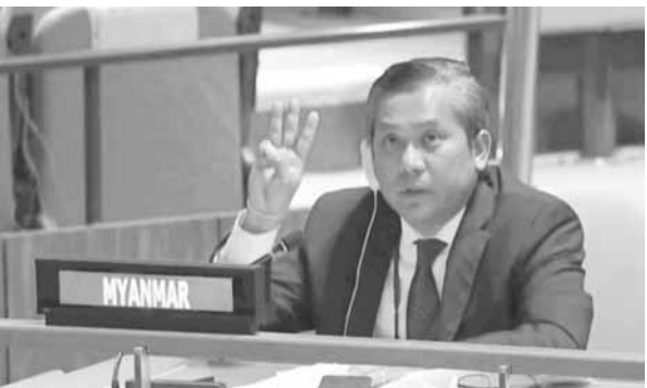
In this image taken from video by UNTV, Myanmar Ambassador to the United Nations Kyaw Moe Tun flashes the three-fingered salute, a gesture of defiance done by anti-coup protesters in Myanmar, at the end of his speech before the UN General Assembly at the United Nations on Friday

He urged all countries to issue public statements strongly condemning the military coup, and to refuse to recognize the military regime and ask its leaders to respect the free and fair elections in November