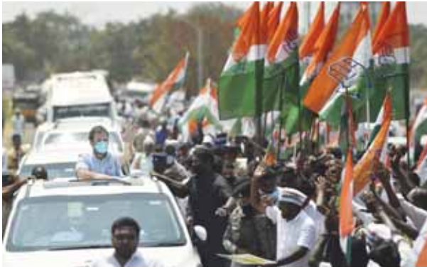
Congress leader Rahul Gandhi during his election campaign for upcoming Tamil Nadu Assembly polls in Tuticorin on Saturday

The leader said the grand old party of India would not be happy with anything less than