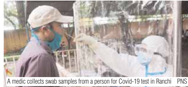
A medic collects swab samples from a person for Covid-19 test in Ranchi

A bulletin released by the NHM on Saturday morning stated that Ranchi accounted for as many as 277 of the 492 active