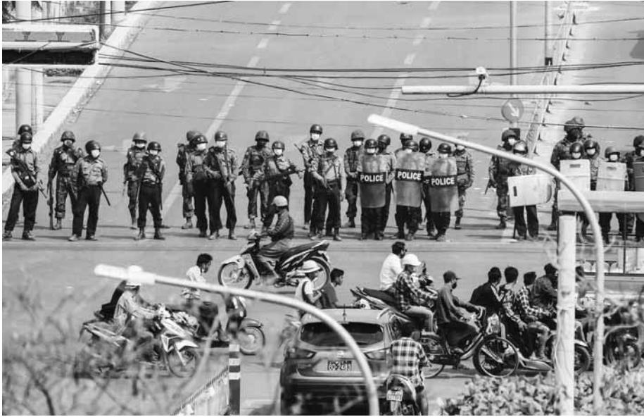
Police stand in formation blocking a main road in Mandalay, Myanmar on Saturday

There were arrests Saturday in Myanmar's two