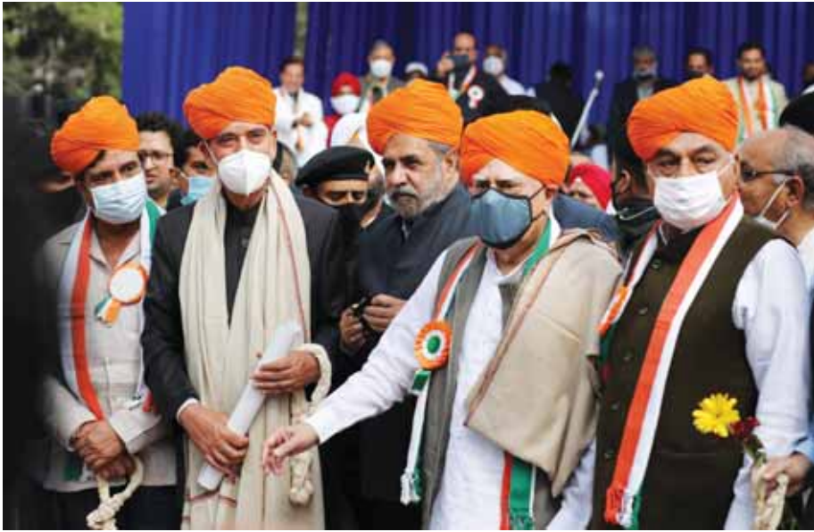
Congress leaders Ghulam Nabi Azad, Anand Sharma, Kapil Sibal, Bhupinder Singh Hooda and Raj Babbar during a Shanti Sammelan event in Jammu on Saturday

In one voice all these leaders sent out a clear message to the Congress leadership to start working towards strengthening the party before it's too late. The tone and tenor of the speeches made by these leaders clearly indicated the Congress party is headed for a major “shakeup” in the days to come. These leaders also made it clear they will not sit idle as the country was facing numerous challenges.