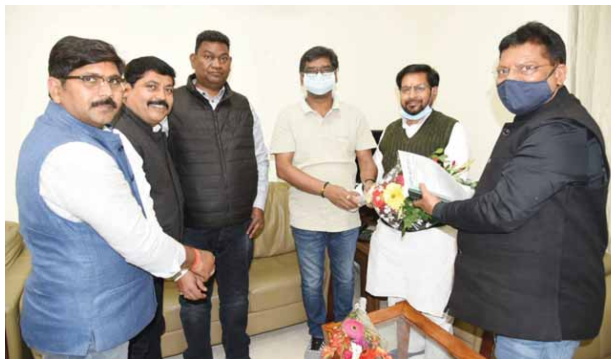
Former Union Minister and RJD senior leader Jai Prakash Narayan Yadav along with party leaders meet Chief Minister Hemant Soren at his official residence in Ranchi on Saturday

The list includes 25 districts of Arunachal Pradesh; 38 districts of Bihar; 28 districts of Chhattisgarh; 2 districts in Goa; 22 districts of Haryana; 12 districts of Himachal Pradesh; 24 districts of Jharkhand; 20 districts of Jammu & Kashmir; 31 districts of Karnataka; 14 districts of Kerala; 52 districts of Madhya Pradesh; 36 districts of Maharashtra; 16 districts of Manipur; 30 districts of Odisha; 23 districts of Punjab; 4 districts of Sikkim; 36 districts of Tamil Nadu; 8 districts of Tripura; 75 districts of Uttar Pradesh; and 18 districts of West Bengal.