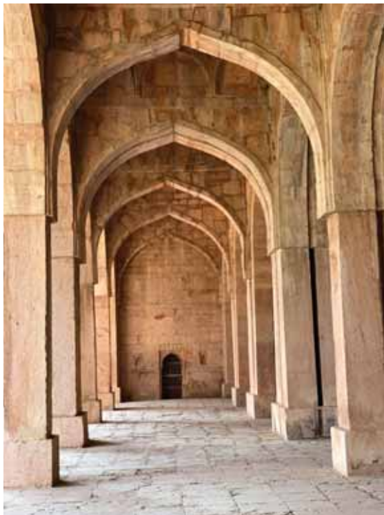
The canopy facing the Narmada from where Roopmati looked at the river; Hoshang Shah's tomb; Jami Masjid