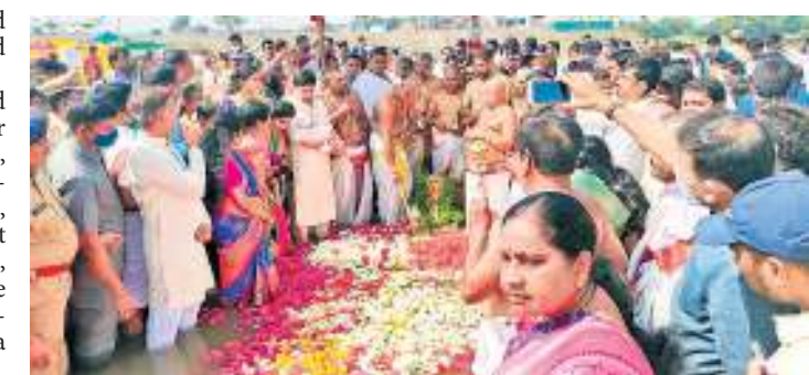
TTD priests perform Chakrasnanam to Lord Venkateshwara and His consorts Sridevi and Bhudevi at Triveni Sangamam in Jayashankar Bhupalapally district on Saturday