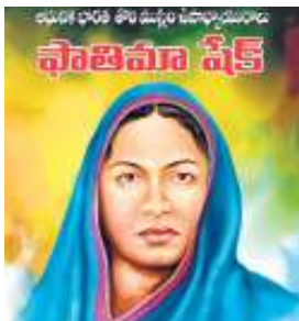
training as a teacher with Savitri Bai Phule, worked as a