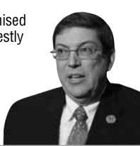
Cuban Foreign Minister Bruno Rodriguez

The US political opportunism is recognised by those who are honestly concerned about the scourge of terrorism and its victims.