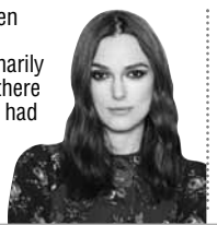
Actor Keira Knightley

Objectification of women still exists, and often women are valued primarily for their looks. I think there is a conversation to be had over that.