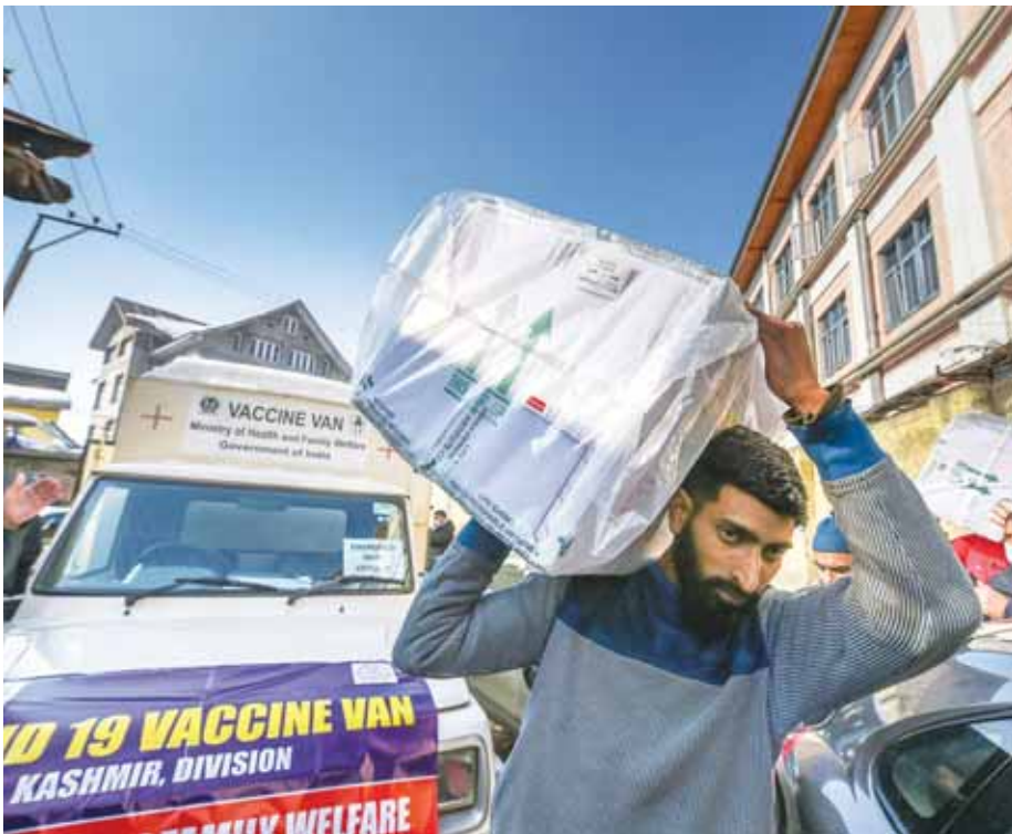
Medical department workers unload boxes of Covid-19 vaccines from a vehicle at cold storage of a hospital in Srinagar on Wednesday

Covid-19 vaccines reaching all centres across India, earlier 4,895 vaccination spots were chosen in country