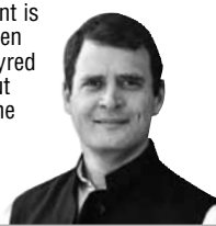
Congress leader Rahul Gandhi

The Modi Government is not embarrassed when 60 farmers are martyred but is ashamed about the tractor rally by the farmers.