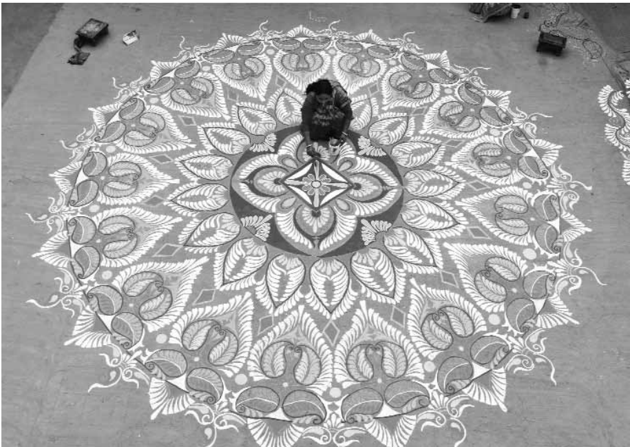
A woman paints a Rangoli design in front of her house on the eve of Makar Sankranti, at Lankamura village on the outskirts of Agartala on Wednesday