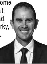
Australian coach Justin Langer

I literally cannot believe some of the rubbish I read about Steve Smith. Absolute load of rubbish. He is a bit quirky, he does some weird stuff.