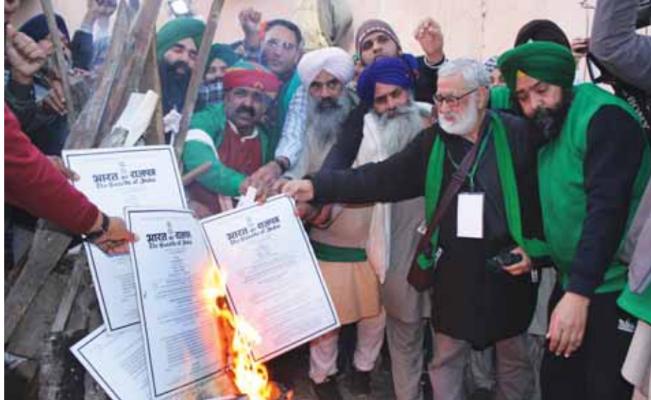
Farmers burn copies of the new farm laws as they celebrate Lohri festival during their ongoing protest against the Central Government, at Singhu Border in New Delhi on Wednesday