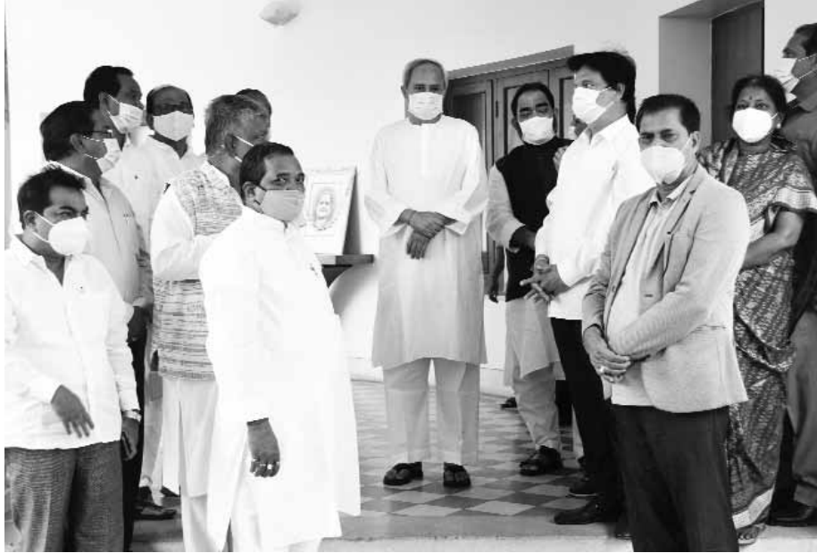
Ministers and other BJD leaders and people of Bhubaneswar greet Naveen Patnaik at his residence Naveen Niwas in Bhubaneswar on Saturday for being chosen in a survey as the number one Chief Minister of the country