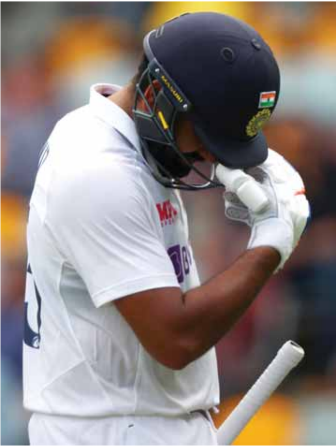
Rohit Sharma reacts on his way to pavilion after getting out on Day 2 of 4th Test

Pujara, at the other end was playing his usual ‘grinding out’ game but it didn’t look too arduous