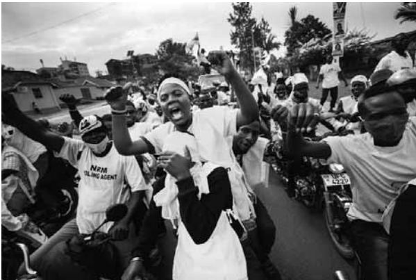
Supporters of Ugandan President Yoweri Kaguta Museveni celebrate in Kampala, Uganda on Saturday

diplomat to Africa has called the electoral process “fundamentally flawed.”