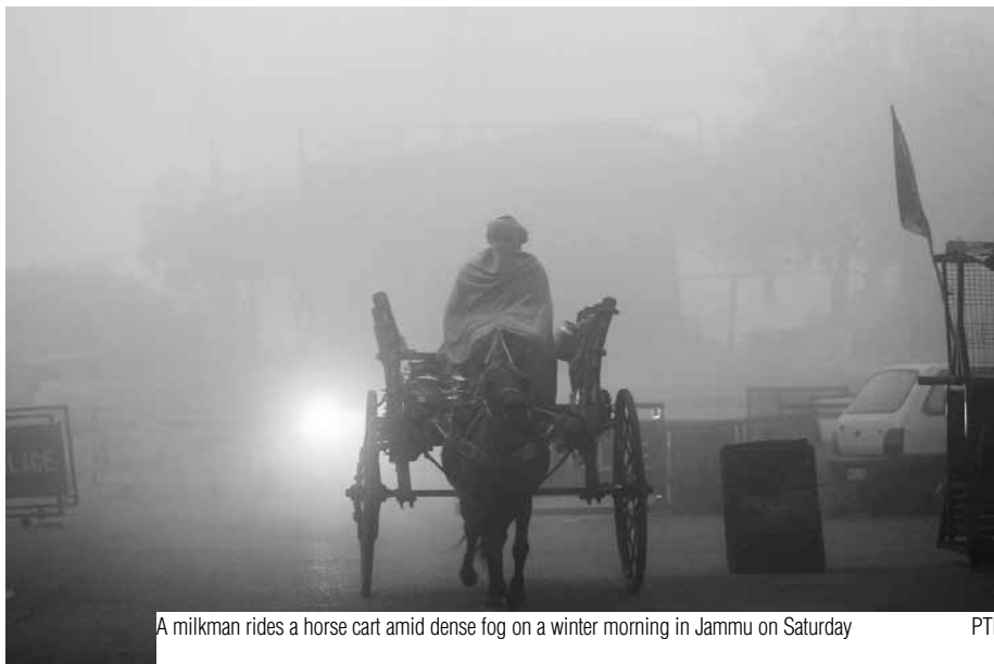
A milkman rides a horse cart amid dense fog on a winter morning in Jammu on Saturday

NEW DELHI: Air quality in Delhi spiked to dangerous levels due to low ventilation and calm surface winds as Air Quality and Weather Forecasting And Research (SAFAR) predicted on Saturday. According to the National Ambient Air Quality Index (NAAQI), the overall Air Quality Index (AQI) was recorded at 492 micrograms per cubic. According to SAFAR, the values of Suspended Particulate Matters (SPMs) were recorded 436 and 278 microgram per cubic for Particulate Matters (PM) 10 and 2.5. SAFAR.