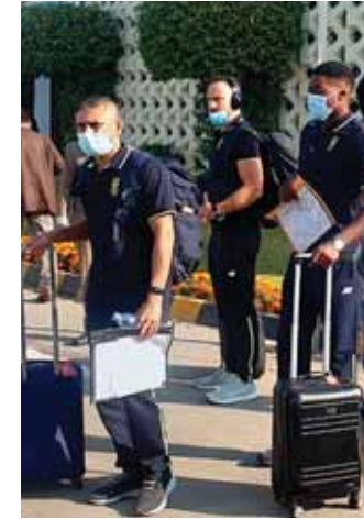
Officials and players of South Africa's cricket team come out from airport terminal upon arrival their arrival in Karachi

Pakistan won Tests against Sri Lanka and Bangladesh in late 2019