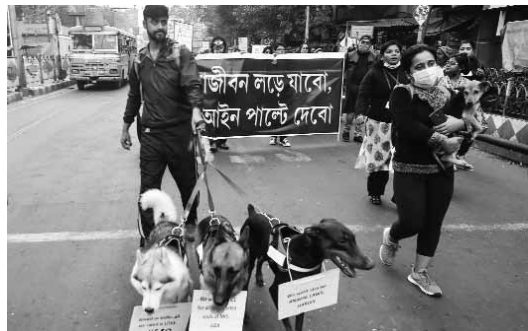
Animal lovers with their pets participate in a rally for a better world for animals in Kolkata on Sunday

This was followed by theme based WAP-7 locomotives - a unique initiative to promote new, improved and latest Push-Pull technology by sketching various World Heritage sites like the Chhatrapati Shivaji Maharaj Terminus, The Taj Mahal, The Red Fort etc, on the electric locomotives. All these creations were painted by artists and employees of Central Railway.