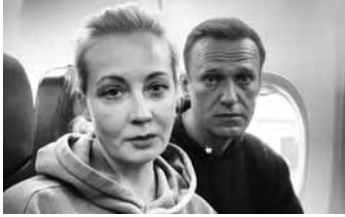
Alexei Navalny and his wife Yulia onboard a flight to Moscow, at the airport Berlin Brandenburg (BER) in Schoenefeld, near Berlin, Germany on Sunday

Navalny, who has blamed his poisoning on the Kremlin, charged that Russian President Vladimir Putin was now trying to deter him from coming home with new legal motions. The Kremlin has repeatedly denied a role in the opposition leader's poisoning.