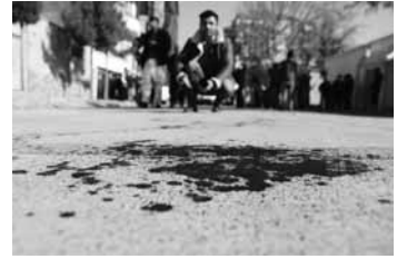
An Afghan journalist films the site where gunmen fired in Kabul, Afghanistan on Sunday

The Afghan government has repeatedly blamed the Taliban for targeted killings in recent months and the insurgent group accuses the government of staging the killings to spoil the peace process. The Islamic State group has