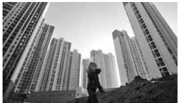
phase leads to the increased cost of construction, working capital loss, increased financing costs impacting the entire supply chain," CII said.

In case of commercial leasing of properties and on let premises at malls, the renting of such premises attracts 18 per cent which is available as credit to the client. Disallowance of credit during the construction