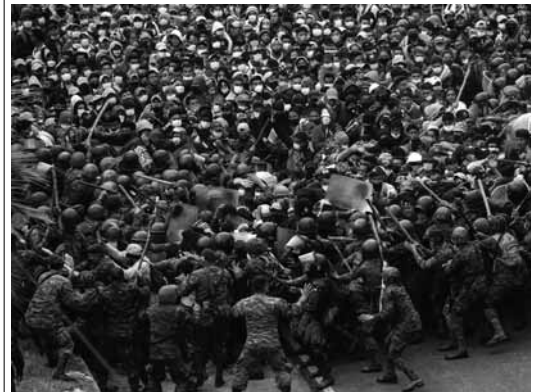
Honduran migrants clash with Guatemalan soldiers in Vado Hondo, Guatemala on Sunday

It said Tehran maintains its plans to conduct research and development on uranium metal production are part of its "declared aim to design an improved type of fuel."