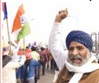
Farmers raise slogans during their protest against the new farm laws at Ghazipur border in New Delhi on Sunday