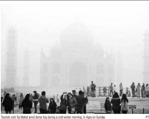
Tourists visit Taj Mahal amid dense fog during a cold winter morning, in Agra on Sunday

"He has been sent to jail," the SHO added. IANS