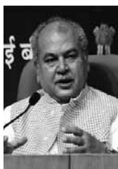
SC-APPOINTED COMMITTEE TO HOLD MEET ON JAN 19

"Most of the farmers and experts are in favour of farm