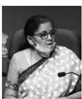
investment and ensure fiscal and monetary stability.

"If India can focus on a much more predictable environment from a policy framework, it will attract more investment from the investors. Bringing a sense of transparency in policy making also sends a very