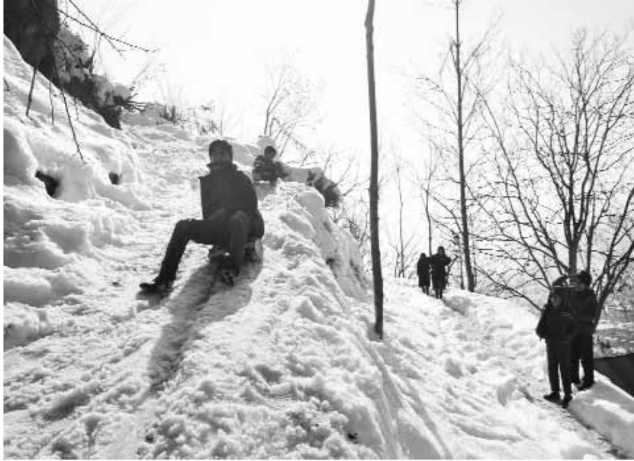
Youngsters play with sleds on a snow laden hilltop after heavy snowfall on the outskirts of Srinagar on Tuesday

The police then presented her before the Child Welfare Committee (CWC) and further action will be taken in the matter on the direction of CWC. PTI