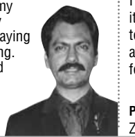
Actor Nawazuddin Siddiqui

The characters that are my favourite are not liked by people much. I am not saying that the audience is wrong. It’s just that my likes and dislikes are different.