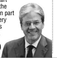
EU commissioner (economy) Paolo Gentiloni

The EU has planned to start raising and allocating in the next few months the main part of the $906 billion recovery fund to bail out the bloc’s economies hit by COVID.