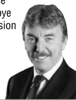
Polish FA president Zbigniew Boniek

I am terribly sorry because it is not nice to say goodbye to the coach. It’s my decision and I take responsibility for this decision.