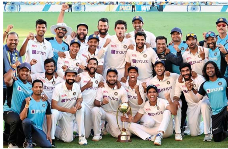
Team India players pose with the winning trophy after defeating Australia by three wickets on the final day of the fourth cricket test match at the Gabba, Brisbane, Australia, on Tuesday

Team India retains Border-Gavaskar trophy, win series 2-1