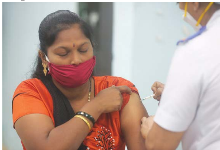
A health worker receives a Covid-19 vaccine at a Government Hospital in Mumbai on Tuesday

The SII said that one should not get the Covishield vaccine if the person had a severe allergic reaction after a previous dose of this vaccine which has "L-Histidine, L-Histidine hydrochloride monohydrate, Magnesium chloride hexahydrate, Polysorbate 80, Ethanol, Sucrose, Sodium chloride, Disodium edetate dihydrate (EDTA), water for injection," as its ingredients.