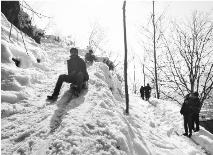
Youngsters play with sledges on a snow laden hilltop after heavy snowfall on the outskirts of Srinagar on Tuesday

However the wound worsened and there was puss formation, following which forest department officials and a veterinarian kept the pachyderm under observation and decided to shift it to Theppakkadu camp. PTI