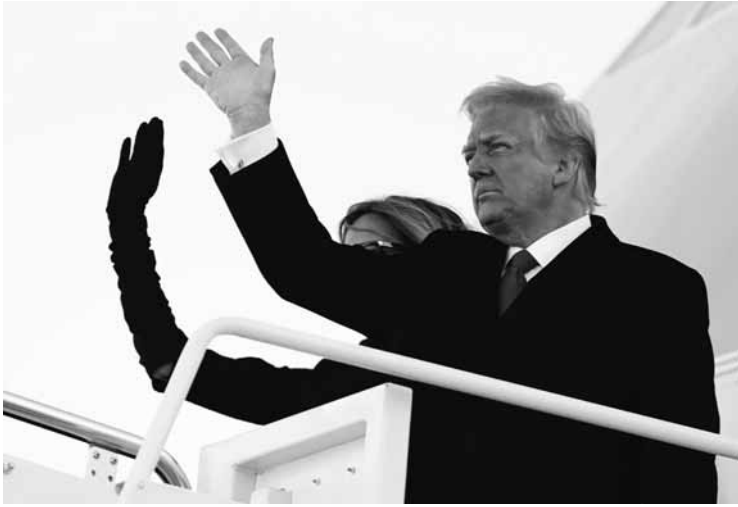
President Donald Trump and first lady Melania Trump board Air Force One at Andrews Air Force Base, Md., on Wednesday

Bannon was indicted in August when New York federal prosecutors charged him and three others with defrauding donors of more than a million dollars as part of an online