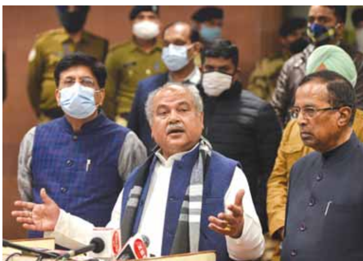
Union Minister for Agriculture and Farmers Welfare Narendra Singh Tomar, along with Minister for Commerce and Industry Piyush Goyal and Minister of State Som Prakash, addresses the media after the 10th round of meeting with farmer leaders on new farm laws at Vigyan Bhawan in New Delhi on Wednesday

After the meeting which lasted for five hours, including two breaks, Union Agriculture Minister Narendra Singh Tomar said the Government has proposed to suspend the implementation of the three laws for 1.5 years, during which period a joint committee of representatives from the Government and farmers' sides