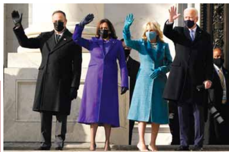
President Joe Biden, his wife Jill Biden and Vice President Kamala Harris and her husband Doug Emhoff arrive at the steps of the US Capitol for the start of the official inauguration ceremonies in Washington on Wednesday

Washington: Donald Trump on Wednesday skipped his successor Joe Biden's inauguration and exited the White House for the last time as the US President to board a flight to his Mar-a-Lago estate in Florida, which will be his permanent home after he failed to win his re-election bid.