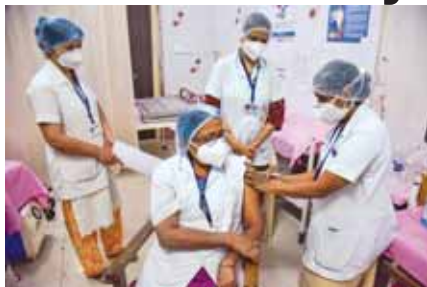
A medic vaccinates a health worker with Covishield vaccine during a countryside inoculation drive against Covid-19 at Thane Civil Hospital on Wednesday

"Some coronaviruses are known to reinfect humans, but it is not clear to what extent, this is due to our immune memory fading or antigenic drift," said first author of the