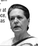
Congress interim president Sonia Gandhi

Like millions of Indians, I am jubilant and proud at your heroic and historic victory at Brisbane. Your performance, against incredible odds, has brought glory to India.