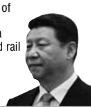
Chinese President Xi Jinping

The high-speed rail is a successful demonstration of China's independent innovation. China is now a world leader in high-speed rail technology.