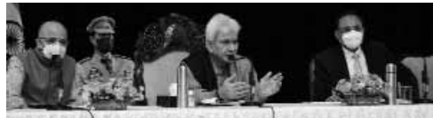
Lt Governor Manoj Sinha holds Press conference on Ratle Hydroelectric Project on Wednesday

Mentioning the lacklustre approach of the successive Governments towards the execution of this important