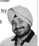
Singer Daler Mehndi

Nachave is a vivacious number that will definitely make you tap your feet. I always try to deliver a different and unique experience to music lovers.