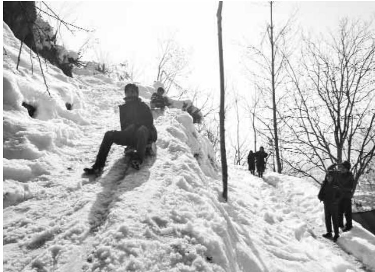
Youngsters play with sledges on a snow laden hilltop after heavy snowfall on the outskirts of Srinagar on Tuesday

However the wound worsened and there was puss formation, following which forest department officials and a veterinarian kept the pachyderm under observation and decided to shift it to Theppakkadu camp.