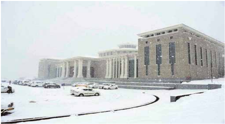
PNS ■ DEHRADUN

The chief minister said that efforts are being made to develop Gairsain in a way which makes the summer capital of the state beautiful and attractive. He said, "When the