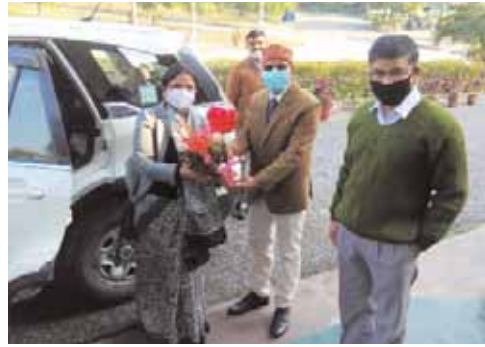
PNS ■ DEHRADUN