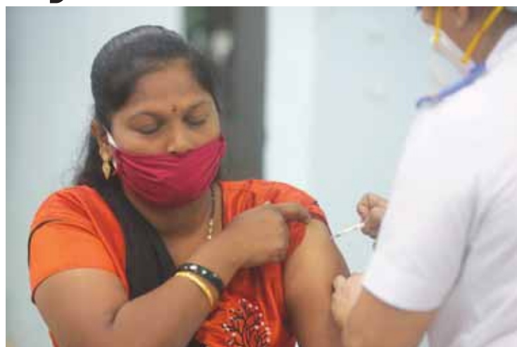
A health worker receives a Covid-19 vaccine at a Government Hospital in Mumbai on Tuesday

The SII said that one should not get the Covishield vaccine if the person had a severe allergic reaction after a previous dose of this vaccine which has "L-Histidine, L-Histidine hydrochloride monohydrate, Magnesium chloride hexahydrate, Polysorbate 80, Ethanol, Sucrose, Sodium chloride, Disodium edetate dihydrate (EDTA), water for injection," as its ingredients.