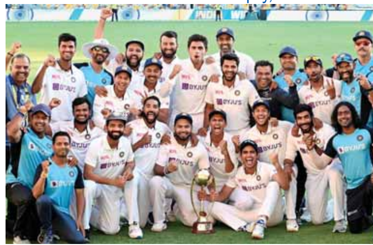
Team India players pose with the winning trophy after defeating Australia by three wickets on the final day of the fourth cricket test match at the Gabba, Brisbane, Australia, on Tuesday

Team India retain Border-Gavaskar trophy, win series 2-1