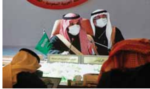
Journalists watch a large display screen as Saudi Crown Prince Mohammed bin Salman, center left, chairs the 41st Gulf Cooperation Council (GCC) meeting in Al Ula, Saudi Arabia on Tuesday

The emir is in Al-Ula for an annual summit of Gulf Arab leaders that is expected to pro-