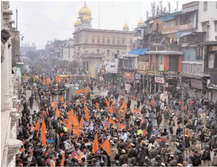
Vishwa Hindu Parishad activists stage a protest over the demolition of a 100-year-old temple of Lord Hanuman, in Chandni Chowk, Delhi on Tuesday