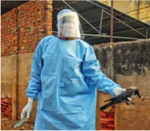
Forest department official picks up a sick crow from a roadside near Jal Mahal in Jaipur on Tuesday

The operation to cull birds in and around a one-km radius of the affected areas in Alappuzha and Kottayam in Kerala was launched a day after results of samples tested at the National Institute of High Security Animal Diseases in