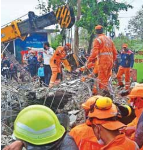
Twenty-four people, most of them attending a funeral, were killed and 17 others injured when the roof of a shelter at the cremation ground in Muradnagar collapsed on Sunday

The contractor wanted in connection with incident was arrested from a village near the border of Meerut and Muzaffarnagar districts of Uttar Pradesh, police said on Tuesday.