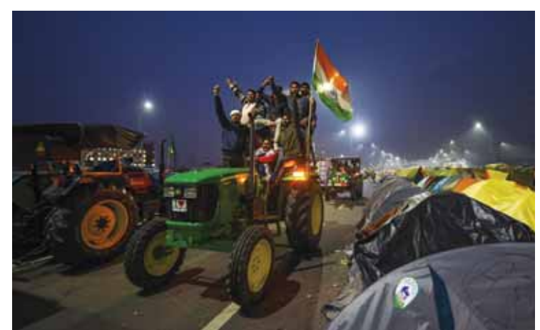
Farmers on a tractor raise slogans during their protest against Centre's farm reform laws, at the Delhi-UP border near Ghaziipur in New Delhi on Tuesday