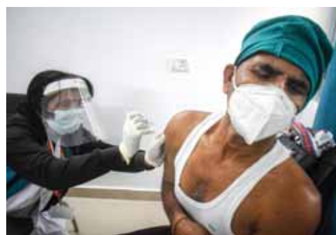
A health-worker takes part in a dry run as part of preparedness for the administration of Covid-19 vaccine, at Moli Lal Nehru Hospital in Prayagraj on Tuesday