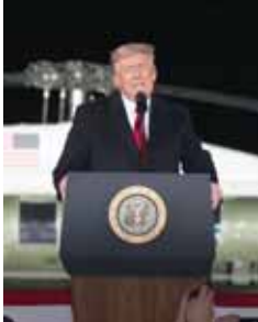
Trump's announced purpose for the trip was to boost Republican Senate candidates in Tuesday's runoff election, but he spent much of his speech complaining bitterly about his election loss — which he insists he won "by a lot."

Though he got nothing but cheers Monday night, Trump's attempt to overturn the presi-