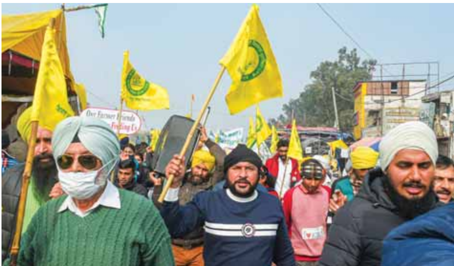
Farmers during the ongoing agitation against new farm laws at Singhu Border in New Delhi on Tuesday