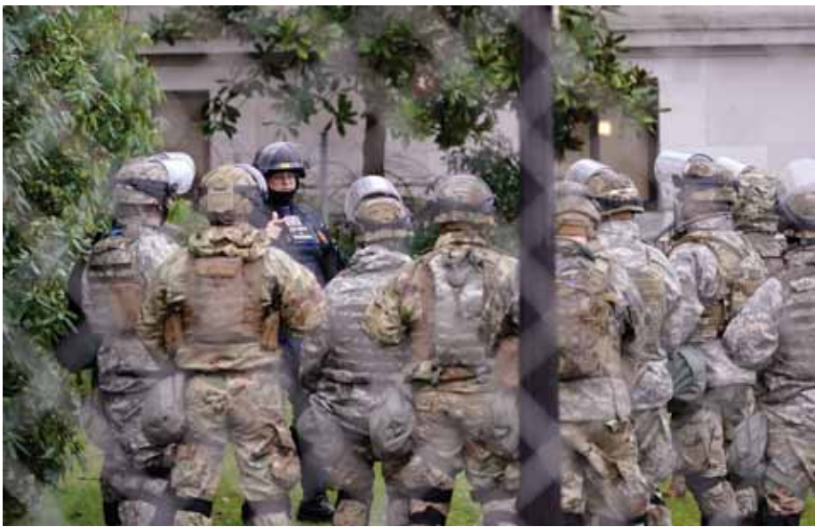
A Washington State Patrol trooper talks with members of the Washington National Guard inside a fence surrounding the Capitol in anticipation of armed protests

Biden is slated to be sworn in as the 46th President of the United States on January 20, along with Indian-origin Kamala Harris as the Vice President.