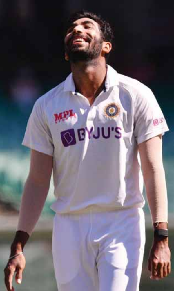
Indian pacer Jasprit Bumrah reacts during Day 4 of 3rd Test

Jasprit sustains abdominal strain; Agarwal, Ashwin participation also in doubt