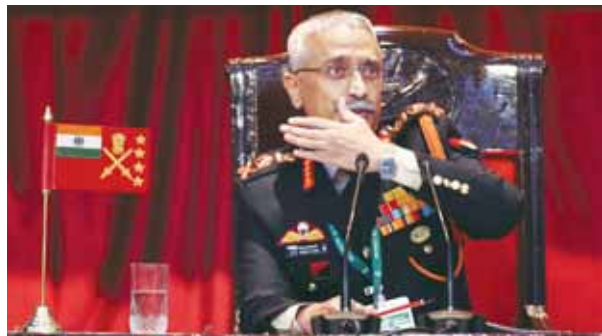
Army Chief General MM Naravane addresses the Army Day annual press conference at the Manekshaw Centre in New Delhi on Tuesday

Operational preparedness of the Indian armed forces is of very high level and they will continue to hold onto their ground. Informing that the forces are alert all along the 4,000 km long LAC, the Army Chief said the stand-offs prompted the Army to do