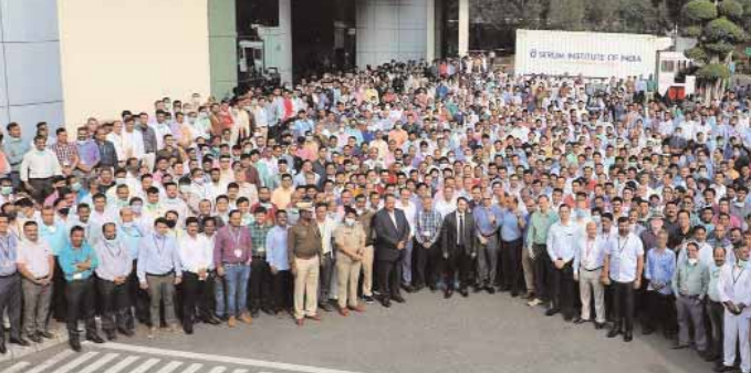
Pune-based Serum Institute of India (SII) CEO-owner Adar Poonawalla poses for a group photograph with hundreds of his employees, as three Kool-Ex Cold Chain trucks, carrying 14.50 tonnes of Covid-19 vaccine vials, prepare to head towards the Pune International Airport for onward dispatch to 13 locations across India on Tuesday

"Each centre will vaccinate at least 100 people and all arrangements have been made for the vaccination