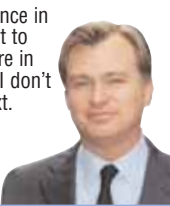
Hollywood filmmaker Christopher Nolan

I had an amazing experience in India and I definitely want to come back and work more in India with Indian actors. I don’t know what I’m doing next.