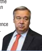
UN Secretary-General Antonio Guterres

With smart policies and the right investments, we can chart a path that brings health to all, revives economies, builds resilience and rescues biodiversity.