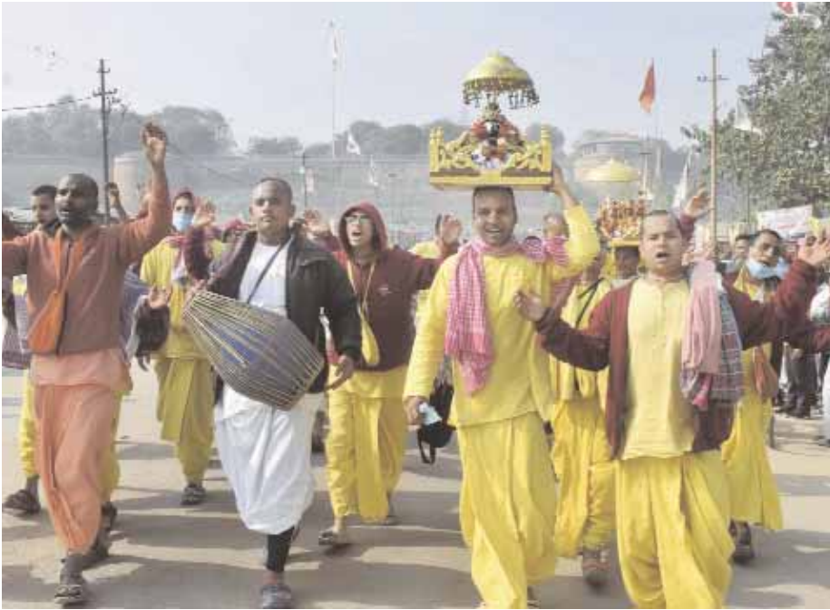
ISKCON followers participate in a religious procession during the annual Magh Mela festival in Prayagraj on Tuesday