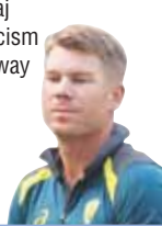
Australian cricketer David Warner

I’d like to say sorry to Siraj and the Indian team as racism and abuse are not in any way acceptable or tolerable anywhere at any time.