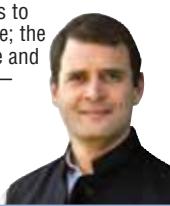
Congress leader Rahul Gandhi

The Government’s efforts to confuse farmers are futile; the farmers know the motive and their demands are clear—withdraw anti-agri laws.