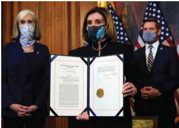
House Speaker Nancy Pelosi displays the signed article of impeachment against President Donald Trump in an engrossment ceremony before transmission to the Senate for trial on Capitol Hill in Washington on Wednesday

The violence temporarily halted the counting of Electoral College votes and resulted in