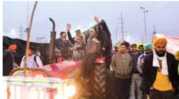
Farmers stage a protest against Centre's farm reform laws at Ghazipur border in New Delhi on Thursday