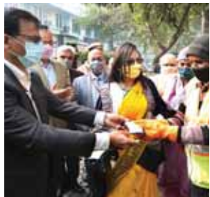
NDMC chairperson Dharmendra launches "Plastic Lao - Mask Pao" Kiosk at Khan Market in New Delhi on Thursday

"The objective of the campaign is to emphasize the use of Masks to avoid Covid-19 and that plastics have value which we need to recover and recycle into useful products. The campaign also highlights the role of the public in the waste value chain, to move towards responsibility driven society by encouraging segregation of plastic waste. As part of the campaign, two mini collection centers have been set