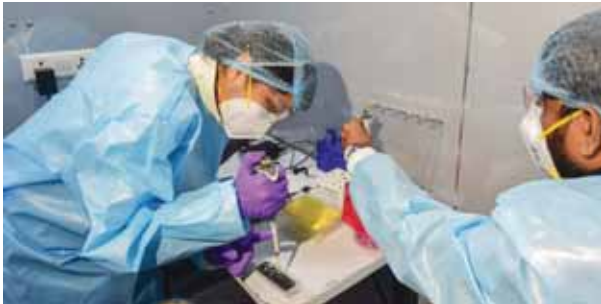
Medics during the launch of a first-of-its-kind Spicehealth Genome Sequencing Laboratory for all positive samples from international travellers at the airport in New Delhi on Thursday

Last month, Adar Poonawalla, CEO of SII whose Covishield vaccine has been given emergency use authorisation (EUA), had said that manufacturers needed protection against all lawsuits for vaccines, especially during the pandemic. Hyderabad-based Bharat Biotech also has been given EUA to supply Covaxin which initially the Government had said was being kept as a "backup plan".