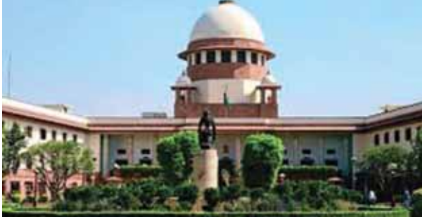
■ NEW DELHI