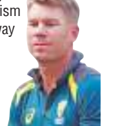
Australian cricketer David Warner

I'd like to say sorry to Siraj and the Indian team as racism and abuse are not in any way acceptable or tolerable anywhere at any time.