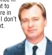
Hollywood filmmaker Christopher Nolan

I had an amazing experience in India and I definitely want to come back and work more in India with Indian actors. I don't know what I'm doing next.