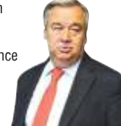
UN Secretary-General Antonio Guterres

With smart policies and the right investments, we can chart a path that brings health to all, revives economies, builds resilience and rescues biodiversity.