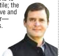
Congress leader Rahul Gandhi

The Government's efforts to confuse farmers are futile; the farmers know the motive and their demands are clear — withdraw anti-agri laws.