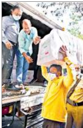
Bundles of Covid-19 vaccine vials being unloaded in Hyderabad on Tuesday

ernment has set up 866 cold storage units across the state to preserve the coronavirus vaccine. The vaccine will be administered across 1,213 centres in the state from January 16.