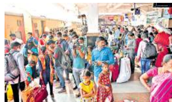
Scene at Secunderabad Railway Station on Tuesday

Many residents of the city started their home-bound journey for the Sankranti festival not only to enjoy the festival but also to relieve themselves of the stress of the busy city life and the stress caused to them for about 10 months by the pandemic. Lakhs of people have set out for their native places in Telugu states to celebrate the festival. In fact, people are on the move for the last one week. However,