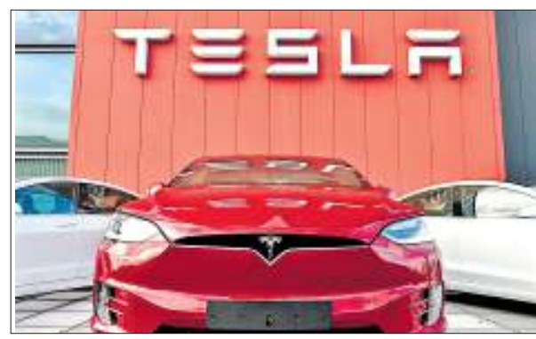
brand will arrive in the country in 2021. More recently,

American electric carmaker Tesla has been keen on making headway into the Indian market and it now seems the automaker is in touch with five state governments to set-up operations in the country. According to a recent report, the company is exploring the possibility of setting up headquarters, manufacturing as well as R&D centres in India. The report comes on the heels of Tesla co-founder, Elon Musk's confirmation that the