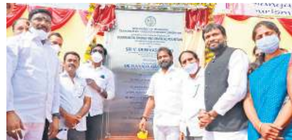
Minister for Youth Sports and Tourism Srinivas Goud laid the foundation stone on Tuesday for a suspension bridge coming up in Khammam district on Tuesday

The district has already provided an IT hub for the city. "We are constructing a green budget hotel near the newly constructed bus stand at a cost of Rs 10 crore. The suspension bridge over the Lakaram Tank Bund would be constructed with Rs 8 crore, a fountain with Rs 2 crore and a food court for night tourists would be set up," he said. The government would