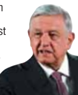
Mexican President Andres Manuel Lopez Obrador

It is the triumph of justice. I commend England's action because WikiLeaks founder Julian Assange is a journalist and he deserves a chance. We will give him protection.