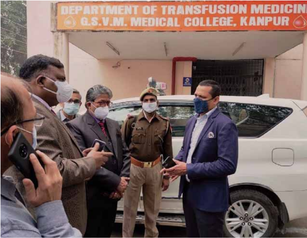
Kanpur Divisional Commissioner, Raj Shekhar makes a sudden visit at Department of Transfusion Medicine, GSVM Medical College on Tuesday