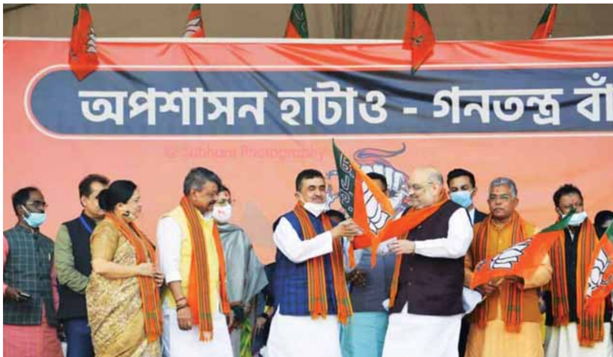
Rajatarangini, by Kashmiri scholar Kalhana, which again was many centuries ago.

For politicians, joining the BJP is like coming home; what they should have politically believed in, and are now believing in. If they are committed to secularism, they can continue down that path. The question of Church and State being separate or otherwise does not arise in the case of the Temple. Virtually every temple can follow its own ritual of worship; how can it then influence the Government? In any