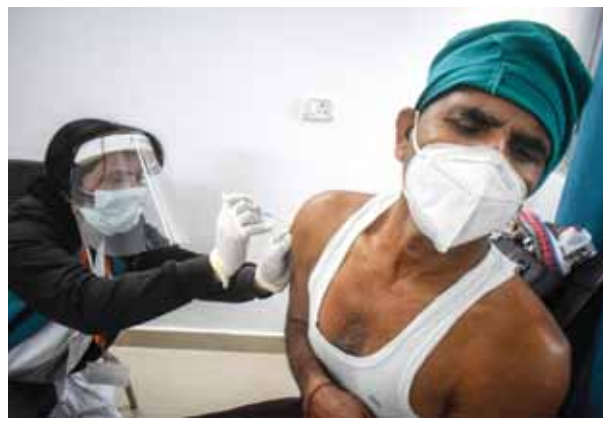
A health-worker takes part in a dry run as part of preparedness for the administration of Covid-19 vaccine, at Moti Lal Nehru Hospital in Prayagraj on Tuesday