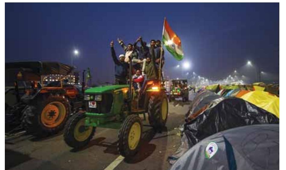
Farmers on a tractor raise slogans during their protest against Centre's farm reform laws, at the Delhi-UP border near Ghaziipur in New Delhi on Tuesday