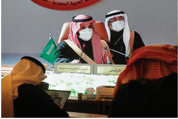
Journalists watch a large display screen as Saudi Crown Prince Mohammed bin Salman, center left, chairs the 41st Gulf Cooperation Council (GCC) meeting in Al-Ula, Saudi Arabia on Tuesday

The emir is in Al-Ula for an annual summit of Gulf Arab leaders that is expected to produce a détente between Qatar