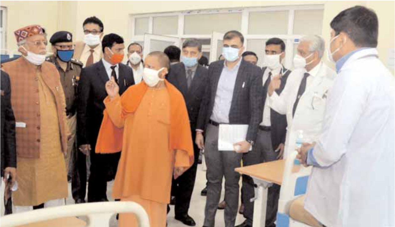
Chief Minister Yogi Adityanath taking stock of the second Covid vaccination dry run at Ram Manohar Lohia Institute of Medical Sciences in Lucknow on Tuesday

He said though there was a norm that every district should hold the dry run in three urban and as many rural hospitals, the numbers were more but in some districts.