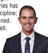
Australia coach Justin Langer

India...their greatest strength over the last couple of series has been their (bowling's) discipline; they have been so disciplined. Ashwin is bowling very well.