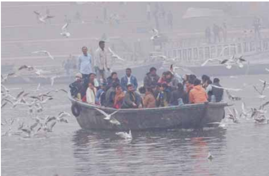
Heavy weather and foggy conditions grip Varanasi on Tuesday

The day also saw a brief spell of rain. Heavy weather