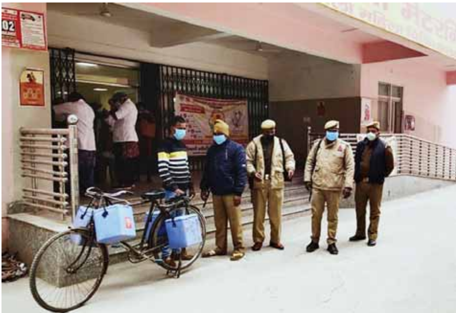
Dummy vaccines being carried to Women's Hospital on bicycle in Varanasi on Tuesday