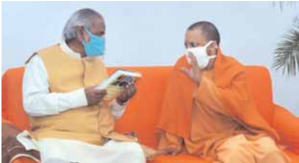
Chief Minister Yogi Adityanath presenting a book to former CM Kalyan Singh on his birthday in Lucknow on Tuesday