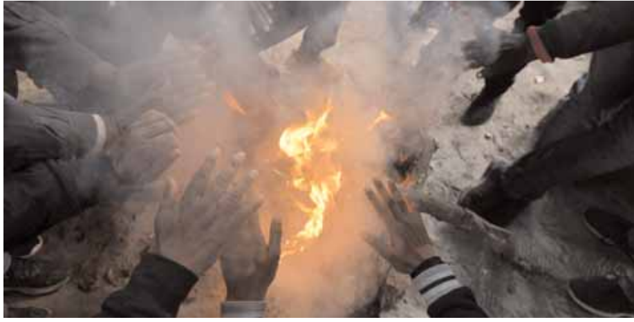
People sitting around a bonfire on Wednesday morning