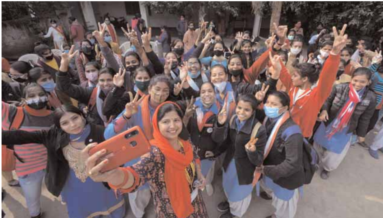
Lohi celebrations at Guru Nanak Girls' Inter College in Naka on Wednesday

The forecast for Lucknow is moderate to dense fog in the morning and clear sky thereafter. The maximum and minimum temperatures are expected to be around 17 degree Celsius and 4 degree Celsius, respectively. The weather is likely to be dry over the state while there is a warning for cold day to severe cold day and cold wave conditions at a few places over the state. Dense to very dense fog is likely at a few places over the state in the morning.