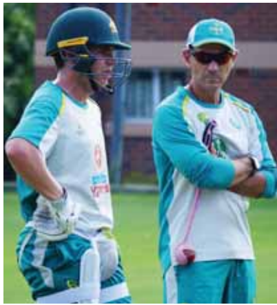
Justin Langer chats with Marcus Harris

"...I literally cannot believe some of the rubbish I read about Steve Smith. Absolute load of rubbish. I mean, if anyone knows Steve Smith, he is a bit quirky and he does some weird (stuff) and we have laughed about it for the last couple of years," Langer said.