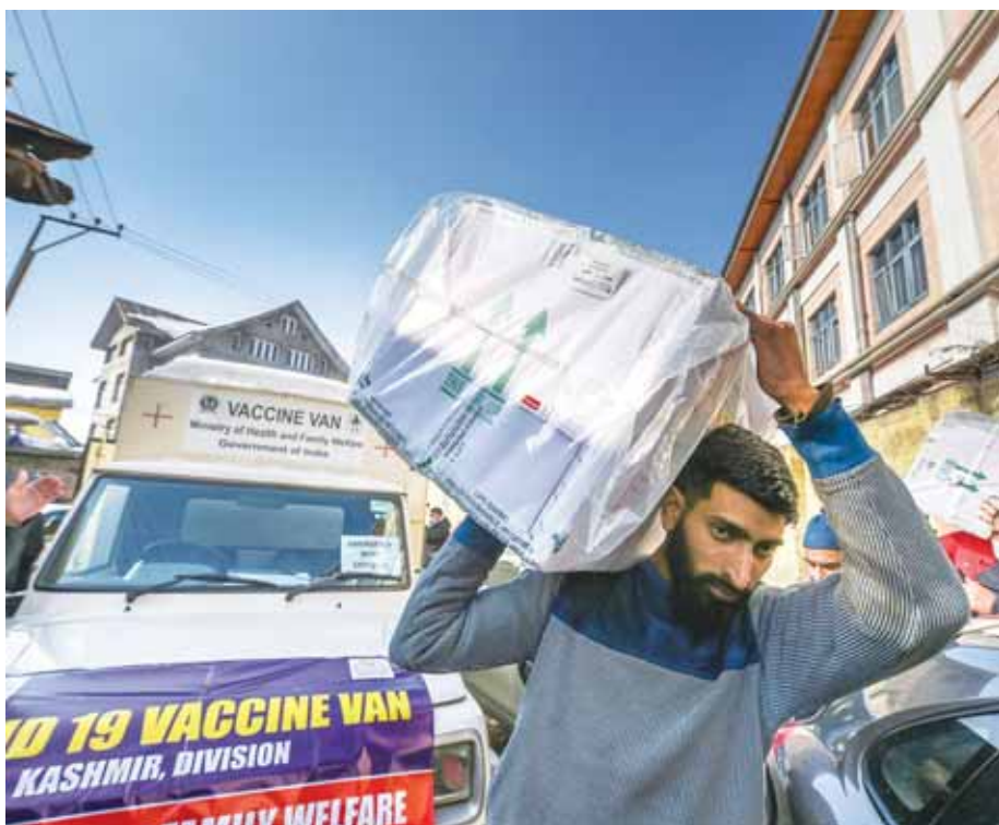
Medical department workers unload boxes of Covid-19 vaccines from a vehicle at cold storage of a hospital in Srinagar on Wednesday

Covid-19 vaccines reaching all centres across India, earlier 4,895 vaccination spots were chosen in country