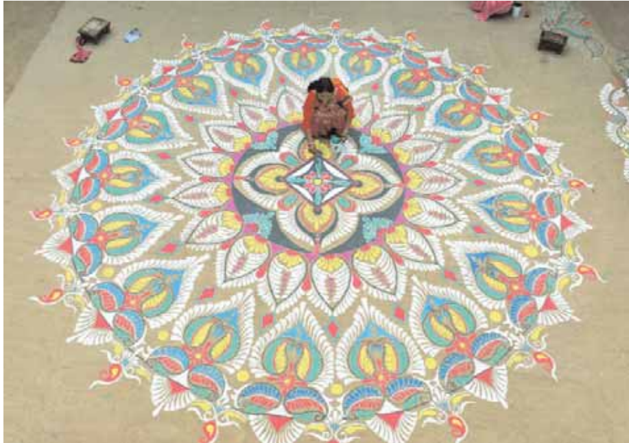
A woman paints a Rangoli design in front of her house on the eve of Makar Sankranti, at Lankamura village on the outskirts of Agartala on Wednesday