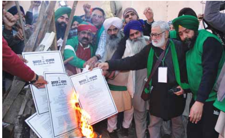
Farmers burn copies of the new farm laws as they celebrate Lohri festival during their ongoing protest against the Central Government, at Singhu Border in New Delhi on Wednesday