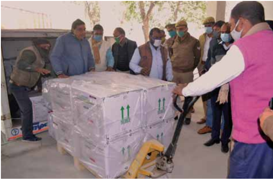
Covid vaccines being delivered from LBSI Airport, Babatpur in Varanasi on Wednesday

After bringing the vaccine doses here, all the pockets were brought out from the cargo amidst tight security arrangements and SDM (Pindra), SP(Protocol), LBSI Airport Director, nodal officer and other senior health department officers were present there. Later, the vaccines were sent to the State Drug Centre at Pt Deen Dayal Upadhyay Hospital. The vaccination in the first phase is scheduled to be started from January 16 when the same would be administered to all the health workers who led from the front during the fight against COVID-19. The list of all these health workers has already