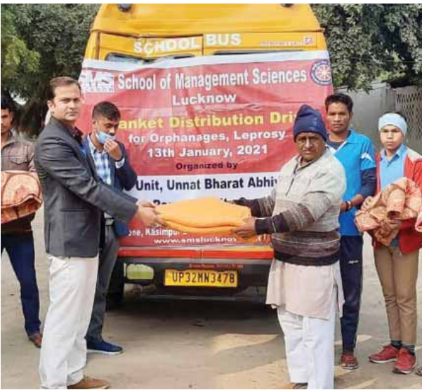
School of Management Sciences distributed blankets to orphans and leprosy patients in Mohanlalganj on Sunday