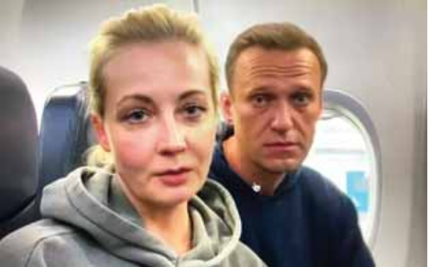
Alexei Navalny and his wife Yulia onboard a flight to Moscow, at the Airport Berlin Brandenburg (BER) in Schoenefeld, near Berlin, Germany on Sunday

Navalny, who has blamed his poisoning on the Kremlin, charged that Russian President Vladimir Putin was now trying to deter him from coming home with new legal motions. The Kremlin has repeatedly denied a role in the opposition leaders