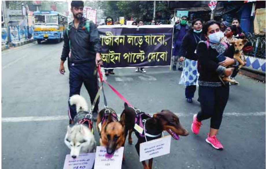
Animal lovers with their pets participate in a rally for a better world for animals in Kolkata on Sunday

This was followed by theme based WAP-7 locomotives- a unique initiative to promote new, improved and latest Push-Pull technology by sketching various World Heritage sites like The Chhatrapati Shivaji Maharaj terminus, The Taj Mahal, The Red Fort etc, on the electric locomotives. All these creations were painted by artistes and employees of Central Railway.