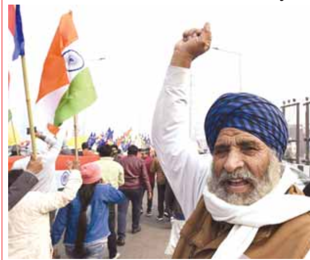
Farmers raise slogans during their protest against the new farm laws at Ghazipur border in New Delhi on Sunday