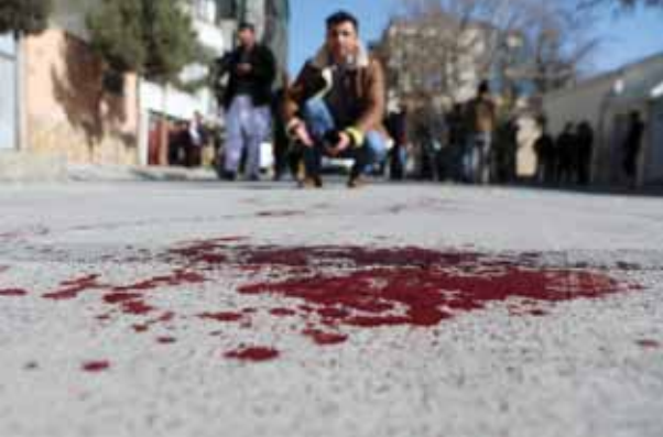
An Afghan journalist films the site where gunmen fired in Kabul, Afghanistan on Sunday

claimed responsibility for multiple attacks in the capital in recent months, including on educational institutions that killed 50 people, most of them students. IS has also claimed responsibility for rocket attacks in December targeting the major US base in Afghanistan. There were no casualties.