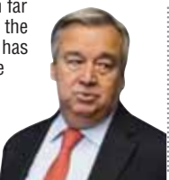
UN Secretary-General Antonio Guterres

The world must act with far greater solidarity. Sadly, the impact of the pandemic has been made worse by the absence of a global coordinated effort.