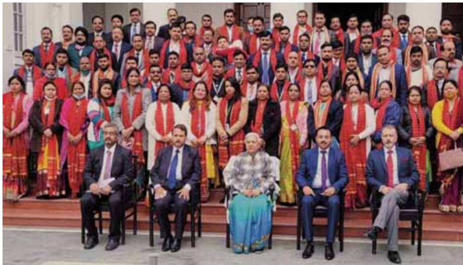
Governor Anandiben Patel felicitates LIC agents at Raj Bhawan for their commendable performance.

Uttar Pradesh Governor Anandiben Patel felicitated the Life Insurance Corporation of India's 'Insurance Warriors' at a grand function held at Raj Bhawan in the state capital on Sunday. The LIC as an organisation praised the efforts of its agents who not only created awareness but helped clients to choose life insurance as per their needs in times of crisis as well. "Today, the nation recognised the importance of LIC and this could be materialised on account of the efforts of the support of the common people as well," it said. "The new business increase points out at the 'Karmaveer Insurance Warriors' who had done a commendable job in furthering awareness regarding LIC," it added. The Governor felicitated