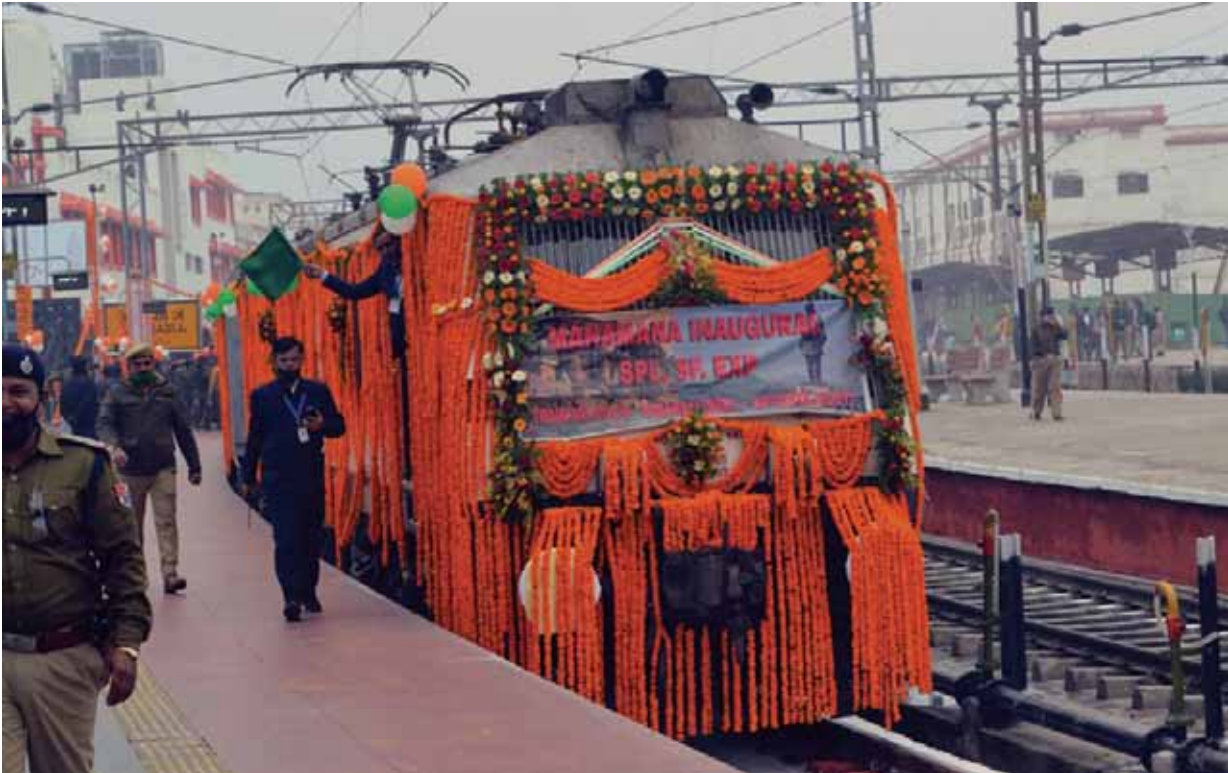
After virtual flag off by PM Narendra Modi, train leaving for Kevadia (Gujarat) from Varanasi Junction station on Sunday