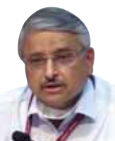
AIIMS Director Dr Randeep Guleria

Mild infection after vaccination is a good sign because it shows the immune system of the body is reacting to the vaccine.