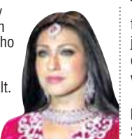
Actor Rituparna Sengupta

Salt is a very sweet story about a woman who is an artist and her husband who is an engineer. Their relationship is sweet but comes with a pinch of salt.