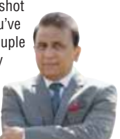
Former Indian captain Sunil Gavaskar

That's an irresponsible shot from Rohit Sharma. You've just hit a boundary a couple of deliveries earlier, why would you play that?