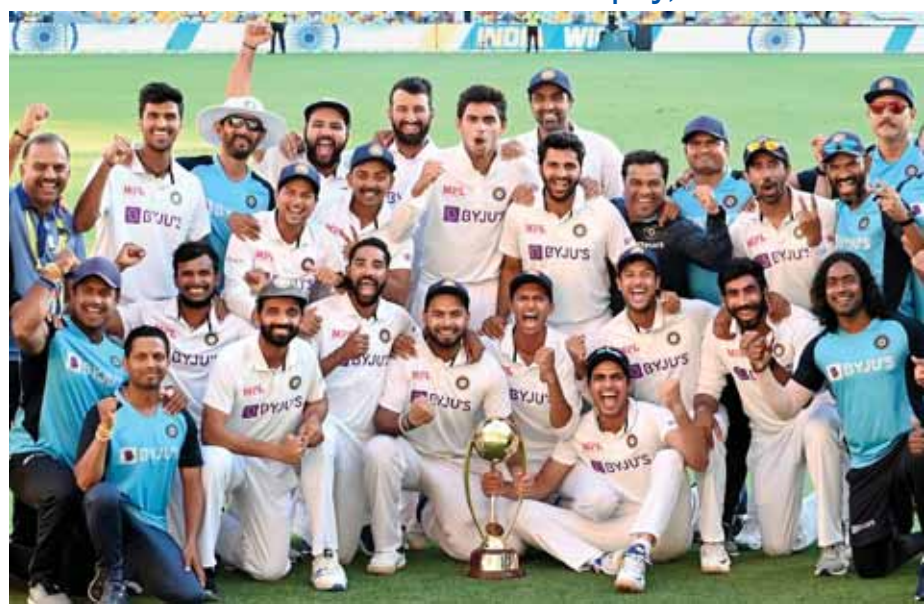
Team India players pose with the winning trophy after defeating Australia by three wickets on the final day of the fourth cricket test match at the Gabba, Brisbane, Australia, on Tuesday

Team India retain Border-Gavaskar trophy, win series 2-1