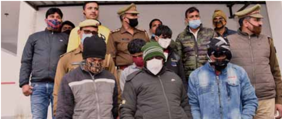
Police work out double murder case in Varanasi on Tuesday