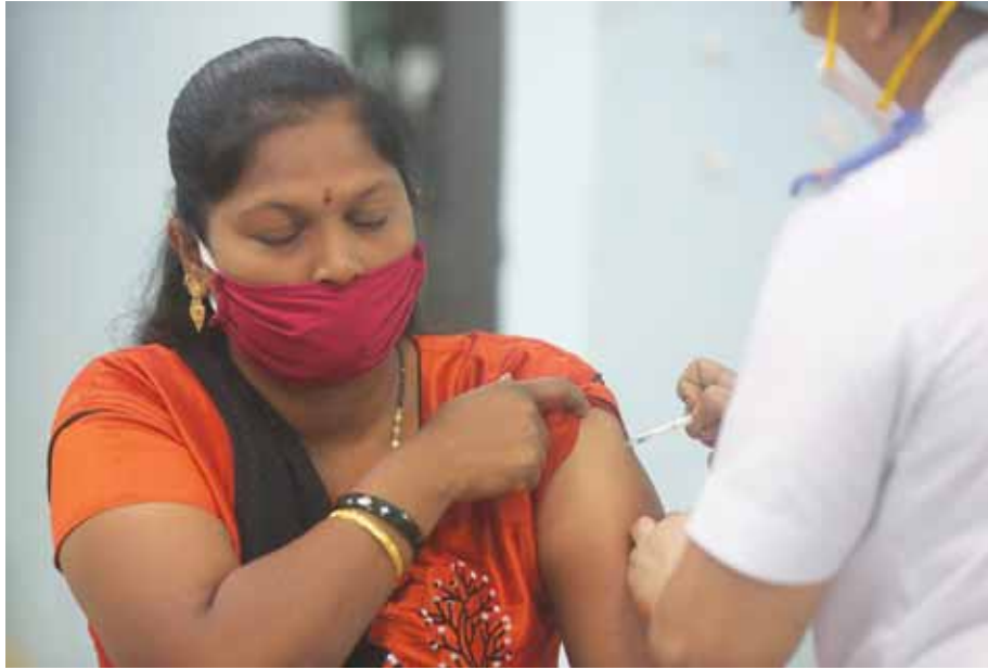
A health worker receives a Covid-19 vaccine at a Government Hospital in Mumbai on Tuesday