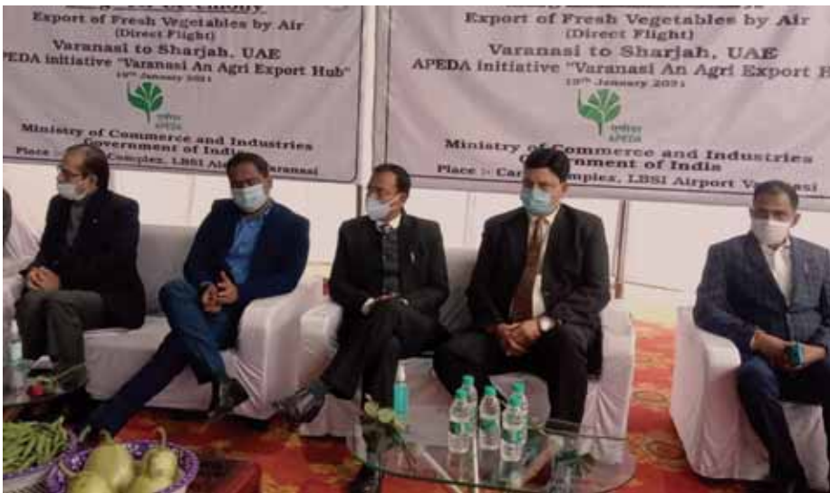
APEDA Chairman and DC at LBSI Airport prior to flag off of consignment of vegetables to UAE in Varanasi on Tuesday

The DC said 'there is a lot of potential in the field of agri-