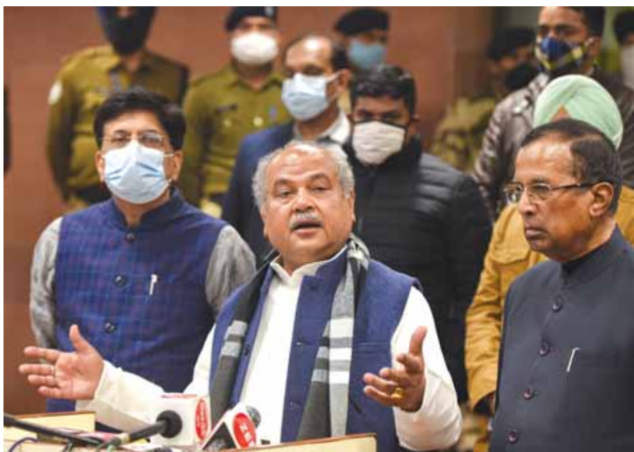
Union Minister for Agriculture and Farmers Welfare Narendra Singh Tomar, along with Minister for Commerce and Industry Piyush Goyal and Minister of State Som Prakash, addresses the media after the 10th round of meeting with farmer leaders on new farm laws at Vigyan Bhawan in New Delhi on Wednesday

After the meeting which lasted for five hours, including two breaks, Union Agriculture Minister Narendra Singh Tomar said the Government has proposed to suspend the implementation of the three laws for 1.5 years, during which period a joint committee of representatives from the Government and farmers' sides