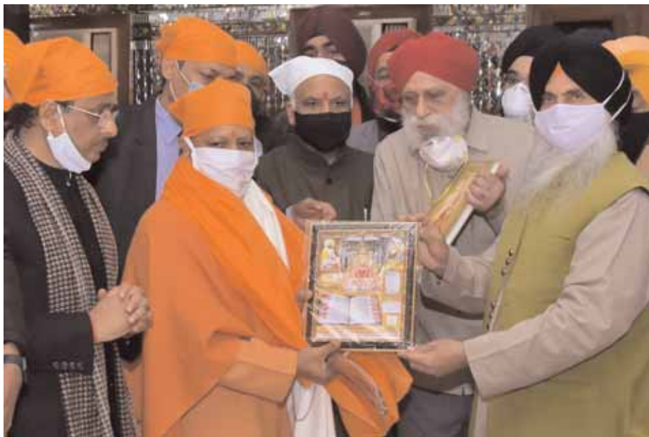
Chief Minister Yogi Adityanath visited Yahiyanaganj Gurdwara on the occasion of 354th Prakash Parv of Guru Gobind Singh. He also listened to the shabad-kirtan. Speaking on the occasion, he said people should seek inspiration from the sacrifices of the Sikh Gurus and carry forward their views to the masses. Also seen in the picture is Deputy CM Dinesh Sharma