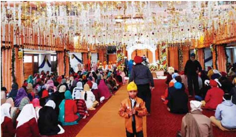
Guru Govind Singh Prakashotsav being celebrated in Varanasi on Wednesday