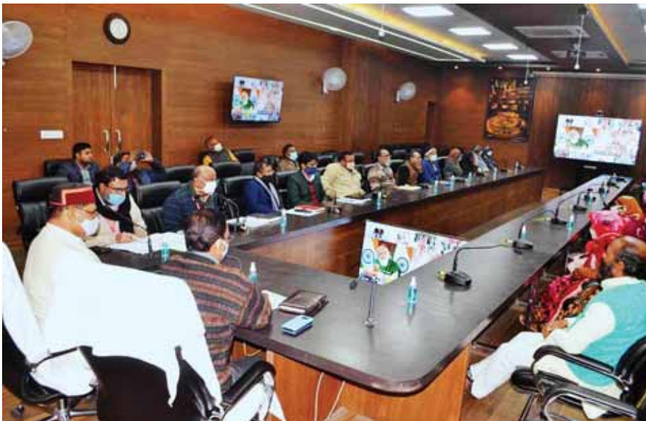
Officers listening to PM on Awas Yojna (Gramin) in Varanasi on Wednesday

Out of total beneficiaries of the state, there were 4,099 and 1,648 of Varanasi district