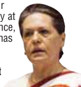
Congress interim president Sonia Gandhi

Like millions of Indians, I am jubilant and proud at your heroic and historic victory at Brisbane. Your performance, against incredible odds, has brought glory to India.