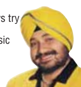
Singer Daler Mehndi

Nachave is a vivacious number that will definitely make you tap your feet. I always try to deliver a different and unique experience to music lovers.