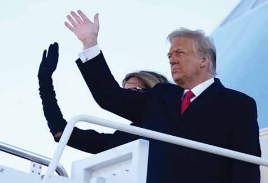
President Donald Trump and first lady Melania Trump board Air Force One at Andrews Air Force Base, Md., on Wednesday

Washington: Outgoing President Donald Trump has pardoned his former political strategist Steve Bannon, one of the key architects of his 2016 electoral victory, as he issued a wave of pardons using the final hours of his presidency to grant clemency to 143 people. The record 73 pardons and 70 commutations came in addition to the dozens of similar actions that Trump took after he lost the November 3 presidential elections to Joe Biden of the Democratic Party. Biden, 78, will be sworn in as the 46th President of the United States on Wednesday. The White House in a statement issued on Wednesday said that Trump granted a full pardon to Bannon, who was in charge of the final months of his 2016 presidential campaign. Bannon was indicted in August when New York federal prosecutors charged him and three others with defrauding donors of more than a million dollars as part of an online