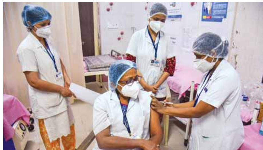
A medic vaccinates a health worker with Covishield vaccine during a countrywide inoculation drive against Covid-19 at Thane Civil Hospital on Wednesday