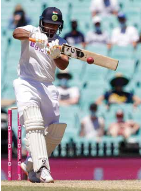
Rishabh Pant plays a pull shot during final day of the third test match

Middle-order mainstay Cheteshwar Pujara moved up one place to seventh after his dogged effort, while Mohammad Siraj jumped 32 places to 45th after taking six wickets in the match, including