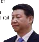
Chinese President Xi Jinping

The high-speed rail is a successful demonstration of China's independent innovation. China is now a world leader in high-speed rail technology.