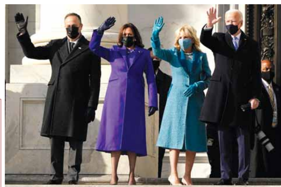
President Joe Biden, his wife Jill Biden and Vice President Kamala Harris and her husband Doug Emhoff arrive at the steps of the US Capitol for the start of the official inauguration ceremonies in Washington on Wednesday

Washington: Donald Trump on Wednesday skipped his successor Joe Biden's inauguration and exited the White House for the last time as the US President to board a flight to his Mar-a-Lago estate in Florida, which will be his permanent home after he failed to win his re-election bid.