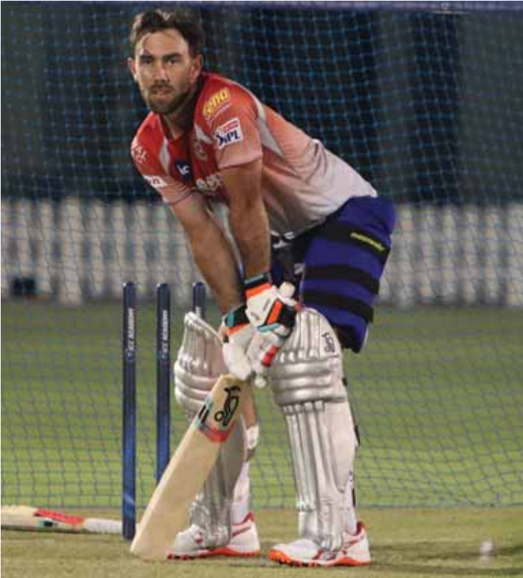
Glenn Maxwell bats during practice session