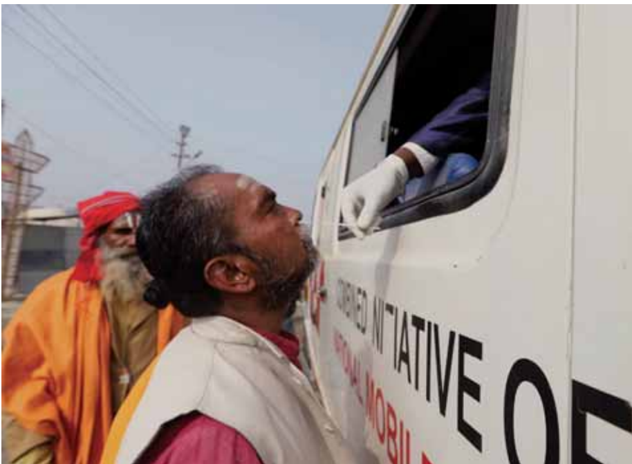
A healthcare worker collects a swab sample from a sadhu for rapid antigen test in Magh Mela in Prayagraj

GOVT EFFORT IN FIGHTING COVID LAUD-ED: The effort the government in fighting corona is commendable. Medical scientists and doctors are constantly in research. Everyone should thank these scientists. This