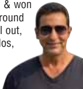
Former Pakistani cricketer Wasim Akram

No adversity could stop them, frontline players injured, & won after a remarkable turnaround from the depths of 36 all out, inspiring for others. Kudos, India!