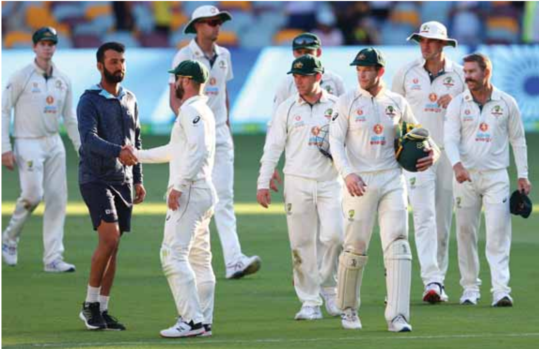
India's Cheteshwar Pujara, second left, is congratulated by Australia's Matthew Wade after defeating Australia by three wickets on the final day

"That's not taking anything away from those Indian guys that played but their first selection side, there's probably only two or three players in that side who would play."