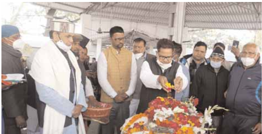
Congress leader PL Punia paying floral tributes to the mortal remains of former Arunachal Pradesh Governor Mata Prasad at Baikunth Dham in Lucknow on Wednesday