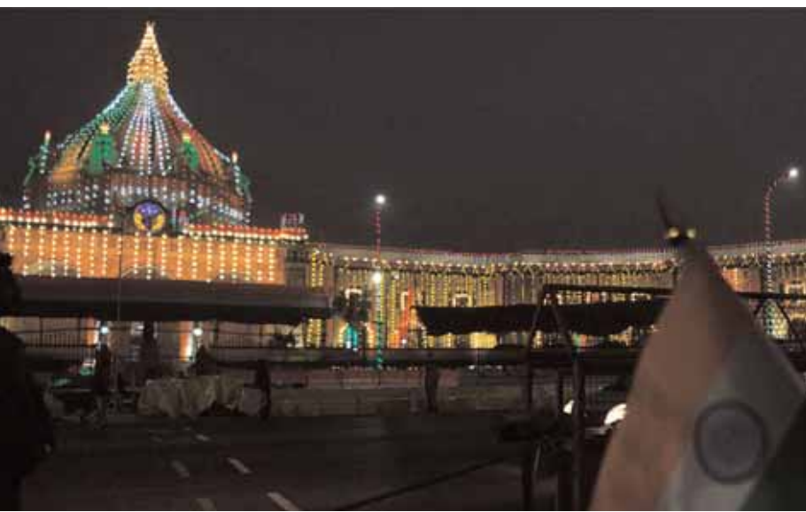
Vidhan Bhawan decked up on the eve of Republic Day