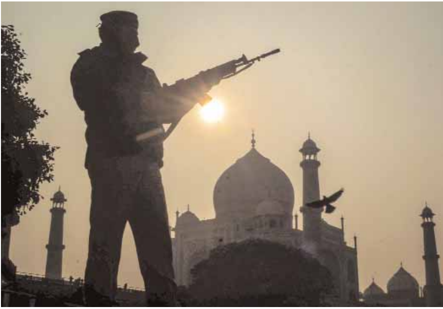
A security person stands guard near the Taj Mahal on the eve of Republic Day, in Agra on Monday

Port Blair: Andaman and Nicobar Islands did not record a single fresh Covid-19 case in the last 24 hours, a health department official said on Monday. The coronavirus tally in the union territory remained at 4,993, while a total of 62 people have died so far due to the contagion, he said. One more person was cured of the disease in the last 24 hours, taking the total number of recoveries in the archipelago to 4,908.