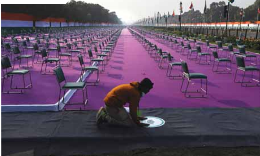
A worker pastes a sticker on a carpet ahead of the Republic Day parade in New Delhi