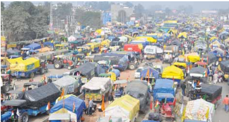
Tractors lined up on the National Highway 44 (GT Road) to participate in farmers' tractor rally as part of their ongoing agitation against farm reform laws near Singhu border in Sonipat district on Monday

The farmers' unions also claimed that around two lakh tractors are expected to participate in their tractor rally on the Republic Day in Delhi.