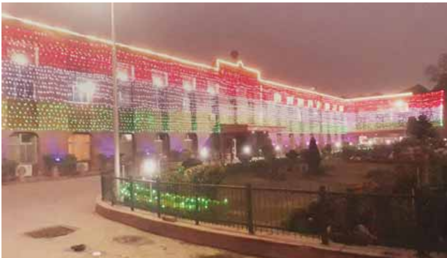
NER DRM Office glittering with attractive lighting on eve of Republic Day in Varanasi on Monday

Meanwhile, on the eve of the day, several government buildings, stations and others have glittered with attractive lighting arrangements. Like previous years Varanasi Junction (Cantt) and other railway stations apart from NER DRM office at Lahartara have also been decorated with