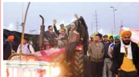
Farmers stage a protest against Centre's farm reform laws at Ghazipur border in New Delhi on Thursday