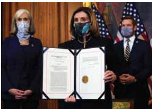
House Speaker Nancy Pelosi displays the signed article of impeachment against President Donald Trump in an engrossment ceremony before transmission to the Senate for trial on Capitol Hill in Washington on Wednesday

The violence temporarily halted the counting of Electoral College votes and resulted in