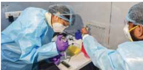
Medics during the launch of a first-of-its-kind Splicehealth Genome Sequencing Laboratory for all positive samples from international travellers at the airport in New Delhi on Thursday

Last month, Adar Poonawalla, CEO of SII whose Covishield vaccine has been given emergency use authorisation (EUA), had said that manufacturers needed protection against all lawsuits for vaccines, especially during the pandemic. Hyderabad-based Bharat Biotech also has been given EUA to supply Covaxin which initially the Government had said was being kept as a "backup plan".