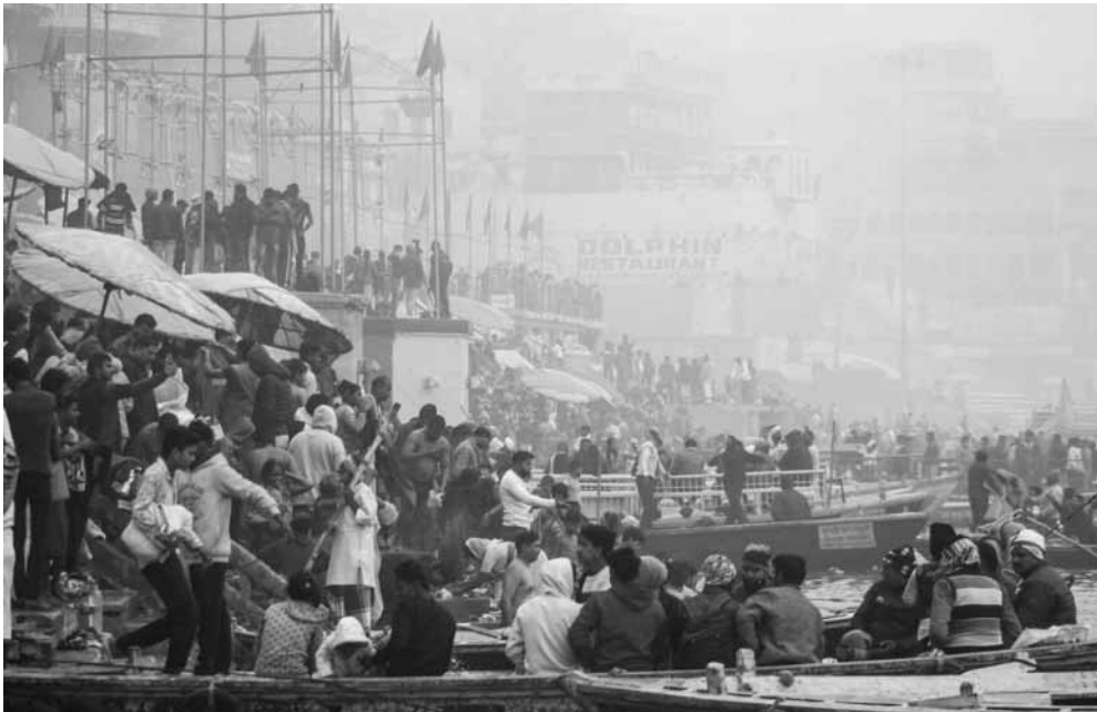
Devotees perform rituals on the bank of Ganga river during 'Makar Sankranti' festival celebration, in Varanasi on Thursday

The villagers have demanded a compensation of Rs 50 lakh for the victim's family. The police and forest officials had a tough time in pacifying the angry mob. IANS