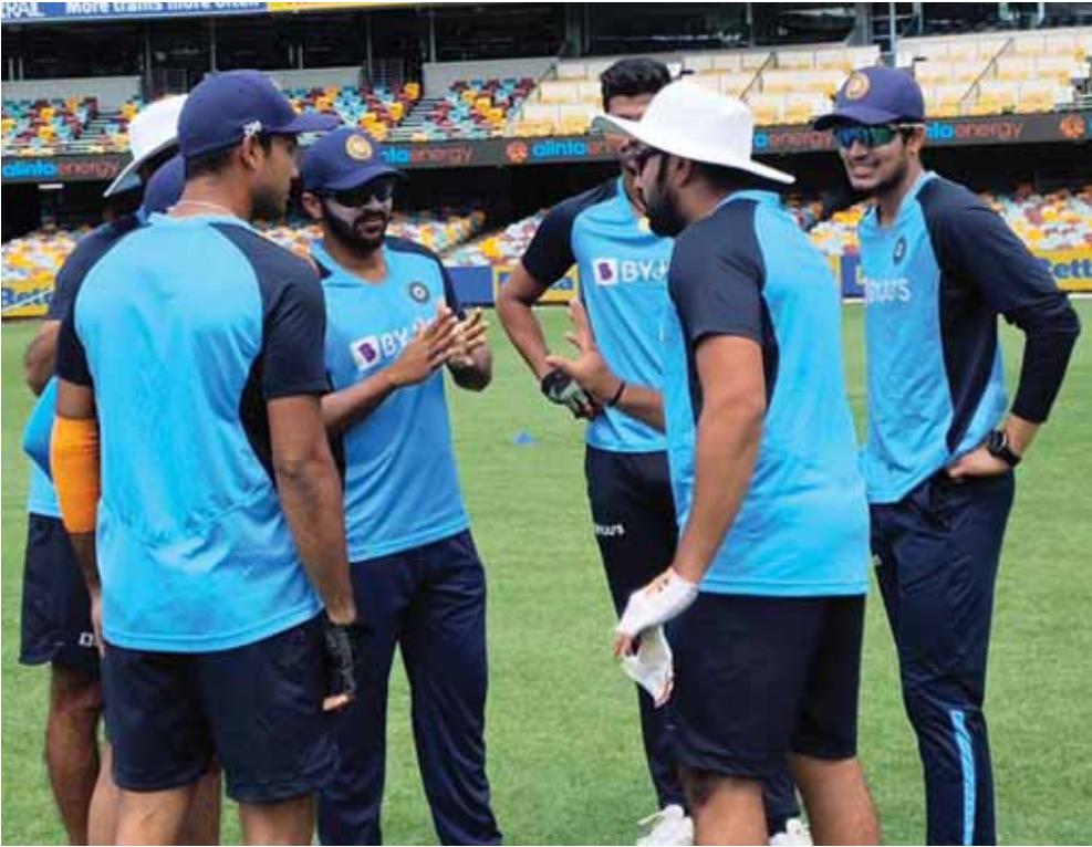
Indian players chat during warm-up session on the eve of fourth Test against Australia at the Gabba