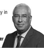
Portuguese Prime Minister Antonio Costa

With the new state of emergency starting on Friday, the rule is to stay in a home-based retreat. However, schools will remain open as usual.