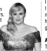
Actor Rebel Wilson

I wasn't loving myself in the way that I should from 20 to 40 — that's 20 years. I feel so sad that I did that to myself, just not loving yourself the right way.