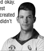
Australian cricketer Tim Paine

I think Lyon has bowled okay. I thought in the first Test match at Adelaide, he created heaps of chances and didn't get a hand.