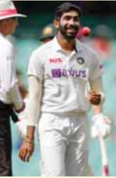
the World Cup-winning left-handed batsman told Star Sports .

"... You got to look after him (Bumrah) as well, because he is going to be the leader of the attack for a very long time, so him being fit is very important,"