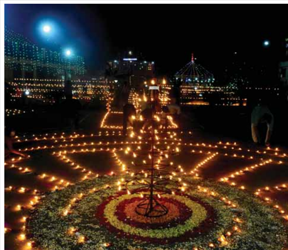
The Lord Ayyappan Temple at Tatibandh (Raipur) was illuminated with earthen lamps on the occasion of Makara Sankranti on Thursday.