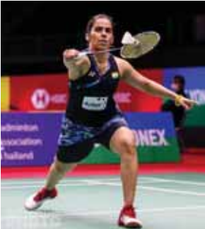
bination of Mohammad Ahsan and Hendra Setiawan.

Indian men's doubles pair of Satwiksairaj Rankireddy and Chirag Shetty also bowed out of the competition after suffering a 19-21, 17-21 defeat against second seeded Indonesian com-