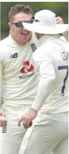
below Sri Lanka's 181 against Pakistan in 2000.

Bess though remained the hero of the day with his second five-wicket haul in his 11th Test as the venue witnessed its lowest first-innings score, well