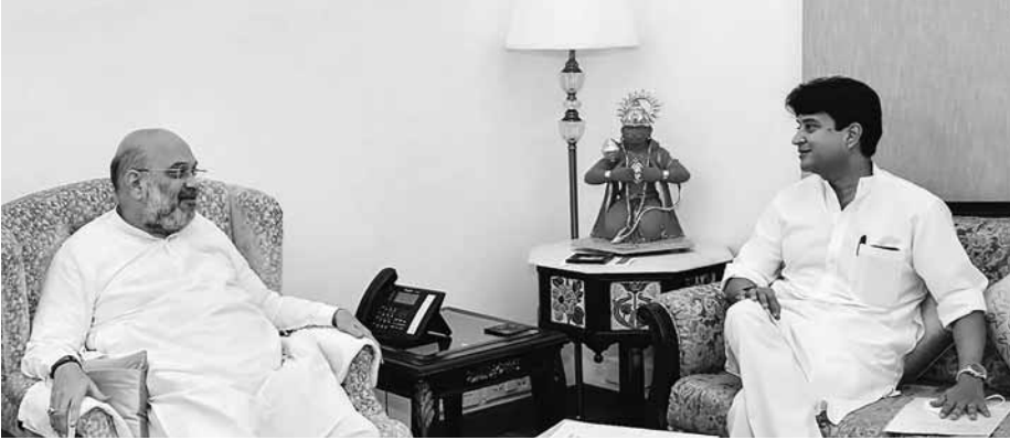
Union Home Minister Amit Shah with Civil Aviation Minister Jyotiraditya Scindia during a meeting in New Delhi.