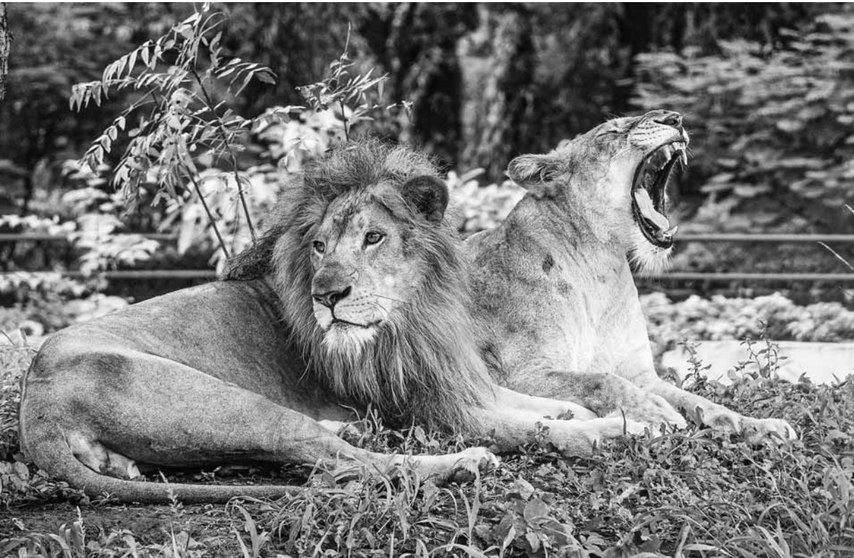
A pair of Asiatic lions at the Sarthana Nature Park, in Surat on Wednesday