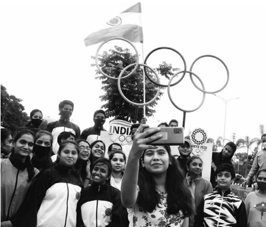
A young girl takes a selfie after the inauguration of a selfie point ahead of the Tokyo Olympics, in Bhopal on Wednesday

"They also pointed out the place of making of the heroin, which was situated in the forest of the Village Bhaira on the banks of Ganga River," said the DCP adding that further investigation is underway.