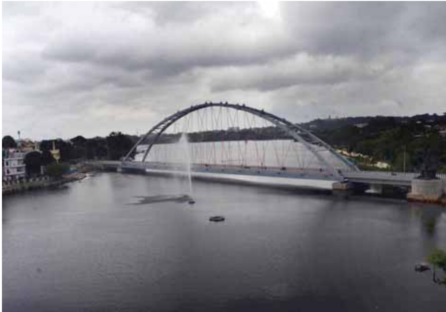
Dark clouds hover over the Lower Lake in Bhopal on Wednesday

He said e-tender was exposed in Shivraj govt's last tenure but the probe into seven e-tenders was hushed up and he had ordered officers to widen the probe and it reached upto 90-100 dubious tenders. But after my government was brought down, nothing happened, he added saying he did not use the probe to hunt down anyone as he was busy working for the state. He also slammed the BJP for skyrocketing inflation saying fuel, pulses, cooking gas, milk, eggs and other essentials have shown unprecedented price escalation which has hassled every section. Middle class is hassled while several poor have turned into beggars, claimed Nath.