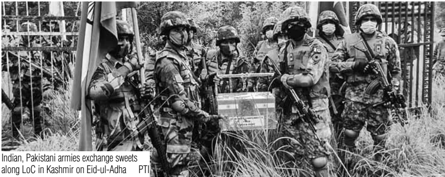
Indian, Pakistani armies exchange sweets along LoC in Kashmir on Eid-ul-Adha PTI

also issued warnings following unusual movement of heavily armed terrorists camping across different launching pads inside Pakistan Occupied Jammu & Kashmir. According to a Srinagar based Defence Spokesman, "On the occasion of Eid-ul-Adha and as a gesture for promoting Peace, Harmony & Compassion in the true spirit of the festival, India and Pakistan armies held a flag meeting and exchanged sweets at Kaman Aman Setu, Uri &