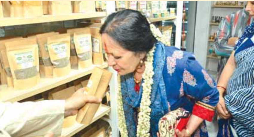
Kavach Natural was launched in the presence of luminaries such as Padma Vibhushan Dr Sonal Mansingh, MP, Rajya Sabha and singer-songwriter Daler Mehndi.

The group has over 20 GW of capacity under construction, including five GW of renewable energy projects. Uninterrupted supply of electricity through environment-friendly energy projects at affordable prices has been the hallmark of NTPC.