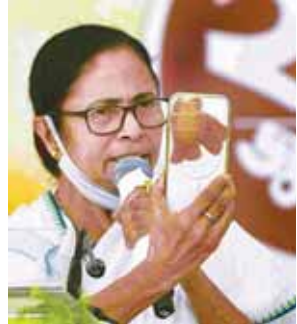
West Bengal CM Mamata Banerjee shows her taped phone while speaking on the Pegasus spyware row during virtual Sahid Divas in Kolkata

"I ask all the national leaders from all the States to make a Front and start working on a plan well in advance to overthrow this anti-people Government from the Centre. ... there is no point starting late because calling the doctor after the disease has set in makes no sense," Banerjee said. She was