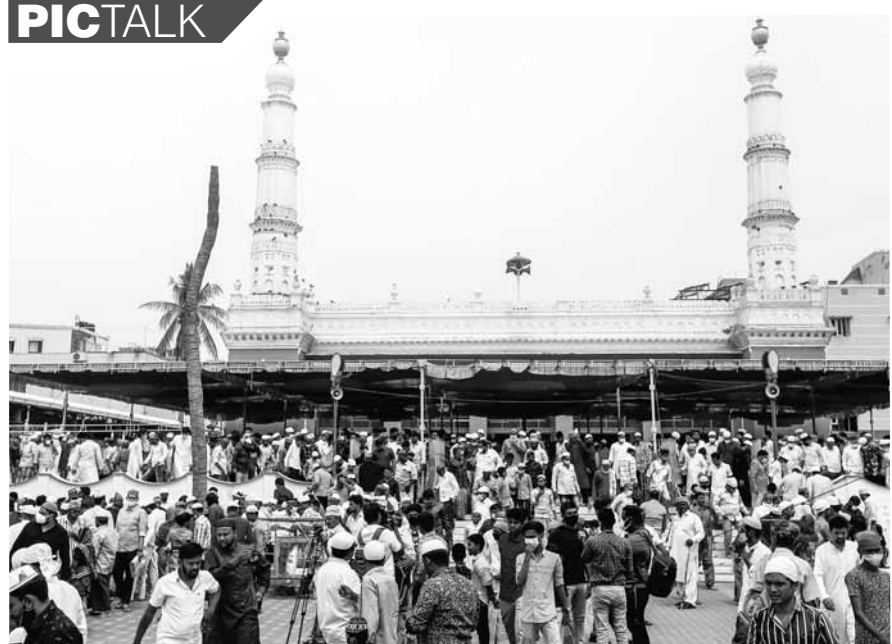
Devotees offer prayers on the occasion of Eid al-Adha at the Badi Masjid in Chennai