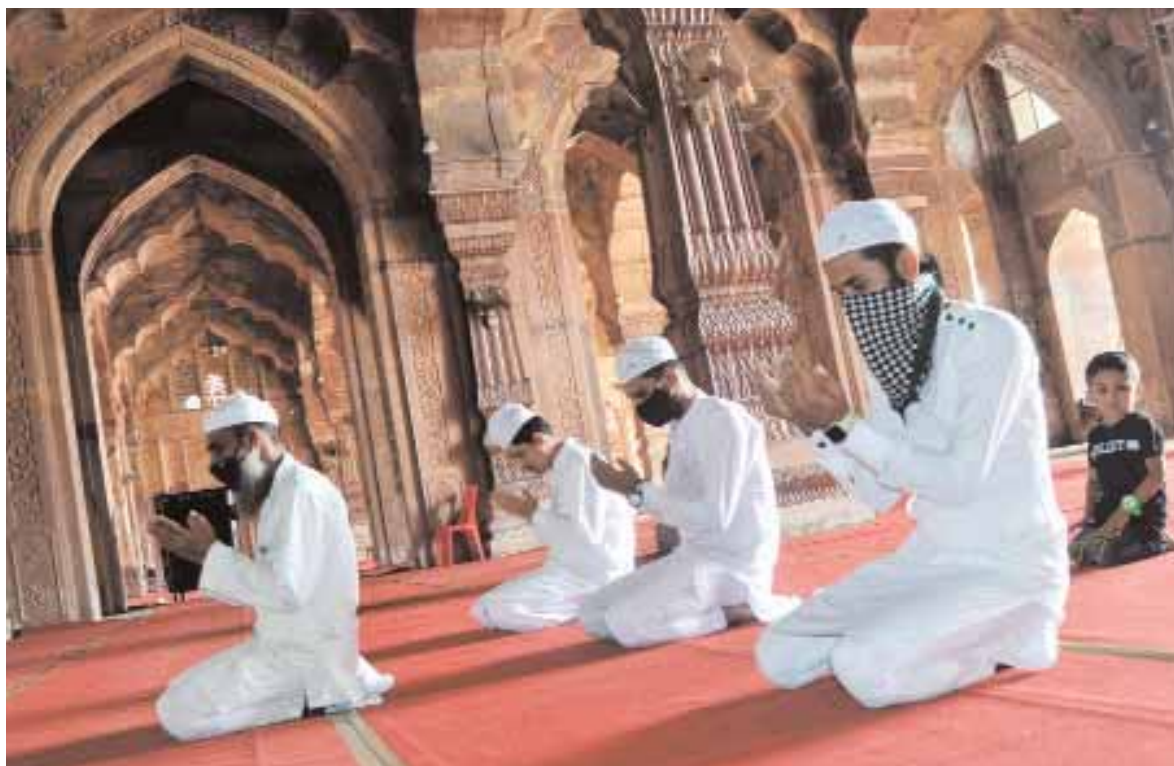
Muslim devotees offer prayer at the historical Taj-ul-Masajid mosque on the occasion of Eid-al-Adha in Bhopal on Wednesday

Addressing the media, Sisodia said: "The Delhi Government constituted a committee to investigate deaths caused by lack of oxygen with an aim to give an assistance of Rs 5 lakh to the aggrieved families but the Centre rejected the formation of this committee through an order by the Lieutenant-Governor.