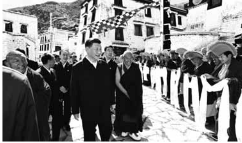
Chinese President Xi Jinping visits the Drepung Monastery located in the western suburbs of Lhasa, southwestern China's Tibet Autonomous Region on Thursday

Xi, also General Secretary of the ruling Communist Party of China (CPC) and Chairman of the Central Military Commission, met top officials of the Tibet Military Command of the People's Liberation Army, guarding China's border with India in Arunachal