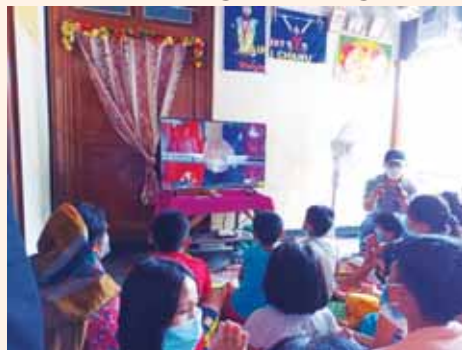
Family members and neighbours of Mirabai Chanu gather together to watch her lift

“She had told us she will win Gold or at least a medal. So, everybody was waiting for it to happen. Many of our relatives who lived far came last evening. They stayed overnight with us,” Chanu's mother said.