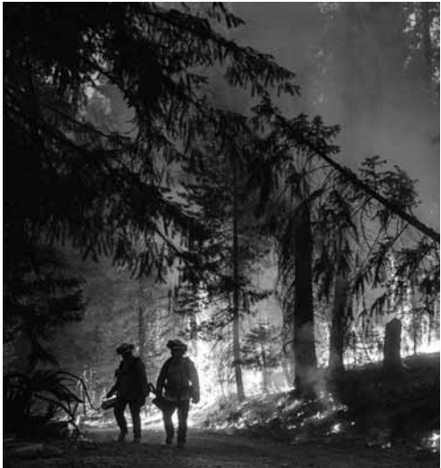
Firefighters light a backfire to stop the Dixie Fire from spreading near Prattville in Plumas County, Calif. on Friday

"Pakistan has a key role in a new US diplomatic offensive aimed at ensuring a peaceful transfer of power in Afghanistan," diplomatic sources told the newspaper on Friday. Under a deal with the Taliban, the US and its NATO allies agreed to withdraw all troops in return for a commitment by the militants that they would prevent extremist groups from operating in areas they control.