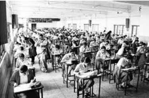
PNS ■ NEW DELHI

The Council of Indian School Certificate Examination (CISCE), which conducts the exams for the Indian Certificate of Secondary Education (ICSE), or Class 10, and Indian School Certificate (ISC), or Class 12, on Saturday declared the results of the cancelled exams.