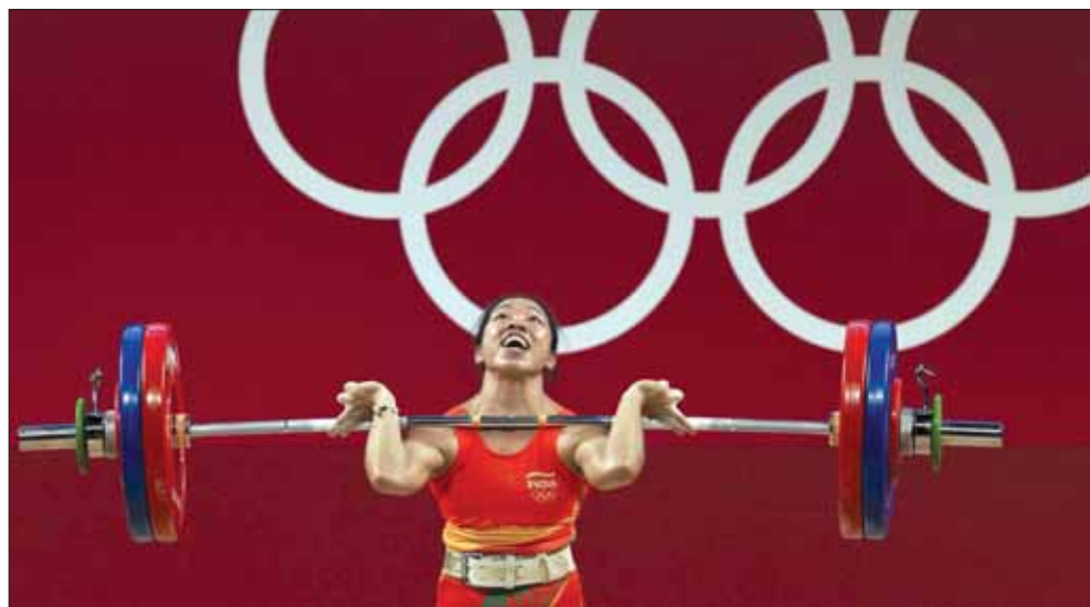
Mirabai Chanu reacts during a successful attempt in the 49 kg category of Women's Weightlifting event of the Summer Olympics 2020 in Tokyo on Saturday

21-year-long wait for weightlifting medal at Olympics ends