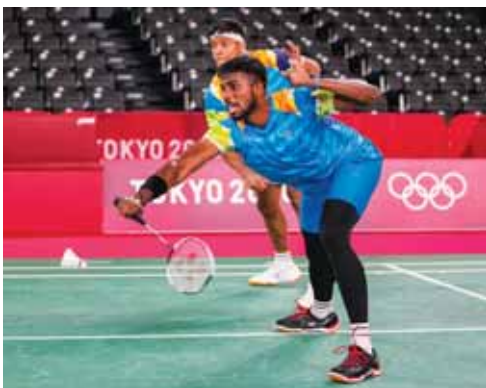
India's Satwiksairaj Rankireddy and Chirag Shetty compete against Taiwan's Lee Yang and Wang Chi Lin during their men's doubles group stage match

However, 13th seeded B Sai Praneeth suffered a demoralising 17-21, 15-21 loss to world number 47 Misha Zilberman of Israel in a 41-minute men's singles group D match.