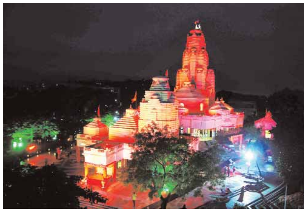
Karunadham Ashram temple decorated with lighting on the occasion of Guru Purnima festival in Bhopal on Saturday

On April 20, the city had reported a record 28,395 cases. On April 22, the case positivity rate was 36.2 per cent, the highest so far. At 448, the highest number of deaths was reported on May 3.