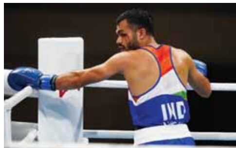
Vikas Krishan stands in his corner during his men's 69-kg boxing match