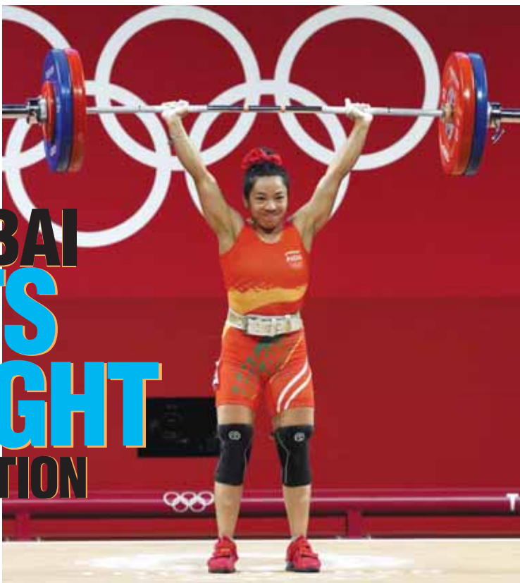
Mirabai Chanu Saikhom competes in the women's 49kg weightlifting event at the 2020 Olympics on Saturday

Competing in her second Olympics, Chanu claimed the Silver medal in the 49kg category with a total of 202kg (87kg+115kg). It was India's second Olympic medal in the sport after Karnam Malleswari's Bronze that came 21 years ago