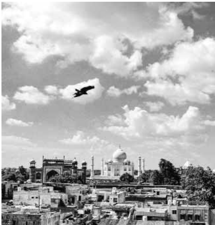
A view of clouds hover over the Taj Mahal in Agra on Saturday

Earlier, the petitioner informed the court that one of the areas considered as a corridor was restored as it was later discovered to be a habitat and the restoration of the same was also upheld by the Supreme Court. PTI