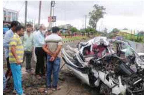
Mangled remains of a car after it collided with a truck at Hoshangabad road in Bhopal on Sunday

Taking to Twitter, he wrote in Hindi, which loosely translated to English reads, "Saddened by the news of the untimely demise of many precious lives in an accident caused by a collision between a car and a truck on Bhopal-Hoshangabad road. I pray to God to grant the departed souls a place at his feet and strength to the family members to bear this profound pain. Peace!"