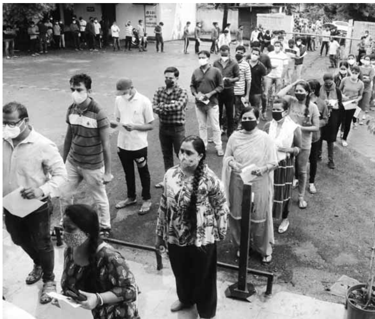
Aspirants stand in a queue outside an examination centre to appear in MPPSC prelims 2021 exam in Bhopal on Sunday

The two have been spotted in a CCTV footage. Police said that the accused spotted are similar to the fraudsters who cheated a woman in the same manner near MANIT square on July 14.