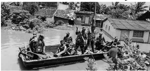
Army personnel during a rescue operation at a flooded area after rain in Kolhapur

"The rain and the consequent floods wreaked havoc in places like Chiplun, Mahad and Khed. The people have suffered huge losses. The state government will do everything to ensure that you are back on your