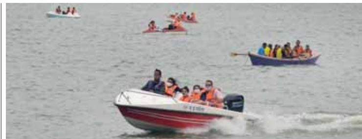
People enjoy boat rides at Upper Lake on a cloudy evening in Bhopal on Sunday