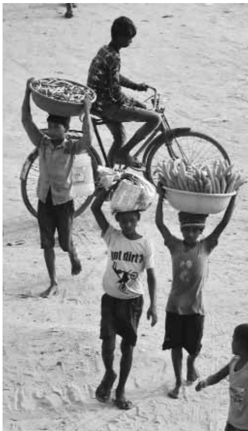
Children carry vegetableas as they walk towards a wholesale market at Digha in Patna on Sunday

Pending utilisation certificate and audited accounts of grant-in-aids resulted in possible irregularities of Rs 9,381.61 crore, while the delay in recovery of receipts, advances and other charges added up to alleged irregularities of Rs 8,821.35 crore.