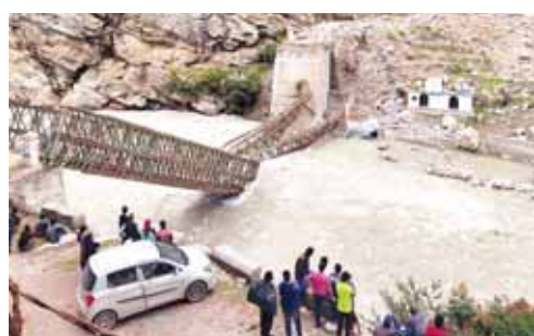
A bridge collapsed after a landslide at Batseri of Sangla valley in Kinnaur district on Sunday

A terrifying video footage of the landslide showed large