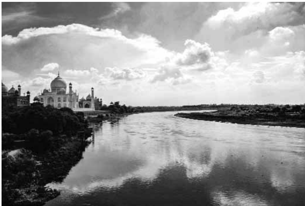
A view of the Yamuna river flowing behind the Taj Mahal in Agra on Sunday

Gujarat's Covid-19 figures are as follows: Positive cases 8,24,713, new cases 30, death toll 10,076, discharged 8,14,307, active cases 330, people tested so far - figures not released.