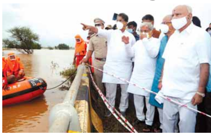
Karnataka Chief Minister BS Yediyurappa visits area affected with rain-water in Belgaum district on Sunday

Given that 'Lingayat' seers are demanding that there should not be any change of