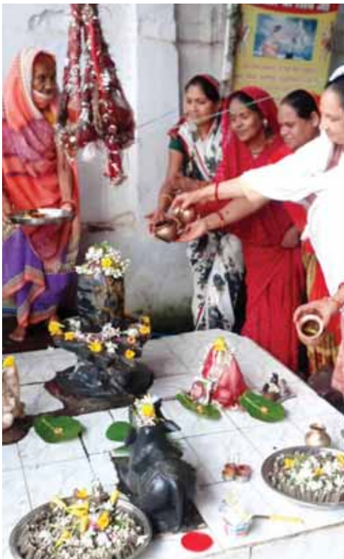
Women devotees offer prayer in a Shiv temple at the beginning of holy month Shravan in Bhopal on Sunday

There is a possibility of heavy rain in west Madhya Pradesh today. In east Madhya Pradesh also there is a possibility of heavy to very heavy and very heavy rainfall at many places with rain at most places, after which there is a possibility of reduction in rainfall activities in these areas.