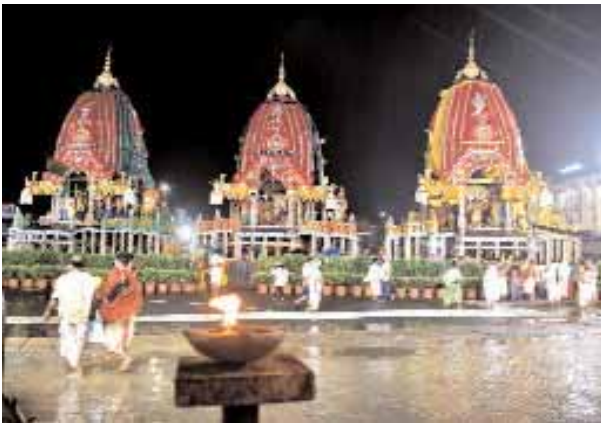
Lord Jagannath Lord Balabhadra and Devi Subhadra displayed to public sitting on their chariots during Suna Besha ritual on Wednesday evening

Although it was not made public about the varieties of invaluable and the exact weight used in the decorations due to security reasons, however, sources informed that many as 30 designs weighing around 150 kg of ornaments were used to decorate the deities. The