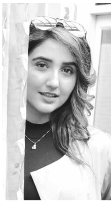
Actors Ashnoor Kaur and Saanand Verma captured during shooting of the short film Swad , in New Delhi.