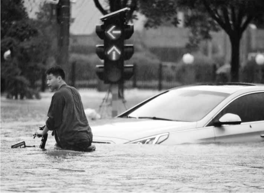
A man rides a bicycle through a flooded intersection in Zhengzhou in central China's Henan Province on Tuesday

Heavy waterlogging has led to the virtual paralysis of the city's road traffic.