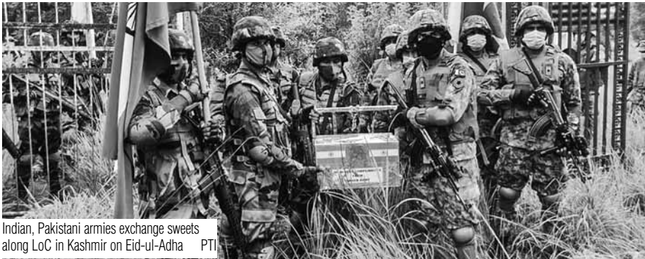
Indian, Pakistani armies exchange sweets along LoC in Kashmir on Eid-ul-Adha

also issued warnings following unusual movement of heavily armed terrorists camping across different launching pads inside Pakistan Occupied Jammu & Kashmir. According to a Srinagar based Defence Spokesman, "On the occasion of Eid-ul-Adha and as a gesture for promoting Peace, Harmony & Compassion in the true spirit of the festival, India and Pakistan armies held a flag meeting and exchanged sweets at Kaman Aman Setu, Uri &