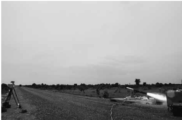
DRDO successfully flight-tests indigenously-developed MPATGM for minimum range

Fire and forget, anti-tank guided missile developed indigenously