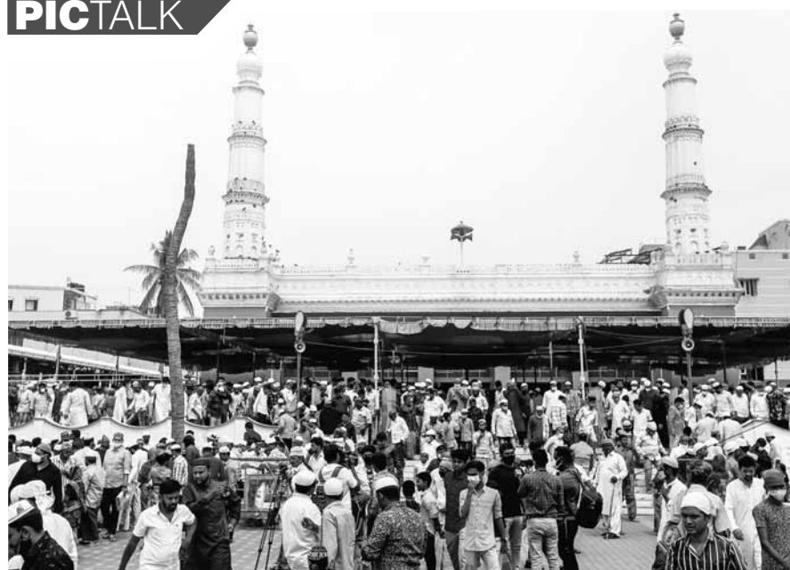
Devotees offer prayers on the occasion of Eid al-Adha at the Badi Masjid in Chennai