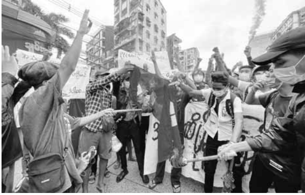
Protesters burn Myanmar Armed Forces' flags during a flash mob protest at Mingalar Taung Nyunt township in Yangon, Myanmar