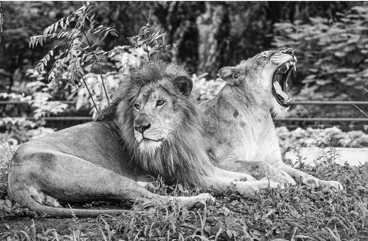
A pair of Asiatic lions at the Sarthana Nature Park, in Surat on Wednesday