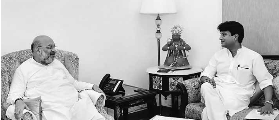
Union Home Minister Amit Shah with Civil Aviation Minister Jyotiraditya Scindia during a meeting in New Delhi.