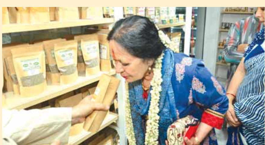
Kavach Natural was launched in the presence of luminaries such as Padma Vibhushan Dr Sonal Mansingh, MP, Rajya Sabha and singer-songwriter Daler Mehndi.

The group has over 20 GW of capacity under construction, including five GW of renewable energy projects. Uninterrupted supply of electricity through environment-friendly energy projects at affordable prices has been the hallmark of NTPC.