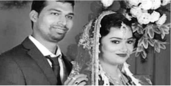
PNS ■ PARALAKHEMUNDI