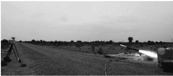
PNS ■ BALESWAR

In a major boost towards Aatma Nirbhar Bharat and strengthening of Indian Army, the Defence Research and Development Organisation (DRDO) successfully flight-tested indigenously-developed low-weight, fire-and-forget Man Portable Anti Tank Guided Missile (MPATGM) on Wednesday, said a DRDO Press release. The missile was launched from a man portable launcher integrated with a thermal site and the target was mimicking a tank. The missile hit the target in direct attack mode and destroyed it with precision. The test validated