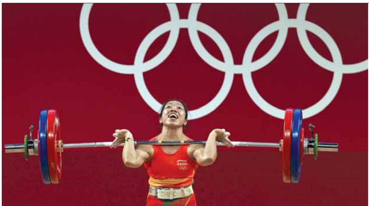
Mirabai Chanu reacts during a successful attempt in the 49 kg category of Womens Weightlifting event of the Summer Olympics 2020 in Tokyo on Saturday

21-year-long wait for weightlifting medal at Olympics ends