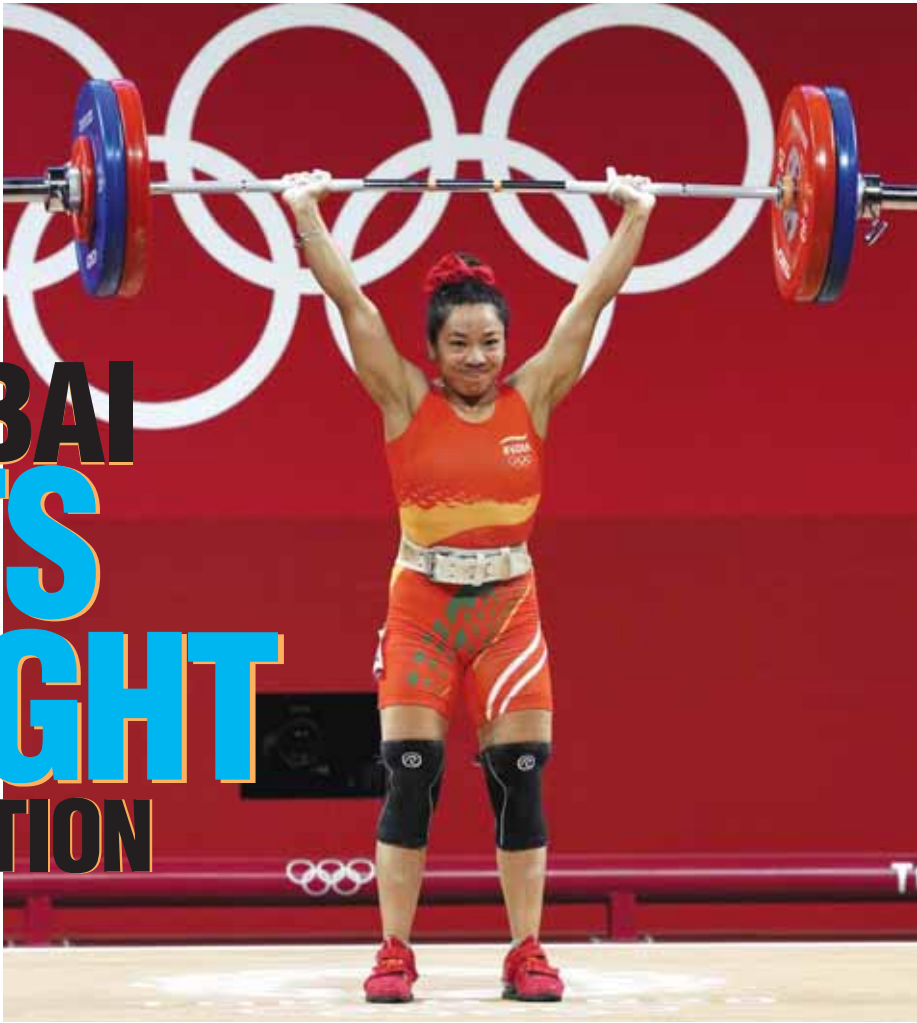
Mirabai Chanu Saikhom competes in the women's 49kg weightlifting event at the 2020 Olympics on Saturday

Chanu revealed that after the Rio Games debacle she changed her training and technique completely so that she could redeem herself in Tokyo. Competing in her second Olympics, Chanu claimed the Silver medal in the 49kg category with a total of 202kg (87kg+115kg). It was India's second Olympic medal in the sport after Karnam Malleswari's Bronze that came 21 years ago