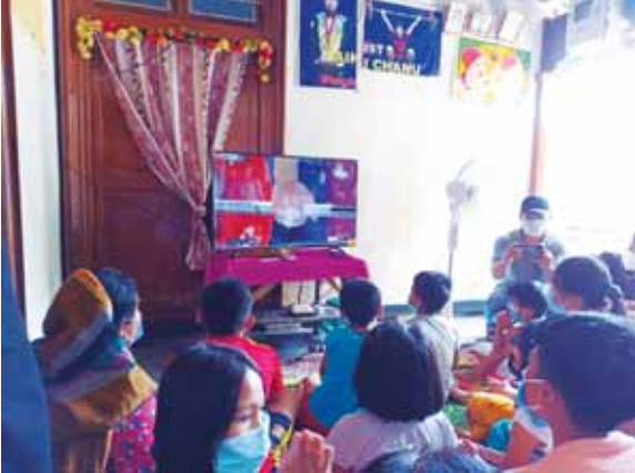
Family members and neighbours of Mirabai Chanu gather together to watch her lift

“She had told us she will win Gold or at least a medal. So, everybody was waiting for it to happen. Many of our relatives who lived far came last evening. They stayed overnight with us,” Chanu's mother said.