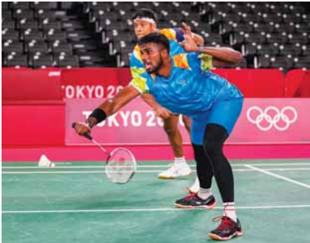
India's Satwiksairaj Rankireddy and Chirag Shetty compete against Taiwan's Lee Yang and Wang Chi Lin during their men's doubles group stage match

However, 13th seeded B Sai Praneeth suffered a demoralising 17-21, 15-21 loss to world number 47 Misha Zilberman of Israel in a 41-minute men's singles group D match.