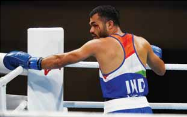
Vikas Krishan stands in his corner during his men's 69-kg boxing match