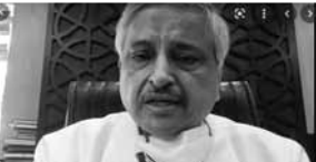
■ NEW DELHI

All India Institute of Medical Sciences (AIIMS) Director Dr Randeep Guleria on Saturday said that India might have to adopt a booster dose with second-generation Covid-19 vaccines as the Delta variant of the coronavirus has swept across the world and driven up infections in several countries.