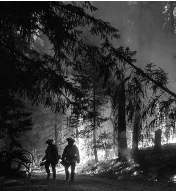
Firefighters light a backfire to stop the Dixie Fire from spreading near Prattville in Plumas County, Calif. on Friday