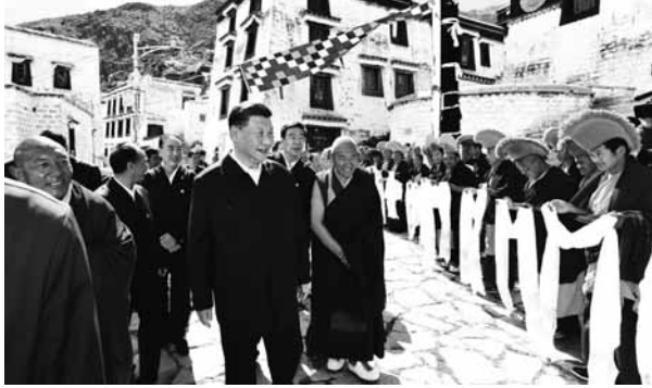
Chinese President Xi Jinping visits the Drepung Monastery located in the western suburbs of Lhasa, southwestern China's Tibet Autonomous Region on Thursday

Xi, also General Secretary of the ruling Communist Party of China (CPC) and Chairman of the Central Military Commission, met top officials of the Tibet Military Command of the People's Liberation Army, guarding China's border with India in Arunachal