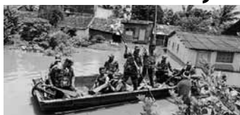
Army personnel during a rescue operation at a flooded area after rain in Kolhapur

"The rain and the consequent floods wreaked havoc in places like Chiplun, Mahad and Khed. The people have suffered huge losses. The state government will do everything to ensure that you are back on your feet,"