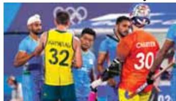
India's Manpreet Singh, center right, meets with Australia's Jeremy Thomas Hayward (32) and goalkeeper Andrew Lewis Charter (30) after their men's field hockey match at the 2020 Summer Olympics on Sunday in Tokyo, Japan

Australia looked dominant and were in complete control