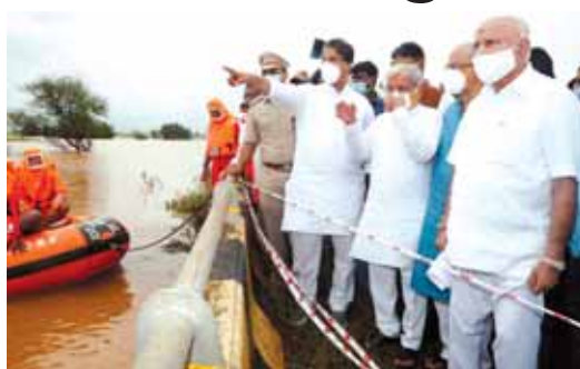
Karnataka Chief Minister BS Yediyurappa visits area affected with rain-water in Belgaum district on Sunday

Given that 'Lingayat' seers are demanding that there should not be any change of