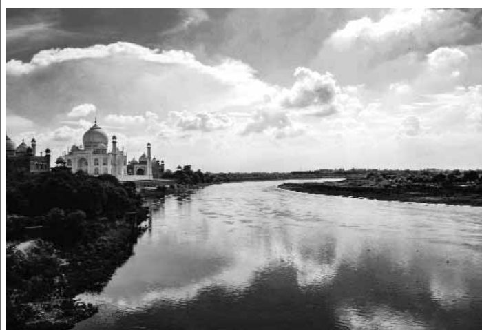
A view of the Yamuna river flowing behind the Taj Mahal in Agra on Sunday

Gujarat's Covid-19 figures are as follows: Positive cases 8,24,713, new cases 30, death toll 10,076, discharged 8,14,307, active cases 330, people tested so far - figures not released.