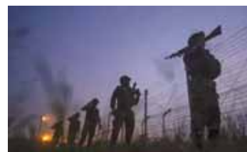
The process of mapping the police stations falling under the border belt is underway.

While the ITBP secures the frontier with China, the BSF is deployed along the borders with Pakistan and Bangladesh. The Sashasthra Seema Bal (SSB) secures the borders with Nepal and Bhutan. The Assam Rifles is deployed along the border with Myanmar.