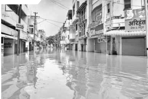
A submerged Old Sangli area after the Krishna river's level rose following rainfall