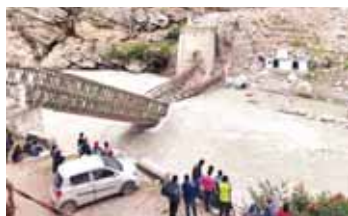
A bridge collapsed after a landslide at Batsari of Sangla valley in Kinnaur district on Sunday

A terrifying video footage of the landslide showed large