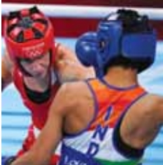
Germany's Nadine Apetz, left, looks for an opening against Lovlina Borgohain during their 69kg boxing match

The 35-year-old Apetz was the first German woman to qualify for a boxing event at the Olympics. She is a two-time world championship Bronze-medallist and a former European champion.