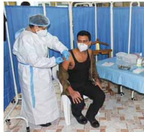
A medic inoculates a dose of Covid-19 vaccine to a beneficiary in New Delhi on Tuesday

from more than 600 people aged 18 and above, the findings of the study were consistent across all groups of people, regardless of age, chronic illnesses or sex, researchers said.