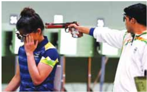
Manu Bhaker & Saurabh Chaudhary during 10m Air Pistol mixed team event

Tokyo: Indian shooters endured yet another forgettable outing at the Tokyo Olympics on Tuesday as they crashed out in the qualifying stages of the mixed team events in both pistol and rifle.