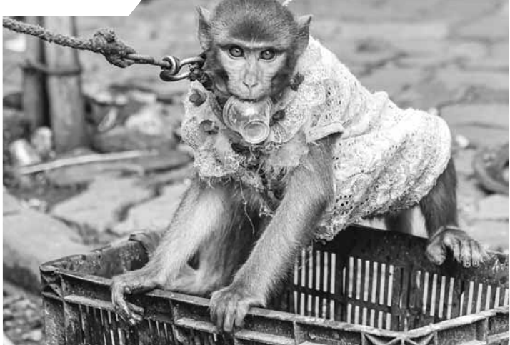
A pet monkey enjoys tea from a plastic cup collected from a roadside garbage box, in Kolkata