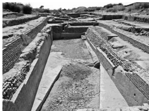
dates back to the 13th century.

UNESCO has already given India a new world heritage site in the form of the Rudreswara/ Ramappa Temple in Telangana, which