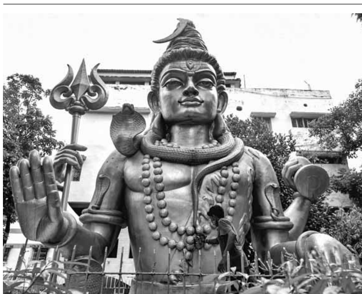
A worker cleans a huge idol of Lord Shiva during Shrawan month, in Kolkata on Tuesday