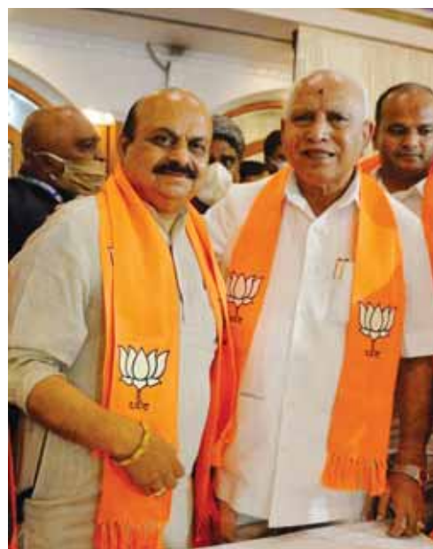
Newly elected Karnataka Chief Minister Basavaraj Bommai with outgoing State Chief Minister BS Yediyurappa during BJP Legislature Party meeting in Bengaluru on Tuesday

Yediyurappa himself belongs to the Veerashaiva-Lingayat community which is seen to be the BJP's core support base in Karnataka.