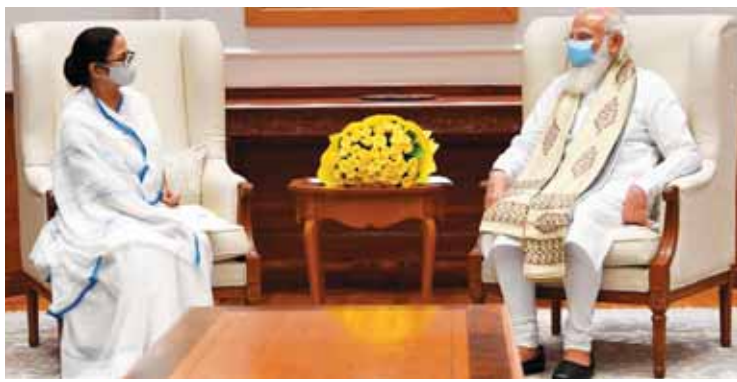
Prime Minister Narendra Modi with West Bengal CM Mamata Banerjee during their meeting in New Delhi on Tuesday

"We have not discussed any strategy. That will be discussed