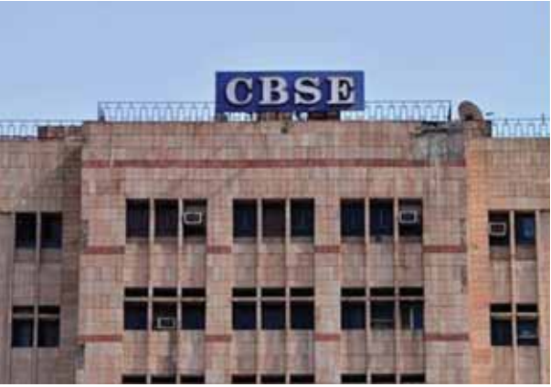
NEW DELHI

The Central Board of Secondary Education (CBSE) on Wednesday extended the deadline for schools to prepare the Class 12th results to July 25. Earlier, the deadline was July 22. This means, now both the Class 10th and 12th Board results, would be delayed as the time for declaration of Class 10th results by early this week has already passed. Without indicating that there could be delay in declaration of the Board results, the CBSE said that along with University Grants Commission (UGC), it is looking into the interest of all the students and hence, the university regulator would be synchronising admis-