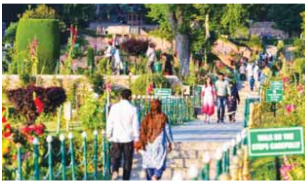
Couples and families walk at Mughal Garden Nishat Bagh in Srinagar

According to a notification issued by the General Administration department on Tuesday, "In exercise of the powers conferred by the proviso to Article 309 of the Constitution of India, read with Section 15 of the Jammu and Kashmir Civil Services Act 2010, the Government