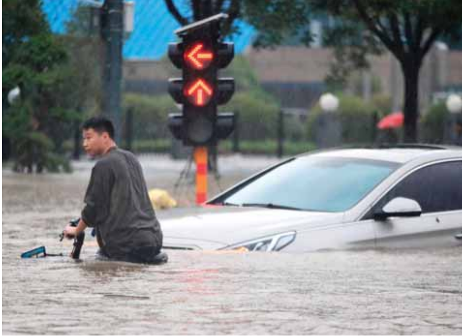
A man rides a bicycle through a flooded intersection in Zhengzhou in central China's Henan Province on Tuesday

Heavy waterlogging has led to the virtual paralysis of the city's road traffic.