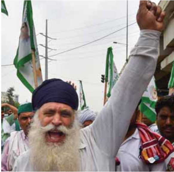
A farmer raises slogans during a protest against three farm laws, at Ghazipur border