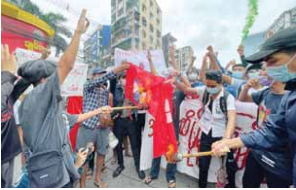
Protesters burn Myanmar Armed Forces' flags during a flash mob protest at Mingalar Taung Nyunt township in Yangon, Myanmar