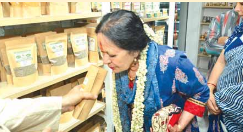
Kavach Natural was launched in the presence of luminaries such as Padma Vibhushan Dr Sonal Mansingh, MP, Rajya Sabha and singer-songwriter Daler Mehndi.

The group has over 20 GW of capacity under construction, including five GW of renewable energy projects. Uninterrupted supply of electricity through environment-friendly energy projects at affordable prices has been the hallmark of NTPC.