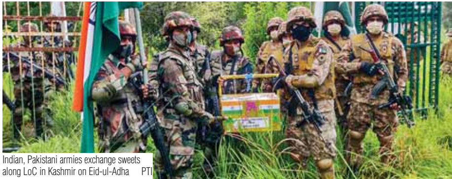
Indian, Pakistani armies exchange sweets along LoC in Kashmir on Eid-ul-Adha

also issued warnings following unusual movement of heavily armed terrorists camping across different launching pads inside Pakistan Occupied Jammu & Kashmir. According to a Srinagar based Defence Spokesman, "On the occasion of Eid-ul-Adha and as a gesture for promoting Peace, Harmony & Compassion in the true spirit of the festival, India and Pakistan armies held a flag meeting and exchanged sweets at Kaman Aman Setu, Uri &