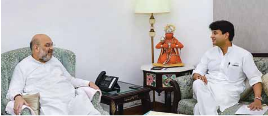
Union Home Minister Amit Shah with Civil Aviation Minister Jyotiraditya Scindia during a meeting in New Delhi.