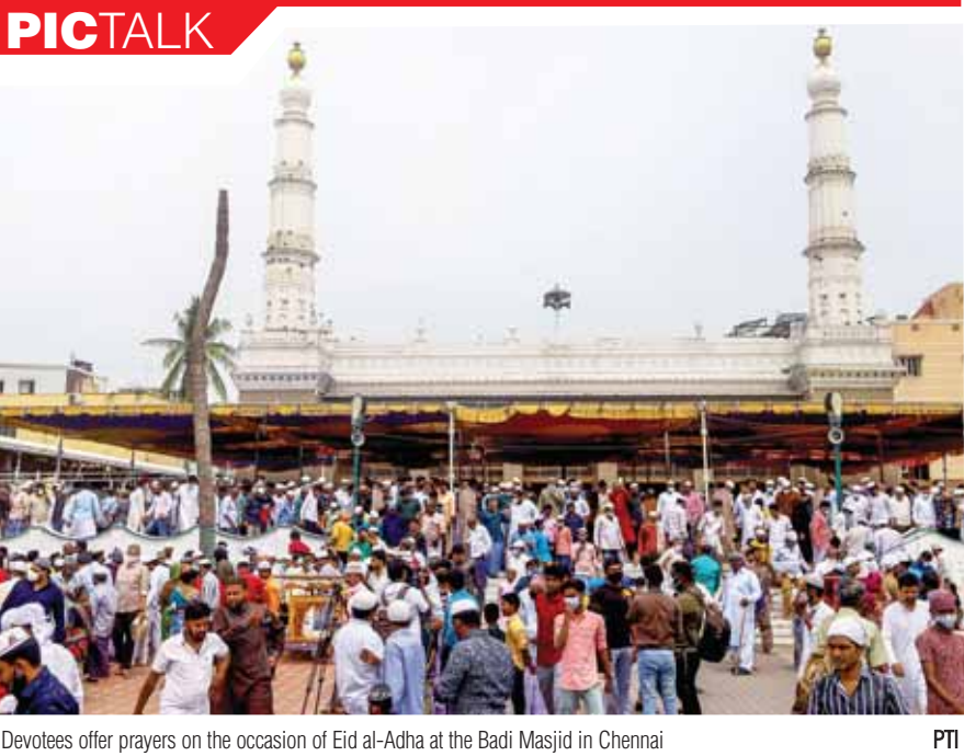
Devotees offer prayers on the occasion of Eid al-Adha at the Badi Masjid in Chennai