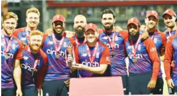
England players pose for photo with the T20I series trophy after win

On Wednesday, media reports came in that Britain will have no more than 30 athletes taking part in the ceremony due to Covid-19 fears. Great Britain has 376 athletes in fray at the Games.