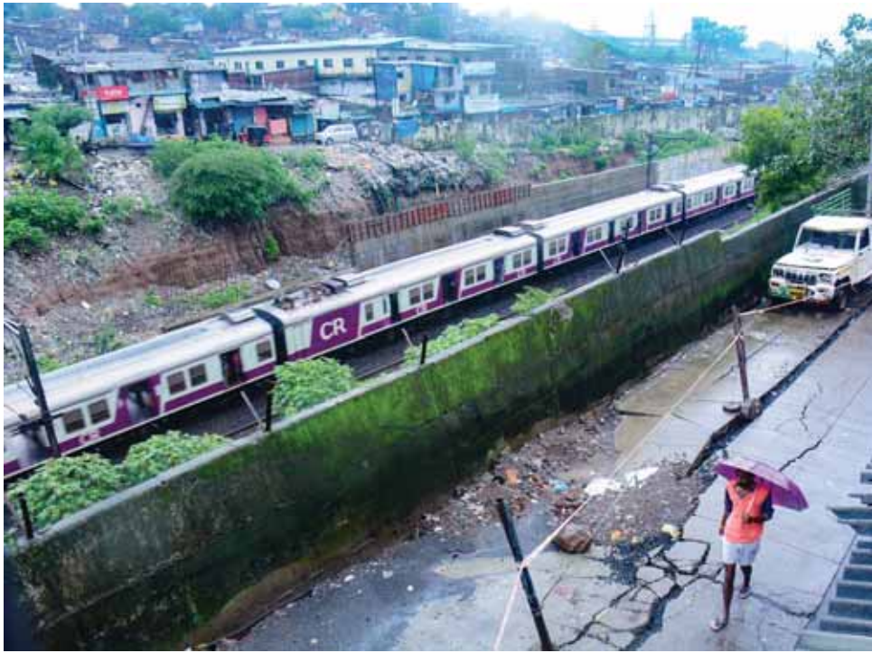
A damaged road along a railway track after incessant rain, at Kalwa in Thane on Wednesday