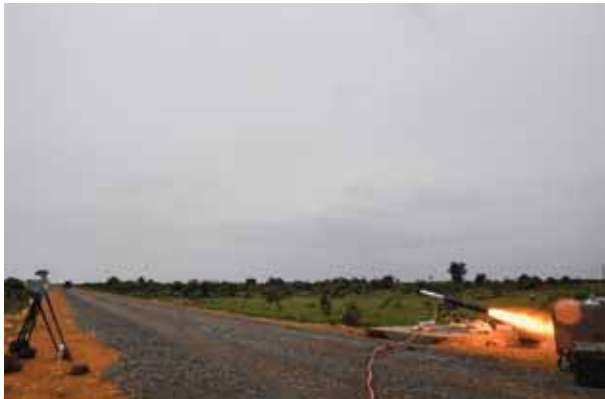
DRDO successfully flight-tests indigenously-developed MPATGM for minimum range

Fire and forget, anti-tank guided missile developed indigenously