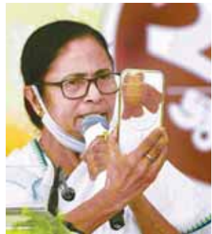
West Bengal CM Mamata Banerjee shows her taped phone while speaking on the Pegasus spyware row during virtual Sahid Divas in Kolkata

"I ask all the national leaders from all the States to make a Front and start working on a plan well in advance to overthrow this anti-people Government from the Centre. ... there is no point starting late because calling the doctor after the disease has set in makes no sense," Banerjee said. She was