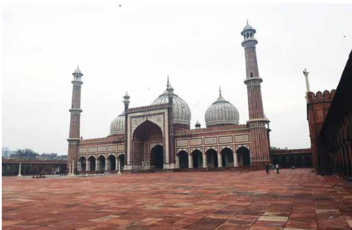
Following Covid norms: Jama Masjid wears a deserted look on Eid al-Adha during the ongoing pandemic in New Delhi on Wednesday