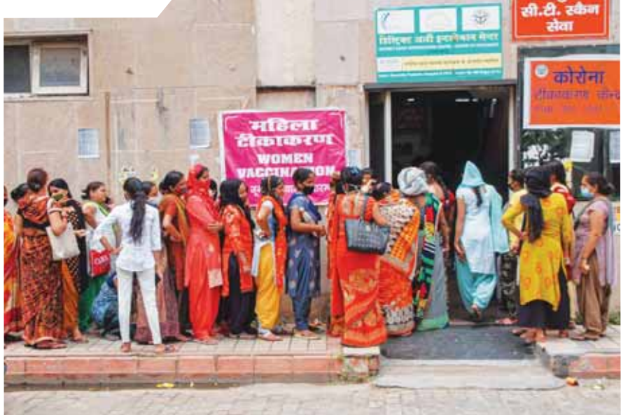
Jab-seekers wait in a queue to receive the COVID-19 vaccine, at a district hospital in Noida