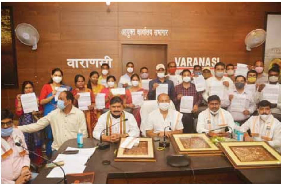
Teachers getting appointment letters in Varanasi on Friday