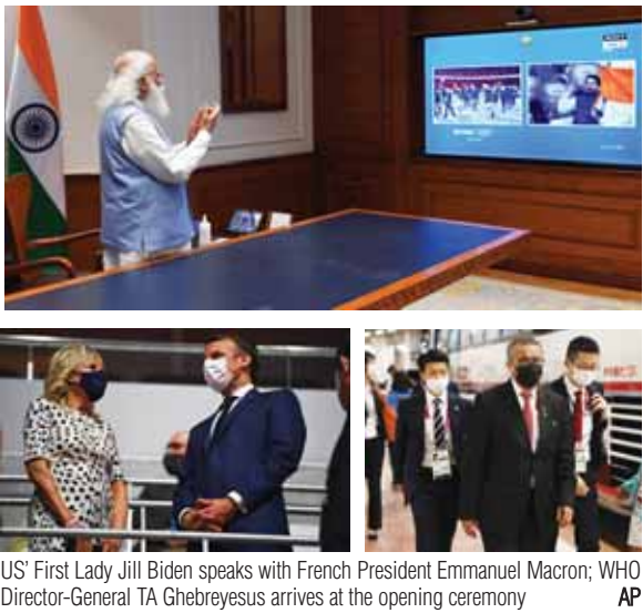
US' First Lady Jill Biden speaks with French President Emmanuel Macron; WHO Director-General TA Ghebreyesus arrives at the opening ceremony