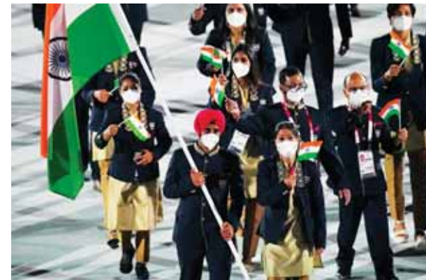
Chungneijiang Mery Kom Hmangte and Manpreet Singh of India carry Tricolour during the opening ceremony in the Olympic Stadium at the 2020 Summer Olympics on Friday

Despite the ban on crowd, the stadium was occupied by