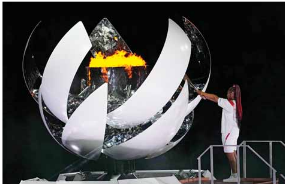
Naomi Osaka lights the Olympic flame during the opening ceremony in the Olympic Stadium on Friday