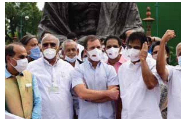
Congress leader Rahul Gandhi with party leaders, DMK and other parties' MPs stage a protest near the Gandhi statue against Pegasus project during the Monsoon Session of Parliament in New Delhi on Friday