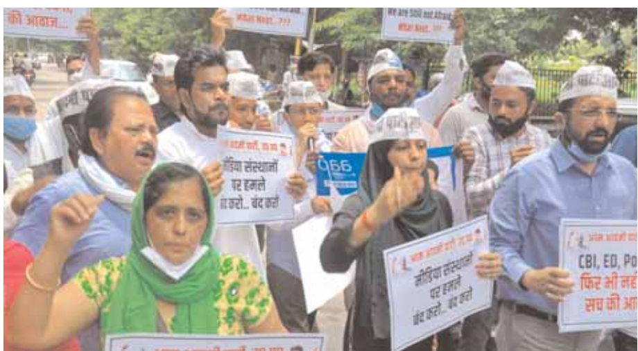
AAP members protesting I-T raids on media, in Lucknow on Friday