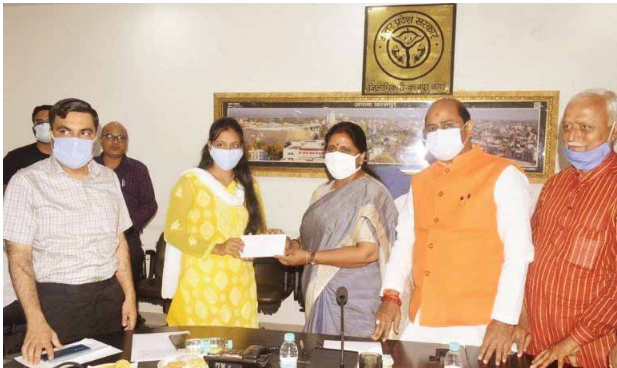
Higher Education Minister, Nilima Katiyar, distributing appointment letters to 32 selected teachers at Collectorate on Friday.