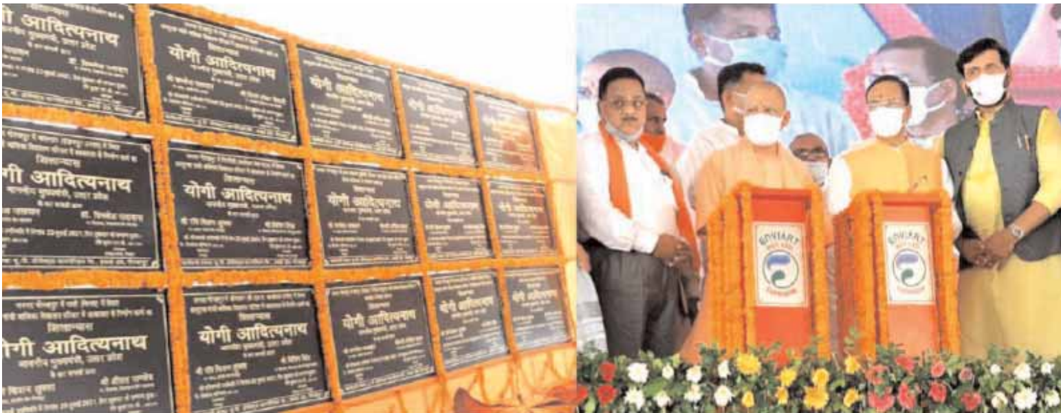
Chief Minister Yogi Adityanath laying the foundation stone of Sainik School along with Deputy Chief Minister Dinesh Sharma in Gorakhpur fertilizer factory premises on Friday

The chief minister said that Sainik Schools had their own history. He said the first Sainik School in the state was