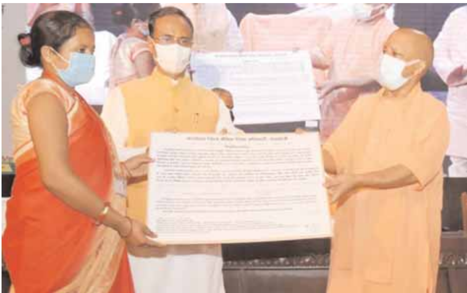
CM Yogi Adityanath and Deputy CM Dinesh Sharma giving appointment letter to an assistant teacher

"In case someone tries to corrupt the process, our agencies are alert. We have also vacated the jails for such people trying to play with the future of youths in Uttar Pradesh by tarnishing the process of recruitment. We have already taken strict action against all of them and the state