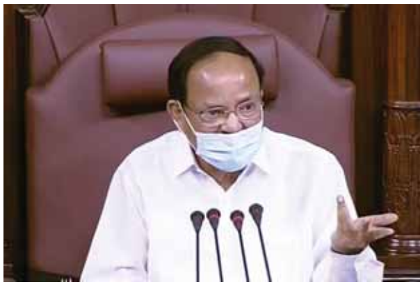
Rajya Sabha Chairman M Venkaiah Naidu conducts proceedings of the House during the Monsoon Session of Parliament in New Delhi on Friday

The Government made its intentions clear and soon after the obituary references and laying of papers, Minister of State for Parliamentary Affairs