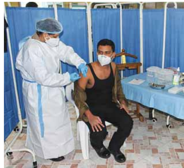
A medic inoculates a dose of Covid-19 vaccine to a beneficiary in New Delhi on Tuesday