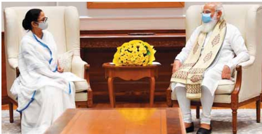
Prime Minister Narendra Modi with West Bengal CM Mamata Banerjee during their meeting in New Delhi on Tuesday

Apart from Sonia, Mamata is scheduled to meet top