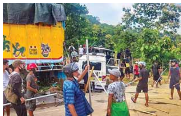
Locals near damaged security force vehicles after clashes on Monday night on the Assam-Mizoram border at Lailapur in Cachar district on Tuesday