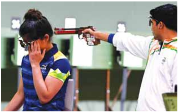
Manu Bhaker & Saurabh Chaudhary during 10m Air Pistol mixed team event