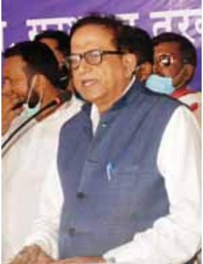
Satish Chandra Mishra addressing the gathering

The National General Secretary of BSP said that people from Brahmin and Dalit society are being harassed all over the state.