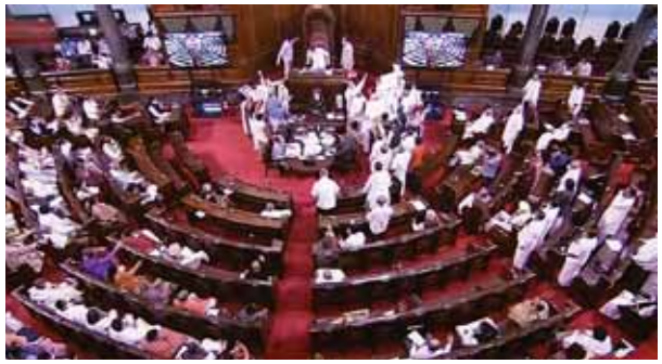
Members protest in the Well of the Rajya Sabha during the Monsoon Session of Parliament on Tuesday