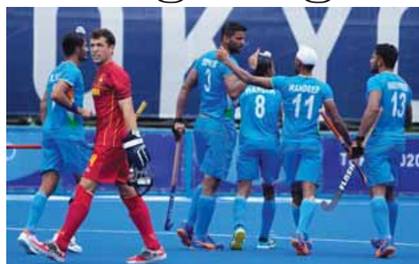
India's Rupinder Pal Singh celebrates after scoring against Spain during a men's field hockey match at the 2020 Summer Olympics on Tuesday

The performance so far has resurrected the ghosts of 2016 Rio Games when similar hype and expectations had ended in a deflating medal-less campaign.