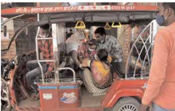
A woman being taken to a hospital in an e-rickshaw due to the strike by ambulance drivers