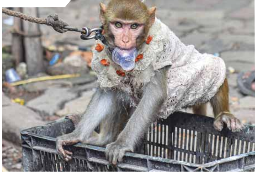
A pet monkey enjoys tea from a plastic cup collected from a roadside garbage box, in Kolkata