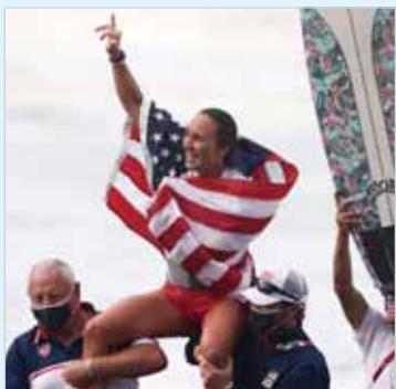
Carissa Moore of US celebrates winning Gold medal in the women's surfing competition