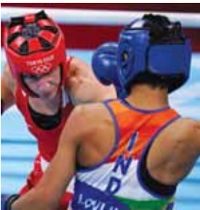
Germany's Nadine Apetz, left, looks for an opening against Lovlina Borgohain during their 69kg boxing match

The 23-year-old showed great poise in a tense contest to triumph by the thinnest of margins. She claimed all the three rounds on split points. The 35-year-old Apetz was the first German woman to qualify for a boxing event at the Olympics. She is a two-time world championship Bronze-medallist and a former European champion.