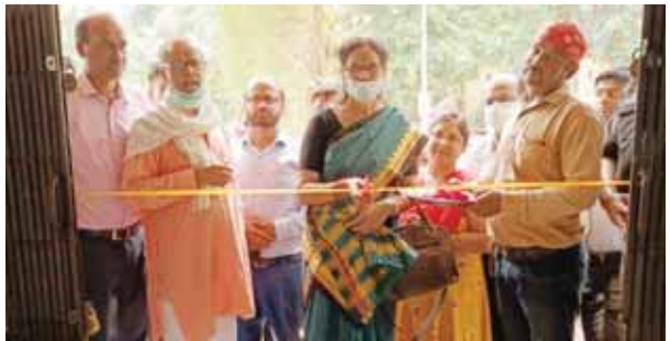
the new products of the bank and said it was meant for the

clients and appealed to them to avail themselves of the facility