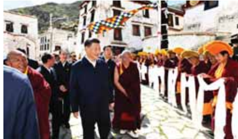
Chinese President Xi Jinping visits the Drepung Monastery located in the western suburbs of Lhasa, southwestern China's Tibet Autonomous Region on Thursday

Xi, also General Secretary of the ruling Communist Party of China (CPC) and Chairman of the Central Military Commission, met top officials of the Tibet Military Command of the People's Liberation Army, guarding China's border with India in Arunachal