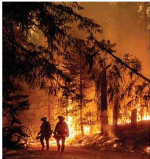
Firefighters light a backfire to stop the Dixie Fire from spreading near Prattville in Plumas County, Calif. on Friday

"Pakistan has a key role in a new US diplomatic offensive aimed at ensuring a peaceful transfer of power in Afghanistan," diplomatic sources told the newspaper on Friday. Under a deal with the Taliban, the US and its NATO allies agreed to withdraw all troops in return for a commitment by the militants that they would prevent extremist groups from operating in areas they control.