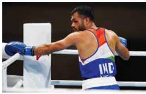
Vikas Krishan stands in his corner during his men's 69-kg boxing match