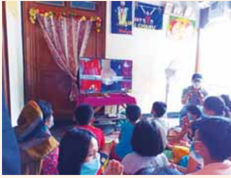
Family members and neighbours of Mirabai Chanu gather together to watch her lift