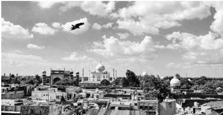
A view of clouds hover over the Taj Mahal in Agra on Saturday