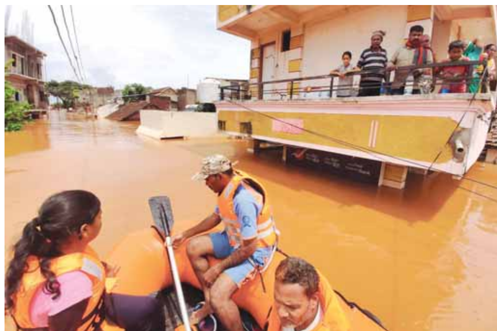
People stranded in floodwaters watch others being rescued at Kolhapur in Maharashtra on Saturday. Officials say landslides and flooding triggered by heavy monsoon rain have killed more than 100 people in western India

On April 20, the city had reported a record 28,395 cases. On April 22, the case positivity rate was 36.2 per cent, the highest so far. At 448, the highest number of deaths was reported on May 3.