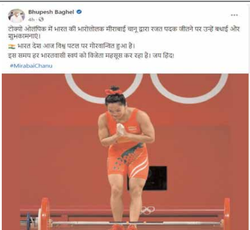
Chhattisgarh Chief Minister Bhupesh Baghel on Saturday greeted weightlifter Mirabai Chanu for winning the country's first silver medal in Tokyo Olympics. Mirabai won in the 49 kg category.

More farmers should adopt organic farming, horticulture and pulse production using vermicompost, he said, adding that this would provide better price in the market.