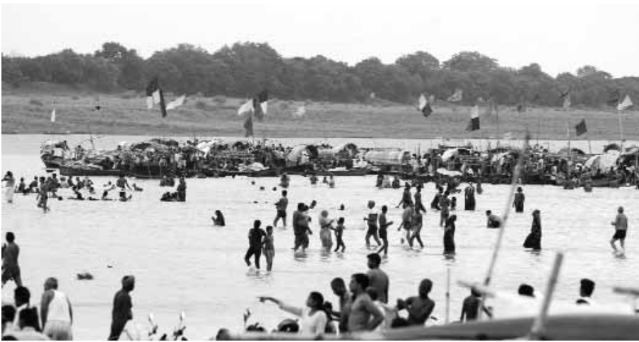
Hindu devotees take a holy dip in the Ganga river on the occasion of the Guru Purnima festival at Phaphamau in Prayagraj on Saturday