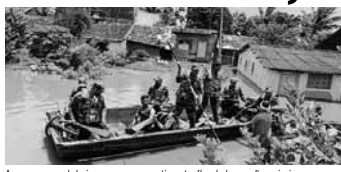
Army personnel during a rescue operation at a flooded area after rain in Kolhapur

"The rain and the consequent floods wreaked havoc in places like Chiplun, Mahad and Khed. The people have suffered huge losses. The state government will do everything to ensure that you are back on your feet,"