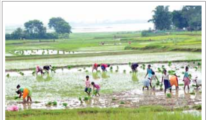
Farmers plant paddy saplings on their agriculture field at Hatia area of Ranchi city on Sunday

Election is just not an issue behind the extension of the period. Due to Covid 19 and lockdown the local bodies could not utilize grants under 15th finance commission and the grant will expire once the tenure of the elected bodies is over.