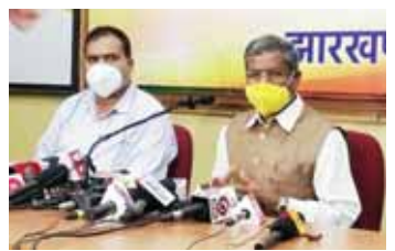
BJP Legislative leader Babulal Marandi, along with others, during a press conference at party office in Ranchi on Sunday.

Even before this, raids were conducted at 22 places in the state at the behest of the government. Raising the question, he said that the government should clarify on whose behest and on what information the raids are being conducted in the state. The tripartite alliance of the JMM, Congress and RJD won 47 out of the 81 seats in the 2019 Jharkhand Assembly election. Hemant Soren of the Jharkhand Mukti Morcha (JMM) was then appointed chief minister of the state.