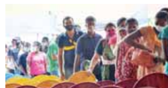
Beneficiaries wait in a queue to receive Covid-19 vaccine dose, at a vaccination centre in Ranchi on Sunday

Data released by the NHM on Sunday evening highlighted that the state has received 93,02,030 doses of Covishield and Covaxin doses from the Centre so far. The state, as per this data, has administered