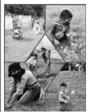
PNS ■ JAMSHEDPUR

A sapling of Mega Tree by the Union Home Minister, a mass tree plantation programme was organised at Uranium Corporation of India Limited (UCIL) Jadugora on Sunday.