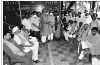
PNS ■ BOKARO