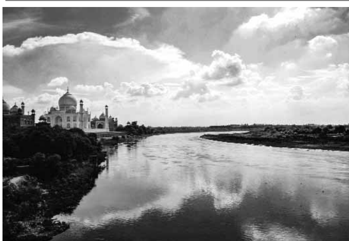
A view of the Yamuna river flowing behind the Taj Mahal in Agra on Sunday

Gujarat's Covid-19 figures are as follows: Positive cases 8,24,713, new cases 30, death toll 10,076, discharged 8,14,307, active cases 330, people tested so far - figures not released.