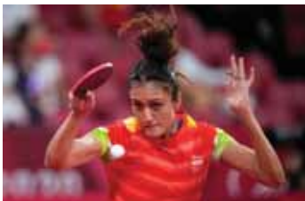
Manika Batra competes during TT women's singles second round match