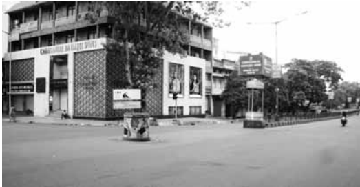
Police intensify vigil