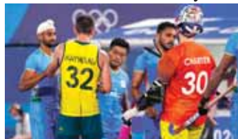
India's Manpreet Singh, center right, meets with Australia's Jeremy Thomas Hayward (32) and goalkeeper Andrew Lewis Charter (30) after their men's field hockey match at the 2020 Summer Olympics on Sunday in Tokyo, Japan

Australia looked dominant and were in complete