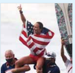
Carissa Moore of US celebrates winning Gold medal in the women's surfing competition