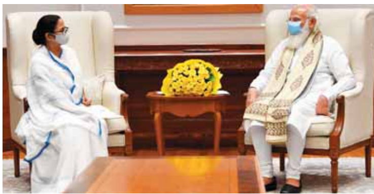
Prime Minister Narendra Modi with West Bengal CM Mamata Banerjee during their meeting in New Delhi on Tuesday

is scheduled to meet top Opposition leaders like NCP chief Sharad Pawar, Samajwadi