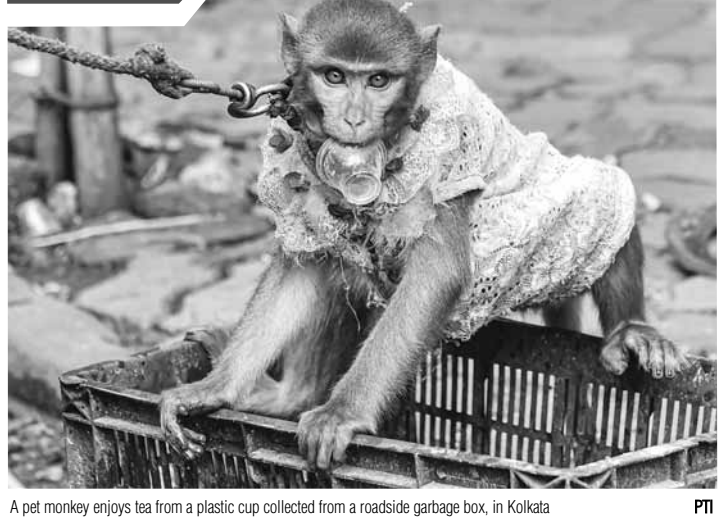
A pet monkey enjoys tea from a plastic cup collected from a roadside garbage box, in Kolkata