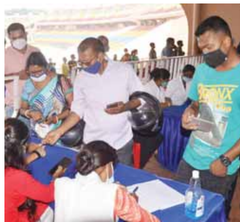
Beneficiaries wait in a queue to receive Covid-19 vaccine dose at a centre in Ranchi on Tuesday

Jharkhand on Tuesday vaccinated over 90,000 residents against Covid-19 after managing to inoculate over 1.45 lakh residents daily on an average in the past three days. As per provisional data released by the