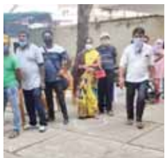
Beneficiaries wait in a queue to receive COVID-19 vaccine dose, at a vaccination centre in Ranchi on Tuesday

With at least 35,32,180 vaccine doses assured, Jharkhand will be in a position to inoculate at least 1 lakh residents daily in the month of August, health officials said. The state, as per records with the health department, has at least 3377 session sites for vaccination and the infrastructure to immunize over 3 lakh residents every day.