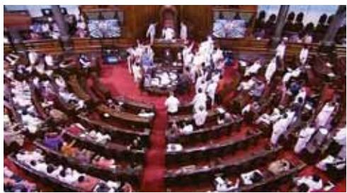
Members protest in the Well of the Rajya Sabha during the Monsoon Session of Parliament on Tuesday

As soon as the Rajya Sabha and the Lok Sabha resumed their sessions, the Opposition members began raising slogans in support of their demands for a probe.