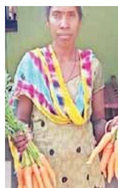
A woman farmer shows carrots produced at her kitchen garden

Positive changes are being recorded in the health of women and children of the village due to this scheme. The rate of malnutrition among women and children is still high in Jharkhand. Women in rural areas are suffering from anaemia. The State Government has started Dishom Guru Poshan Vatika Yojana to remove malnutrition among women and children and enable them to access healthy and nutritious food.