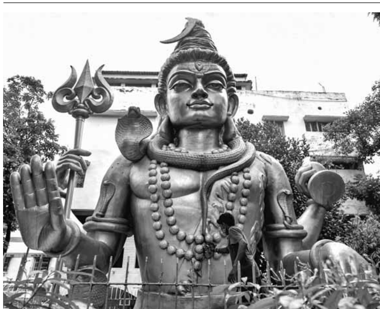
A worker cleans a huge idol of Lord Shiva during Shrawan month, in Kolkata on Tuesday