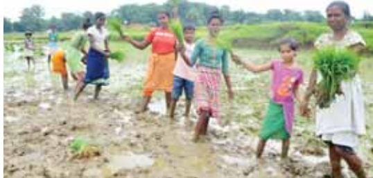
Farmers with their children plant paddy saplings in their agriculture field at Hatia area of Ranchi city

The government has decided to provide employment to the rural and migrant workers of the State in their villages and towns under the MGNREGA scheme. It was told by the MGNREGA commissioner that the workers working under the MGNREGA scheme belong to the poorest families of the State. When such a worker dies due to natural death or unnatural causes, the financial condition of the family becomes absolutely