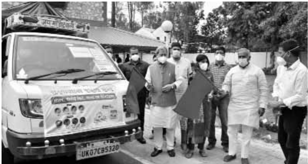
CM Tirath Singh Rawat and Cabinet Minister Arvind Pandey flag off a vehicle carrying ration and other items provided for the needy by a social organisation on Tuesday.....

The total number of cases in Chandigarh has reached 60,778, of which 685 are active cases. As many as 59,314 people have recovered from the infection so far while 779 people have succumbed to the virus. So far, 528,002 samples have been taken for testing.