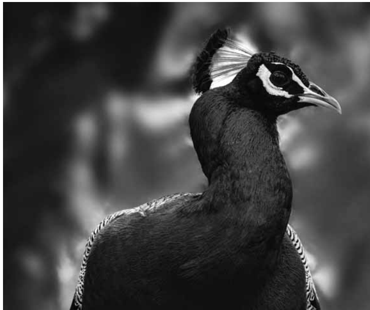
National bird peacock spotted during the second wave of the coronavirus pandemic, in Coimbatore on Tuesday