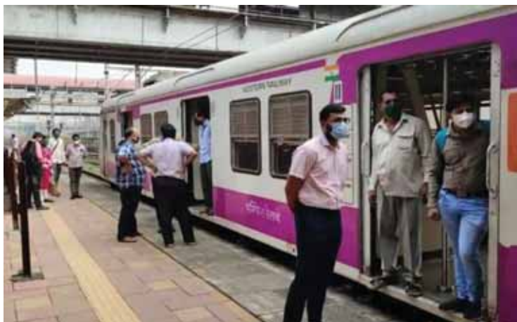
A Mumbai local train stranded due to a sudden and unplanned power outage

Meanwhile, the Ministry of Power on Monday said there is no impact on operations of Power System Operation Corporation (POSOCO) due to any malware attack and that