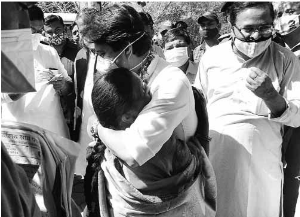
BJP leader and Rajya Sabha MP Jyotiraditya Scindia huga a woman while listening to the grievances of the public during his visit to Guna, Madhya Pradesh on Monday