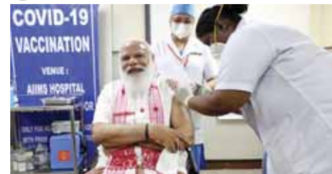
Prime Minister Narendra Modi is administered a Covid-19 vaccine in New Delhi on Monday

Vaccines provided to beneficiaries at the Government