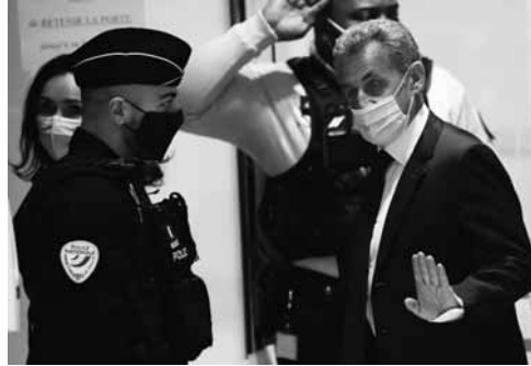
Former French President Nicolas Sarkozy arrives at the courtroom on Monday