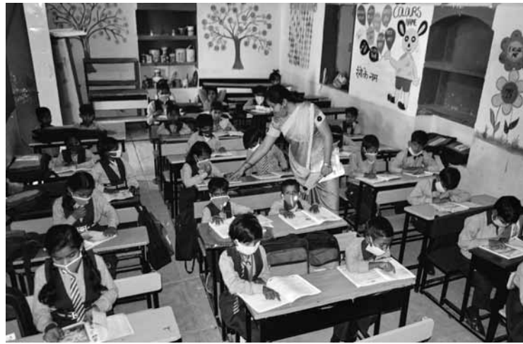
Students wearing masks attend a class after schools resumed for the students of classes 1st to 5th, with certain Covid-19 safety guidelines, in Mirzapur on Monday.

Police said preliminary investigation has revealed that the arrested person was in contact with JeM commander in Tral.