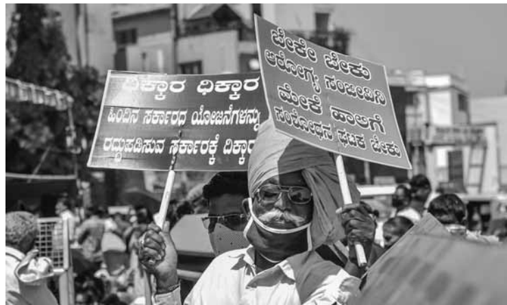
Members of Karnataka sheep and goat breeders during a protest to demand the implementation of Sadashiva Commission recommendations, in Bengaluru on Monday.