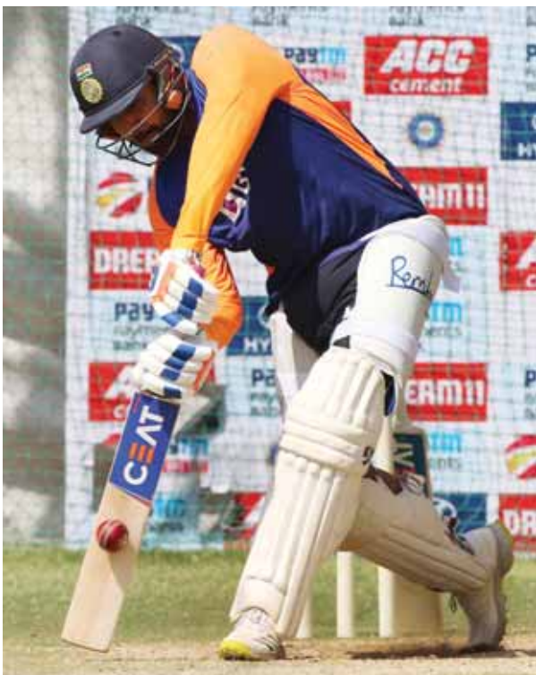
India opener Rohit Sharma bats during nets session ahead of fourth Test against England