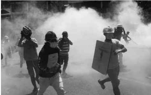
In this image from video, anti-coup protesters run away from tear gas launched by security forces on Monday

The coup reversed years of slow progress toward democracy in Myanmar after five decades of military rule. It came Feb. 1, the same day a newly elected Parliament was supposed to take office. Ousted leader Aung San Suu Kyi's party would have led that government, but instead she was detained along with