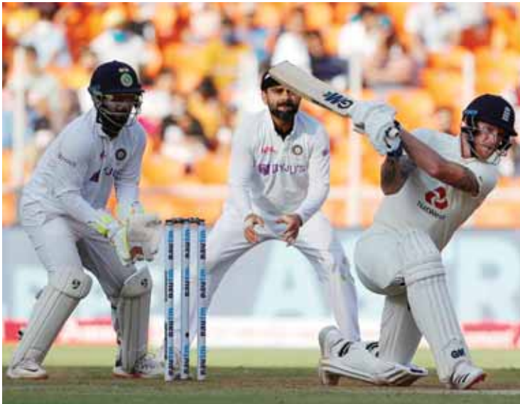
England all-rounder Ben Stokes plays shot against India during third Test in Ahmedabad

"I just felt that the ones who are moaning, in my opinion, should realise that there are times that you're going to get a seaming track, a ball that is basically jumping off a good length and everyone thinks that's a problem for batters," he reasoned.