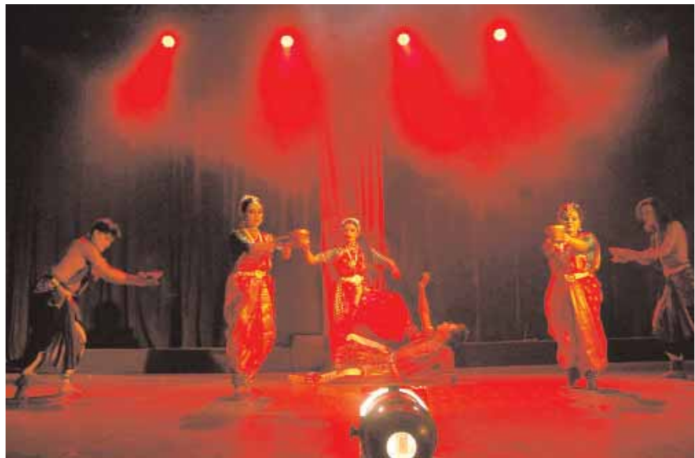
A scene from a dance drama 'Meera Ek Bhakti Gatha' presented by Kirti Ballet and Performing Arts group, at Shaheed Bhawan in Bhopal on Monday

The tincture dissolves in water and the note starts to appear clear. In this way, customers were duped by giving fake notes.