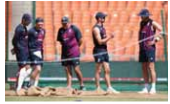
England coach Chris Silverwood, center, and players Ben Stokes, Dom Bess, James Anderson and Stuart Broad chat during team's training session.

"I think that as batters if you don't score runs, you will sure look at yourselves, you'll always try and find ways to improve and we've certainly done that."