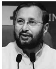
72 out of the 81 seats with Congress winning only one.

Congress drew zero seats in 18 municipalities and even Congress MLA lost poll," said BJP leader.