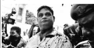
PNB ■ NEW DELHI

The Enforcement Directorate (ED), Patna, took possession of immovable property worth ₹1.45 crore, situated at New Delhi, in connection with a money laundering case relating to NGO Sewa Sankalp Ewam Vikas Samiti and its sister NGOs, embroiled in the physical and sexual abuse of women inmates.