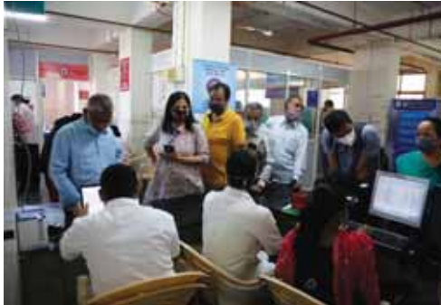
People register their names to receive the Covid-19 vaccine at Sola Civil hospital in Ahmedabad on Wednesday.

"Today is an important milestone in vaccine discovery, for science and our fight against coronavirus. With today's results from our Phase 3 clinical trials, we have now reported data on our Covid-19 vaccine from Phase 1, 2, and 3 trials involving around 27,000 participants," Bharat Biotech