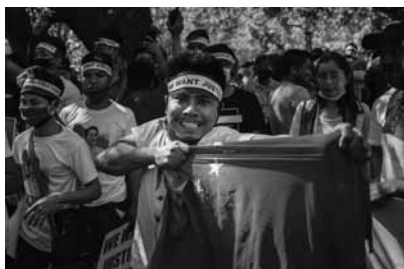
A Chin refugee from Myanmar tries to tear apart Chinese flag during a protest against military coup in Myanmar in New Delhi on Wednesday

"As a result, we are shy away from speaking about minorities and put on a public display of identifying with the cultural symbols of the majority which have largely been appropriated by the BJP. We have been forced to accept 'mistakes' made by our heroes because public mood appears to require it. Obviously this calls for careful balancing of reality and perception, strategy and ideology," he noted.