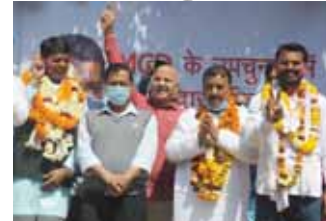
Delhi CM Arvind Kejriwal and Deputy CM Manish Sisodia with AAP candidates after results of bypolls to the Municipal Corporation of Delhi in New Delhi on Wednesday.

The people of Delhi have once again voted in the name of work. Congratulations to all.