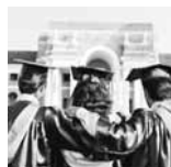
international, inter-dependence and global change.

Another welcome regulation is to monitor institutes mainly on the basis of research, academic excellence, its linkages and employability. There appears to be a clear framework of defining how the process of segregation of monitoring and financial powers in opening and shutting down of an institute would ensure transparency in the decision-making process. There have been lots of arguments among academicians about selection in higher education; and in this regard per se the main challenge is the pattern of selection in the contemporary context of increasing