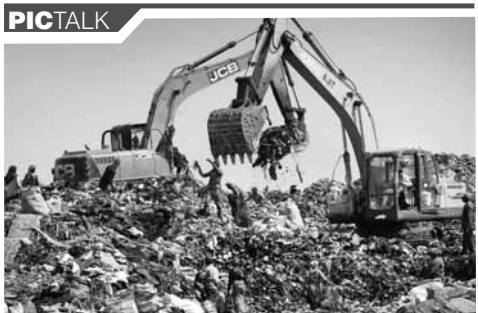
Workers at the Bhagawanwala dumpsite in Amritsar clear out waste on Wednesday