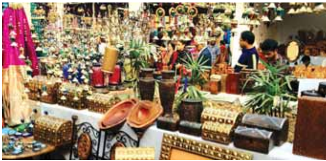
na shawls (called Lena ), clay models, dry fruits, hand-knitted items and seabuckthorn products.

Visitors were offered a chance to dress up in the colourful costumes of the Dard Aryans for ₹50 or get pictured with them. Around 76 artists from their karigars from the UT will stay put in Delhi over the next two weeks selling their uniquely crafted handloom and handicraft products such as pashmi-