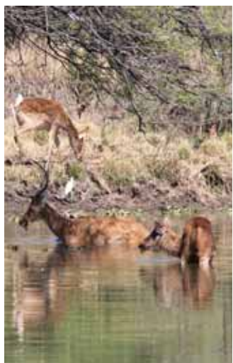
A Stag and Sambar cool themselves in a pond at Van Vihar National Park in Bhopal on Wednesday. The World Wildlife Day is being celebrated under the theme 'Forests and Livelihoods: Sustaining People and Planet'

Known for his anti-establishment views, Kashyap has long been a critic of the Narendra Modi Government, while Taapsee has minced no words when it came to the criticism of the Centre on social media platforms. Both of them have supported the farmers' agitation which has been going on the outskirts of the national Capital since November 26.