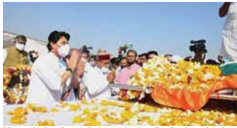
BJP leader and Rajya Sabha MP Jyoti Radhiya Scindia along with Union Ministers Thawar Chand Gehlot and Prahlad Patel (L) pays tributes to the mortal remains of BJP MP Nand Kumar Singh Chouhan during his funeral at his native place at Shahpur town, Bhatnagar district Madhya Pradesh on Wednesday

The order states that the present 114 category posts of printing presses have been adjusted in 13 categories, of which 8 are technical and 5 are non-technical category. In future, vacancies will be filled only in 7 categories of technical staff.