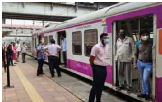
A Mumbai local train stranded due to a sudden and unplanned power outage

Meanwhile, the Ministry of Power on Monday said there is no impact on operations of Power System Operation Corporation (POSOCO) due to any malware attack and that