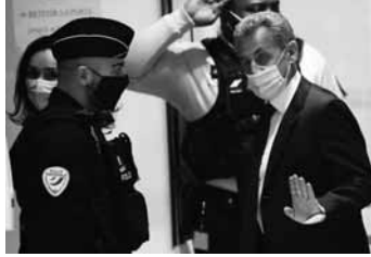
Former French President Nicolas Sarkozy arrives at the courtroom on Monday.