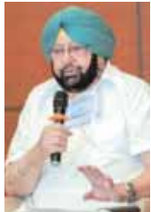
Happy to share that @PrashantKishor has joined me as my Principal Adviser. Look forward to working together for the betterment of the people of Punjab! CAPT AMARINDER BROKE THE NEWS ON TWITTER

Kishor had first made a name for himself as a poll strategist for Prime Minister Narendra Modi in his maiden