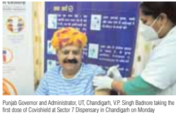
Punjab Governor and Administrator, UT, Chandigarh, VP Singh Badnore taking the first dose of Covid-19 vaccine at Sector 7 Dispensary in Chandigarh on Monday

were inoculated at 18 sites on Monday. This included 147 healthcare workers and 831 frontline workers, who got their first dose of vaccination, 187 HCWs who got second dose of vaccination, 493 people above 60 years of age and 63 people between the age group of 45-60 years with co-morbidities.