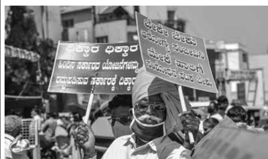
Members of Karalaka sheep and goat breeders during a protest to demand the implementation of Sadashiva Commission recommendations, in Bengaluru on Monday