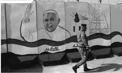
A mural depicting Pope Francis in Baghdad, Iraq