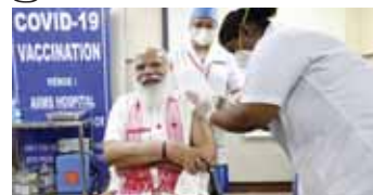
Prime Minister Narendra Modi is administered a Covid-19 vaccine in New Delhi on Monday

Vaccines provided to beneficiaries at the Government health facilities will be entire-