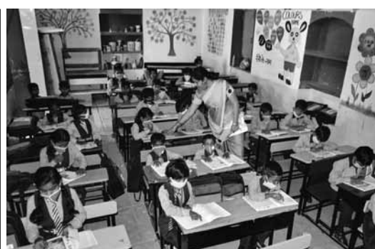
Students wearing masks attend a class after schools resumed for students of classes 1st to 5th, with certain Covid-19 safety guidelines, in Mirzapur on Monday

Srinagar: The Jammu and Kashmir Police have arrested a person, who was helping the Jaish-e-Mohammed (JeM) terrorists, at Awantipora in South Kashmir's Pulwama district and recovered incriminating material from his possession, police said on Monday. Police said following specific information about presence of terrorists in Larow Jager Tral was arrested. "Incriminating material of proscribed terrorist outfit JeM has been recovered from his possession. On his disclosure, one hand grenade was also recovered which he had concealed in the compound of his home," police said. Police said preliminary investigation has revealed that the arrested person was in contact with JeM commander in Tral. IAN S