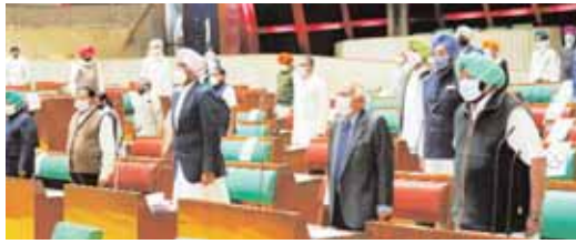
Punjab Vidhan Sabha on Monday paid tributes to eminent personalities, including farmers and farm labourers, who died during the ongoing farmers' agitation, freedom fighters and political personalities besides unsung Covid warriors, who had passed away since the last Session of the Assembly