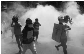
In this image from video, anti-coup protesters run away from tear gas launched by security forces on Monday.

The protesters in Yangon were chased as they tried to gather at their usual meeting spot at the Hledan Center intersection. Demonstrators scattered and sought in vain to rise the irritating gas from their eyes, but later regrouped. The coup reversed years of slow progress toward democracy in Myanmar after five decades of military rule. It came Feb. 1, the same day a newly elected Parliament was supposed to take office. Ousted leader Aung San Suu Kyi's party would have led that government, but instead she was detained along with