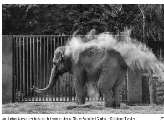
An elephant takes a dust bath at a hot summer day, at Alipore Zoological Garden in Kolkata on Tuesday

"He must have come to Mumbai with an expectation from the MVA government that the culprits who compelled him to take the extreme step would be punished by law," the two Congress leaders stated in their letter.