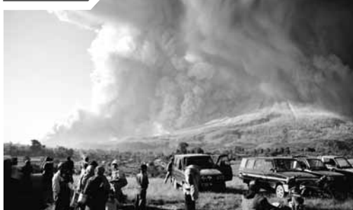
Mount Sinabung spews volcanic material during an eruption in Karo, North Sumatra, Indonesia, on Tuesday