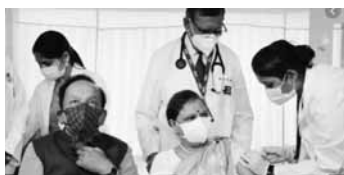
Union Health Minister Harsh Vardhan and his wife being administered the first dose of Covid-19 vaccine at the Delhi Heart and Lung Institute on Tuesday in the national Capital.

Those with specified comorbidities will have to produce a medical certificate attested by a registered medical practitioner at the time of vaccination at the Covid-19 vaccination centre. This phase is likely to cover close to 270 million beneficiaries. Beneficiaries will have to